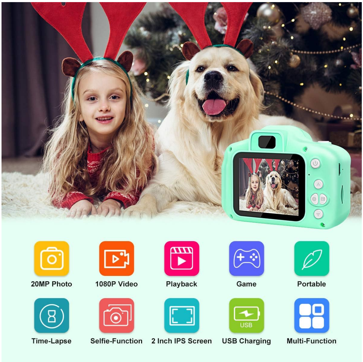
Image 1.1: Overview of the OZMI Kids Digital Camera and its key functions.