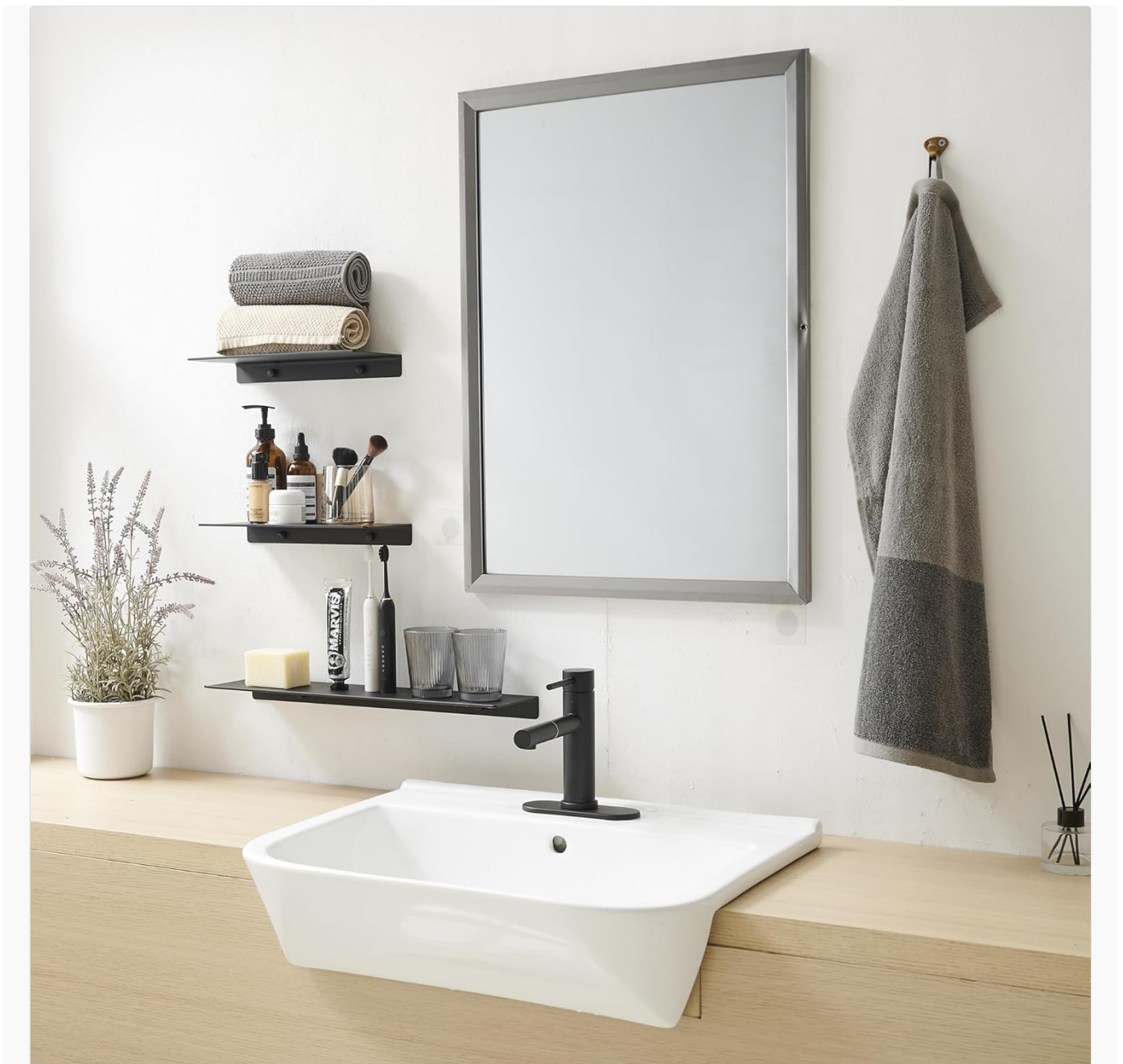
Figure 5.1: Shelf in a bathroom setting.