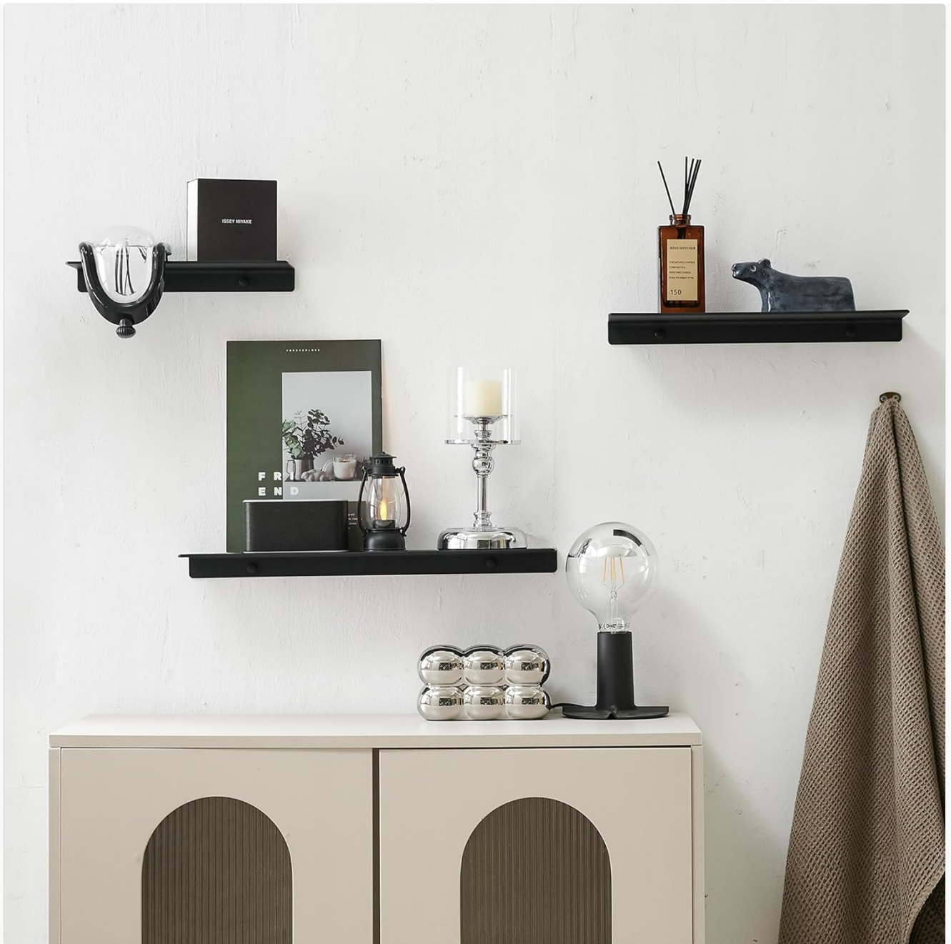
Figure 5.3: Shelf in a living room setting.