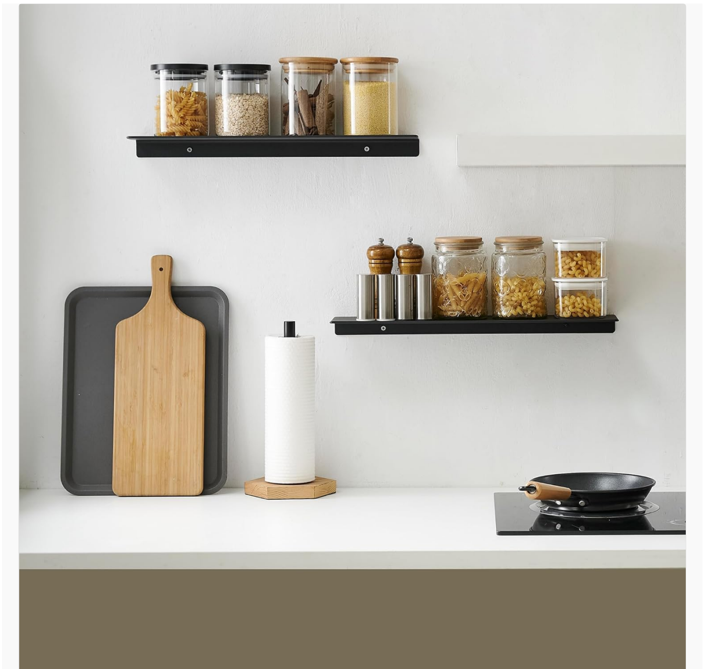
Figure 5.2: Shelf in a kitchen setting.