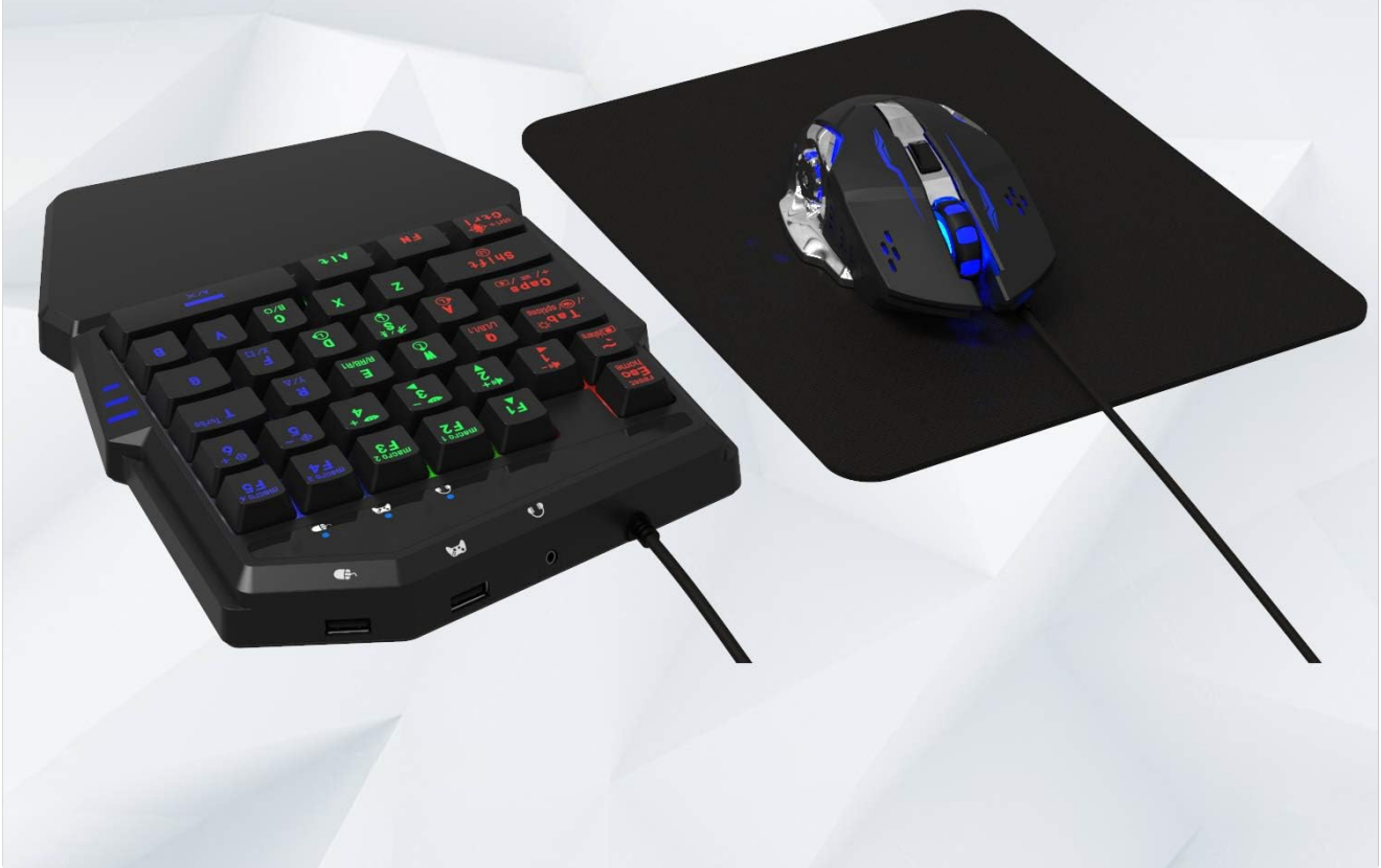
Image: The DarkWalker FO217 keyboard, highlighting its built-in headset jack for direct audio connection.

The headset jack is built in the keyboard. Party chat is available during gaming. No adapter required, plug in controller, mouse and headset to the keyboard and play.