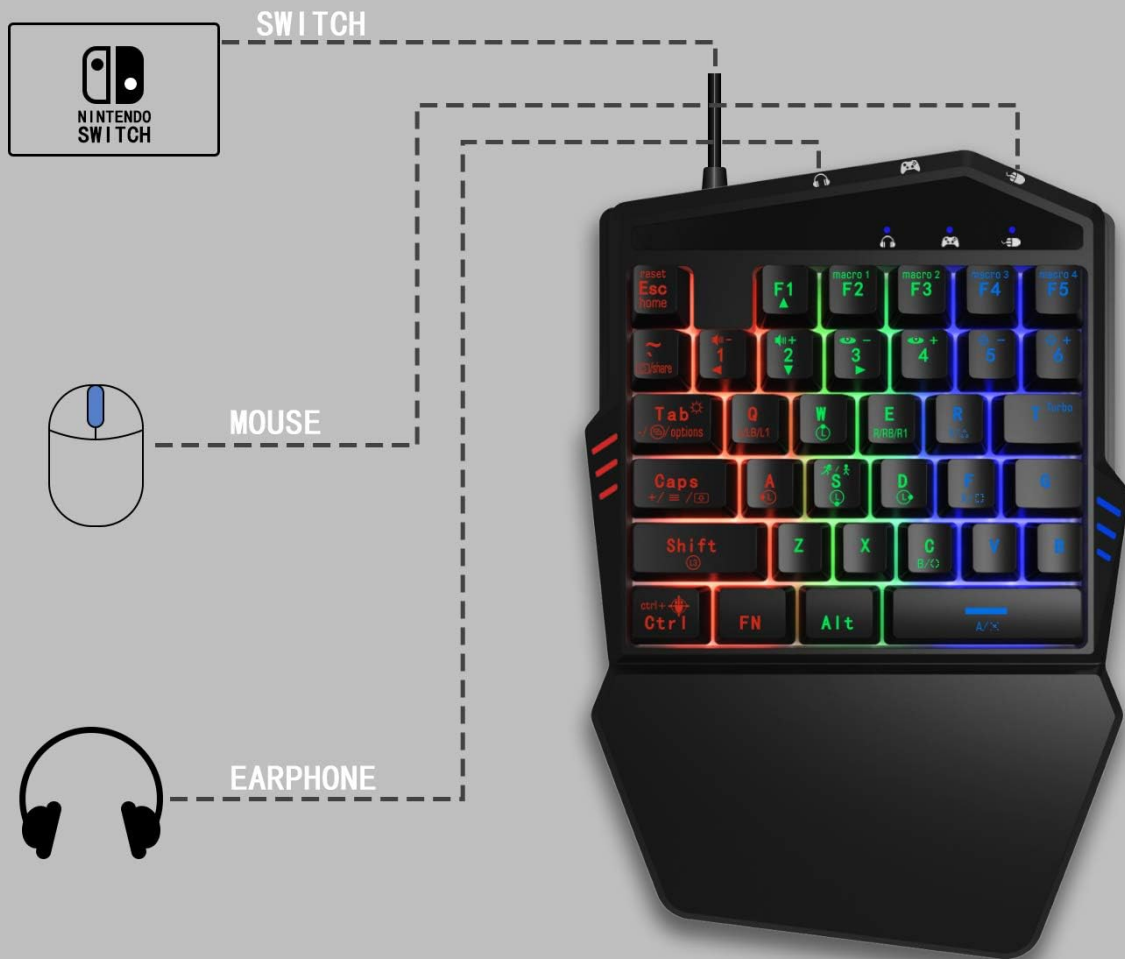
Image: Connection method for Nintendo Switch, showing how to connect the mouse, keyboard, and an earphone to the console.