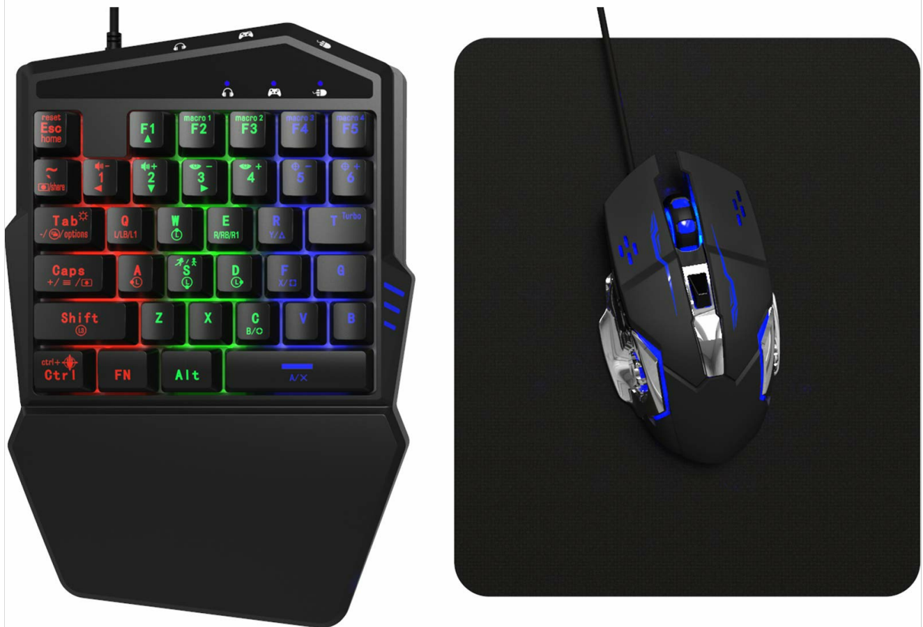
Image: The DarkWalker FO217 Gaming Pack, illustrating its compatibility with Nintendo Switch, Xbox One/360, and PS4/PS3 gaming consoles.