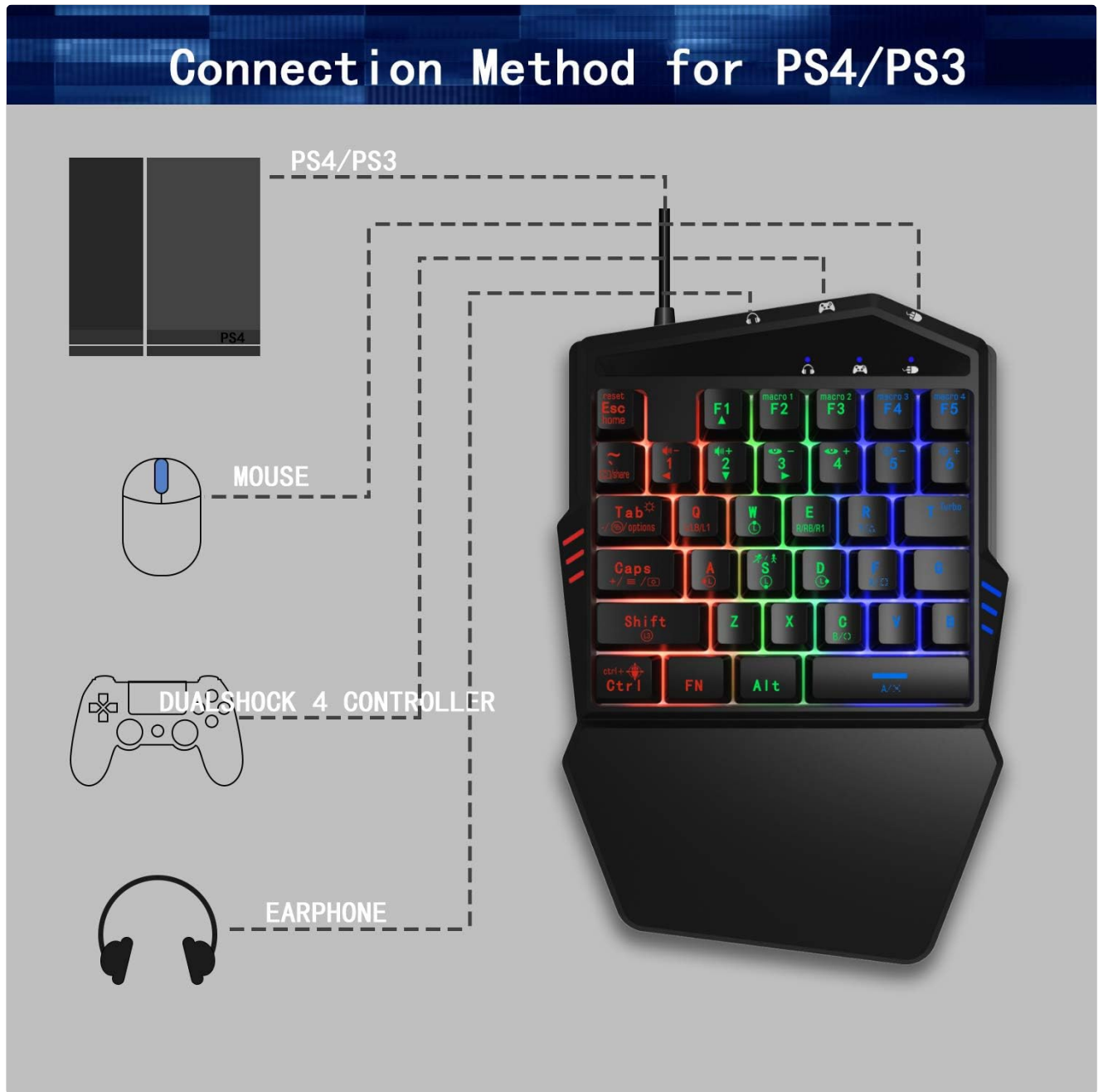
Image: Connection method for PS4/PS3, detailing how to connect the mouse, keyboard, a DualShock 4 controller, and an earphone to the console.

To use the FO217 on PS4 or PS3 consoles, an official DualShock 4 wireless controller is required for activation. Connect the keyboard, mouse, and your official controller to the console as illustrated below.