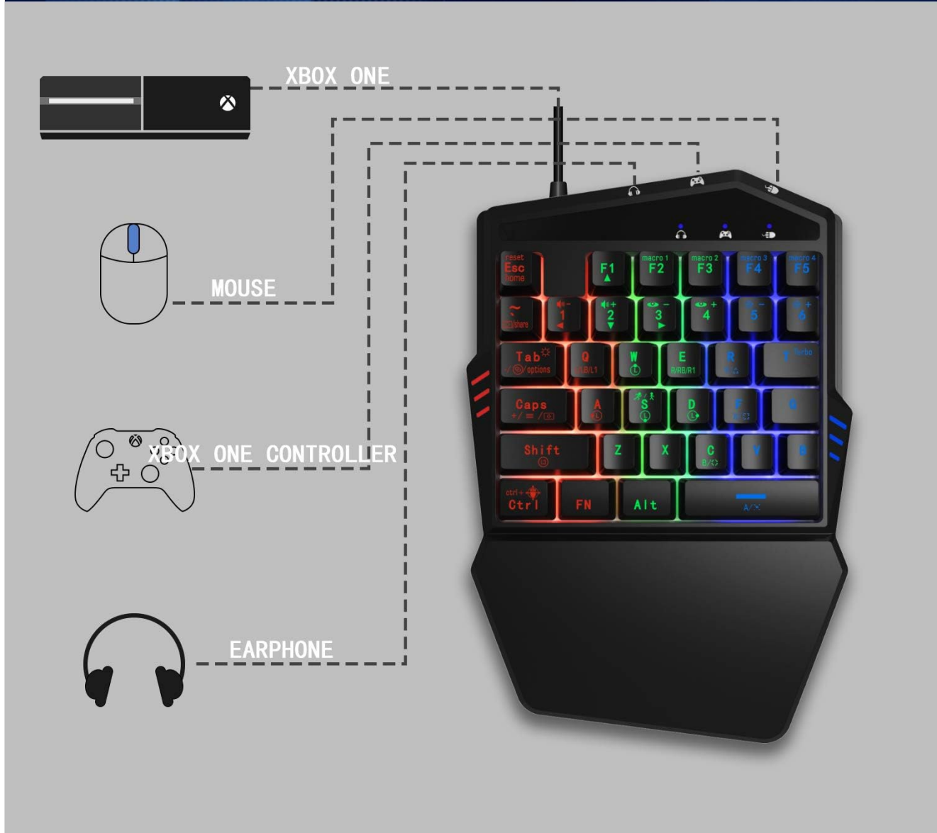
Image: Connection method for Xbox One/360, illustrating how to connect the mouse, keyboard, an Xbox One controller, and an earphone to the console.