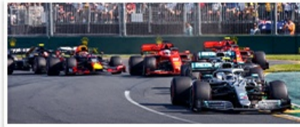
Fournisseur officiel de télévision pour la F1 en Australie pour la saison 2018-2020.