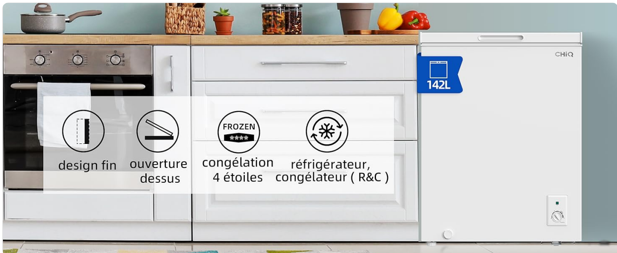
Figure 4.1: The CHI Q FCF142D Chest Freezer positioned in a kitchen setting, demonstrating the recommended spacing from adjacent furniture for optimal ventilation.