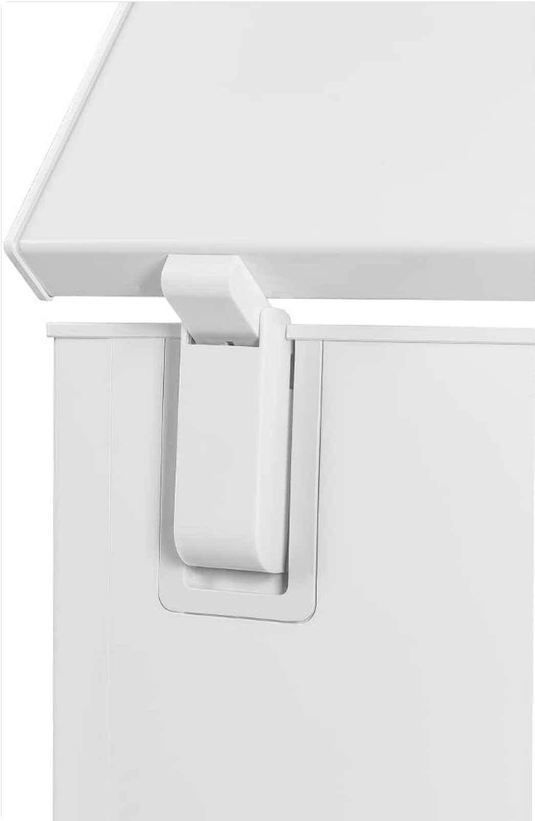
Figure 3.2: A detailed view of the robust hinge mechanism on the CHI Q FCF142D Chest Freezer, designed for smooth and stable lid operation.