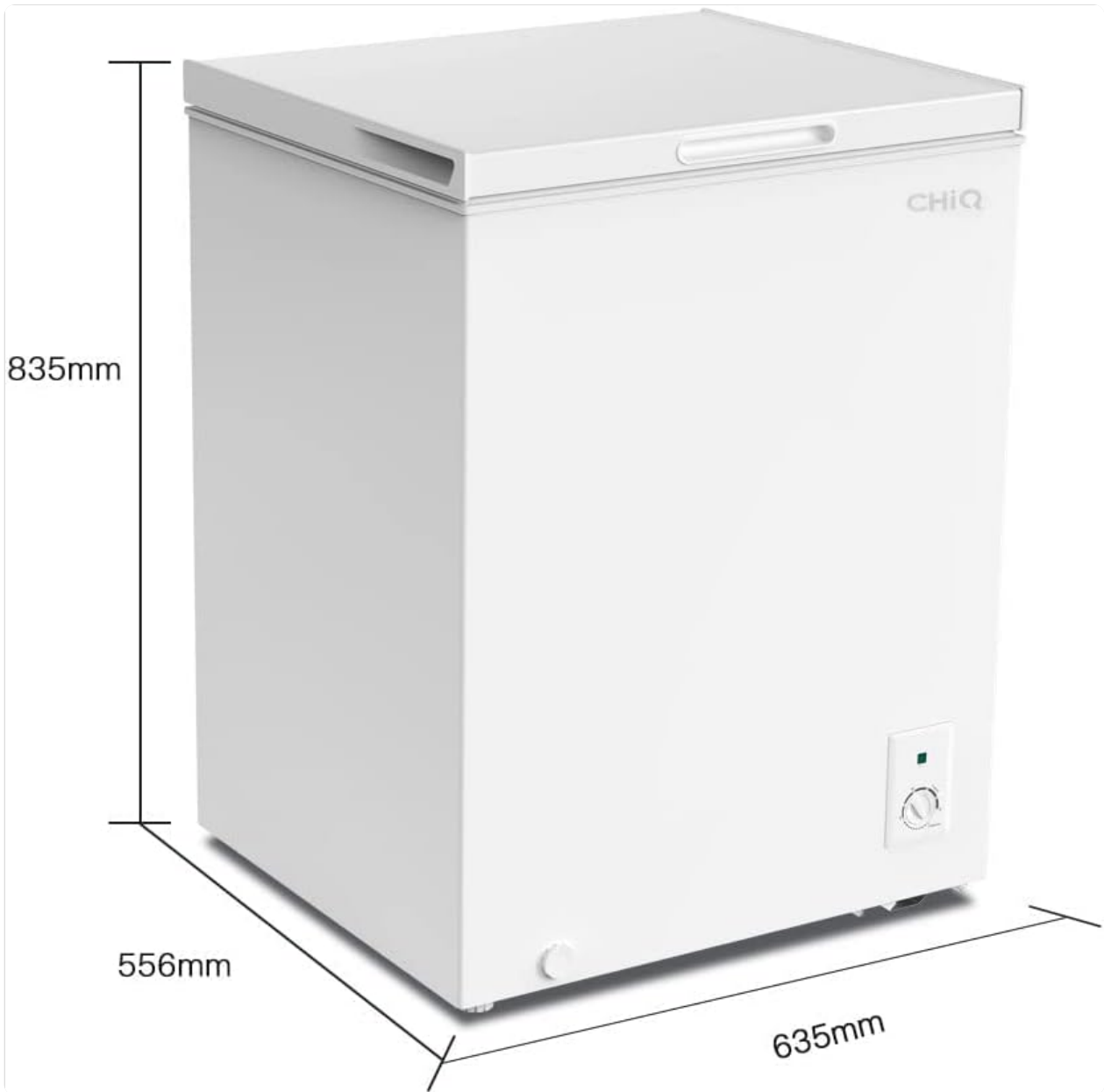
Figure 8.1: A diagram illustrating the precise dimensions of the CHI Q FCF142D Chest Freezer: 835mm (height), 635mm (width), and 556mm (depth).