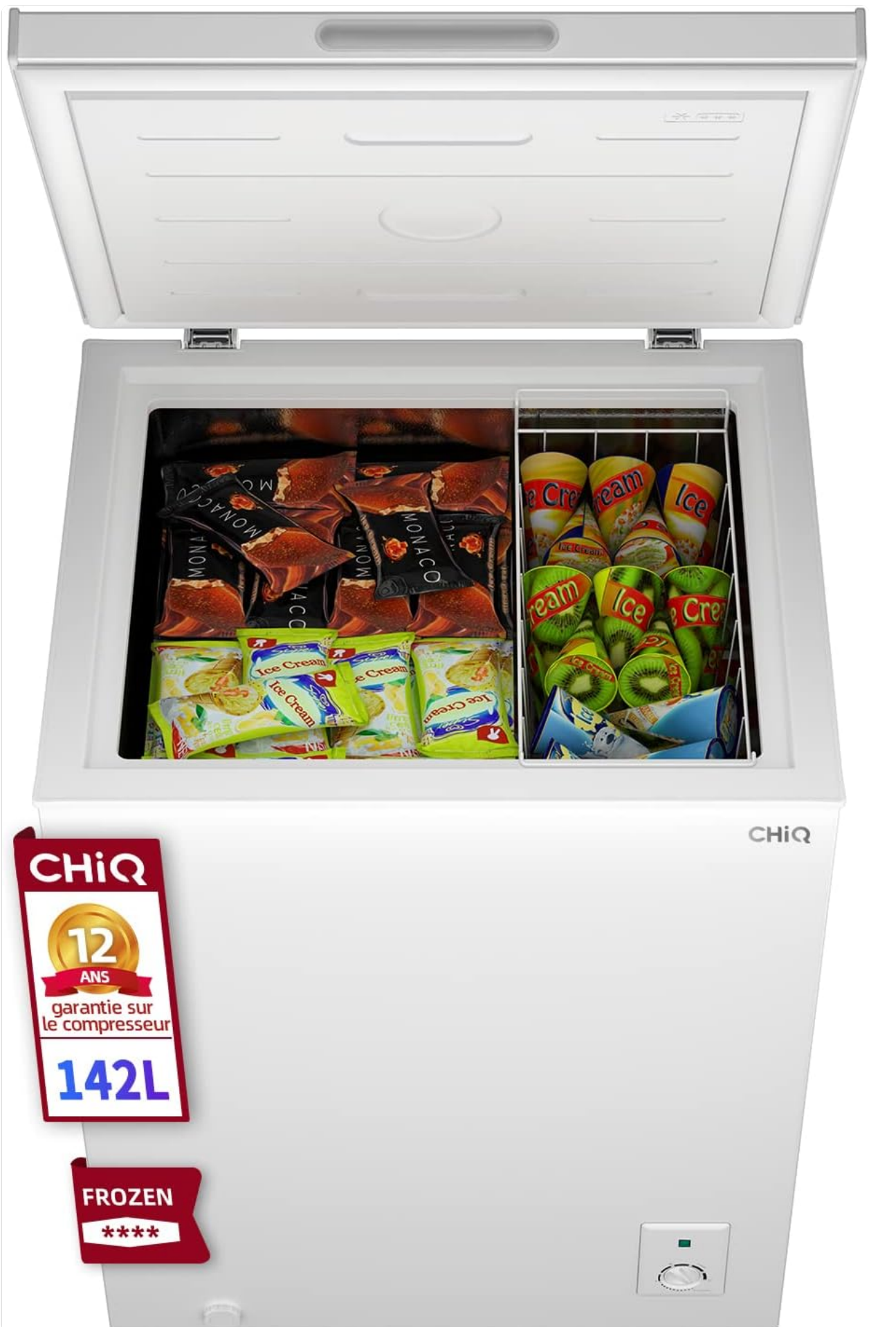
Figure 1.1: The CHI Q FCF142D Chest Freezer with its lid open, revealing a spacious interior filled with various frozen food items and a removable storage basket on the right side.