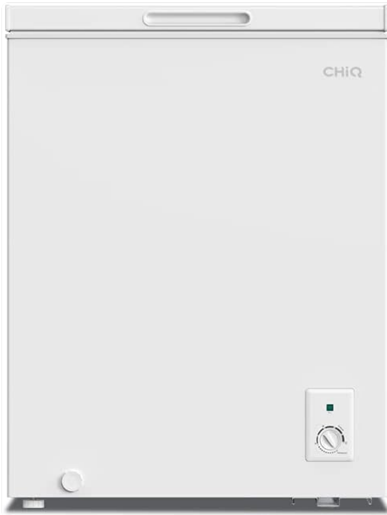
Figure 3.1: Front view of the CHI Q FCF142D Chest Freezer, highlighting its clean white finish, the CHI Q brand logo on the top right, and the accessible temperature control dial with an indicator light on the lower right.