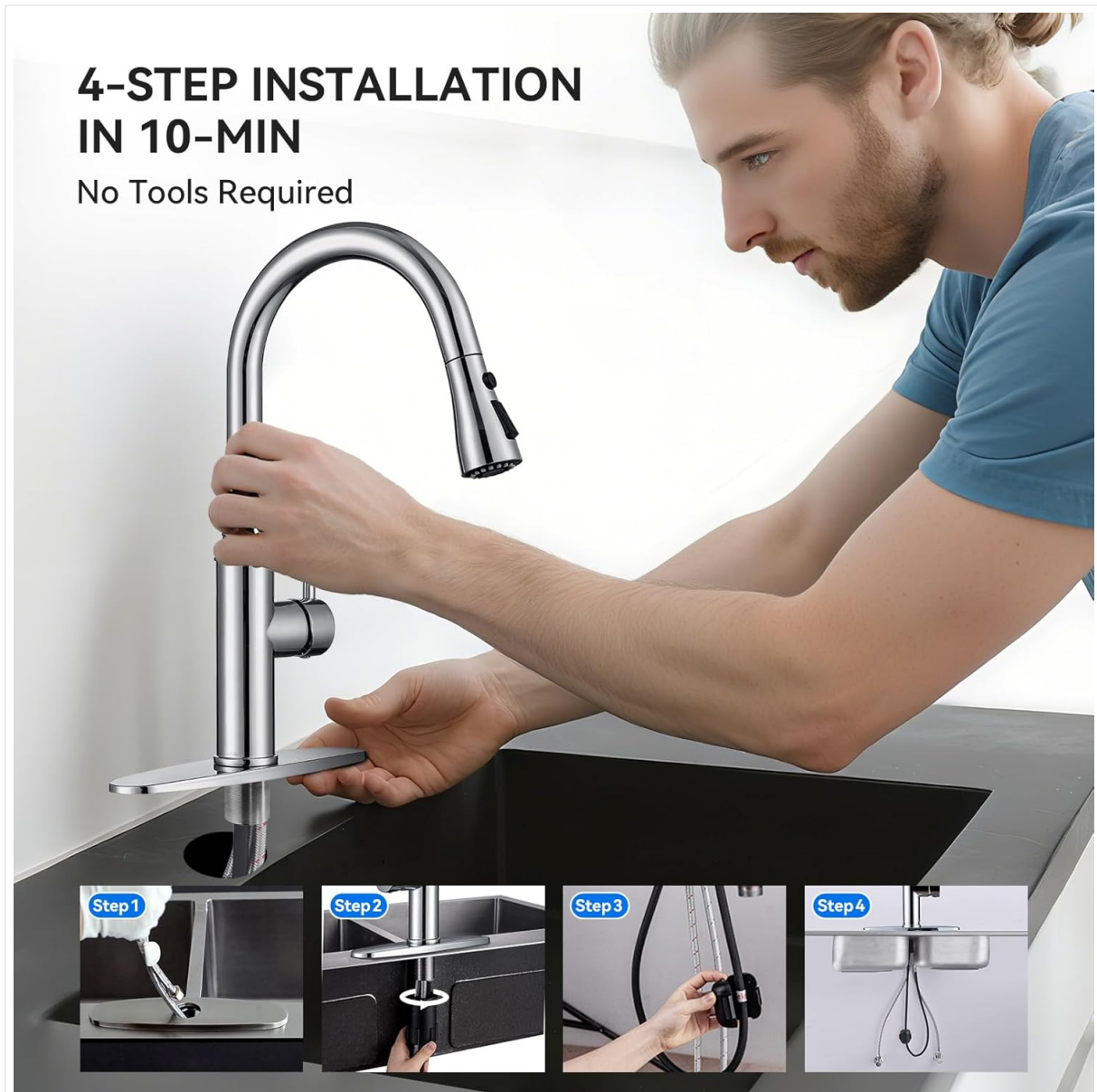
Figure 3: Visual representation of the 4-step installation process, including securing the faucet and attaching the gravity ball.