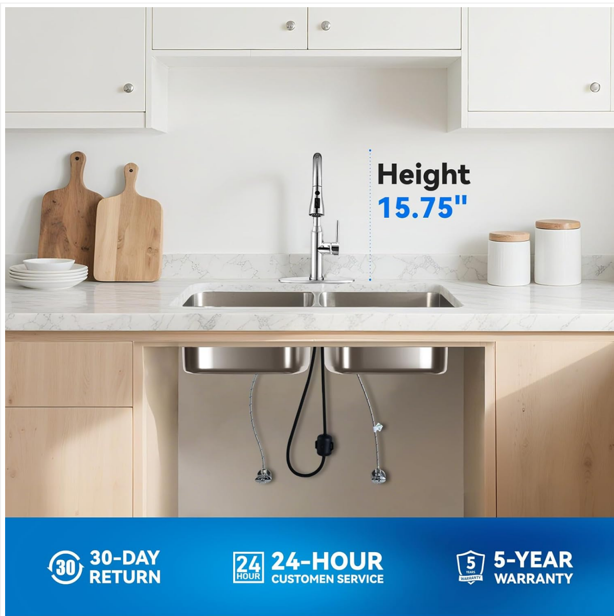
Figure 4: An illustration of the faucet's under-sink components, including the supply lines and gravity ball weight for hose retraction.