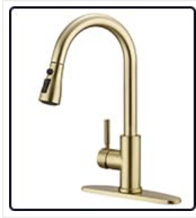
Figure 8: The soft rubber nozzles on the sprayer head can be easily cleaned by hand to remove mineral deposits.