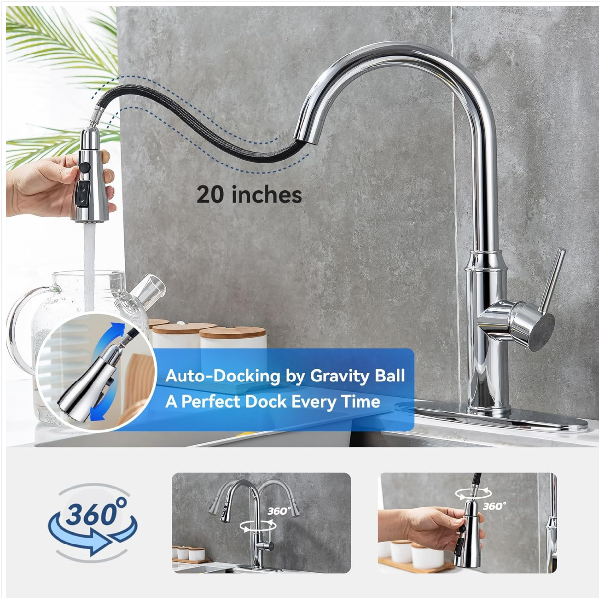
Figure 7: The pull-down sprayer extends up to 20 inches, features 360-degree rotation, and automatically docks back into place.