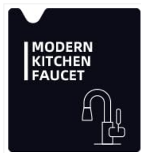
Figure 5: The single handle allows for precise control of water temperature and flow. Hot and cold indicators are present.

The single lever handle controls both water flow and temperature. Lift the handle to turn on the water and adjust the flow rate. Move the handle left for hot water and right for cold water.