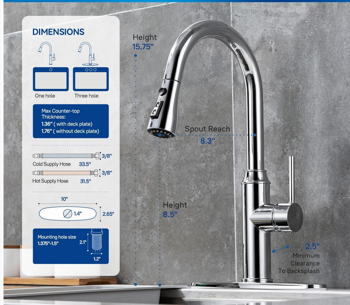
Figure 2: Detailed dimensions and compatibility for 1 or 3-hole kitchen sink installations.