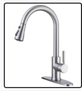
Figure 10: Arofa offers 24-hour customer service, a 5-year warranty, and a 30-day return policy.