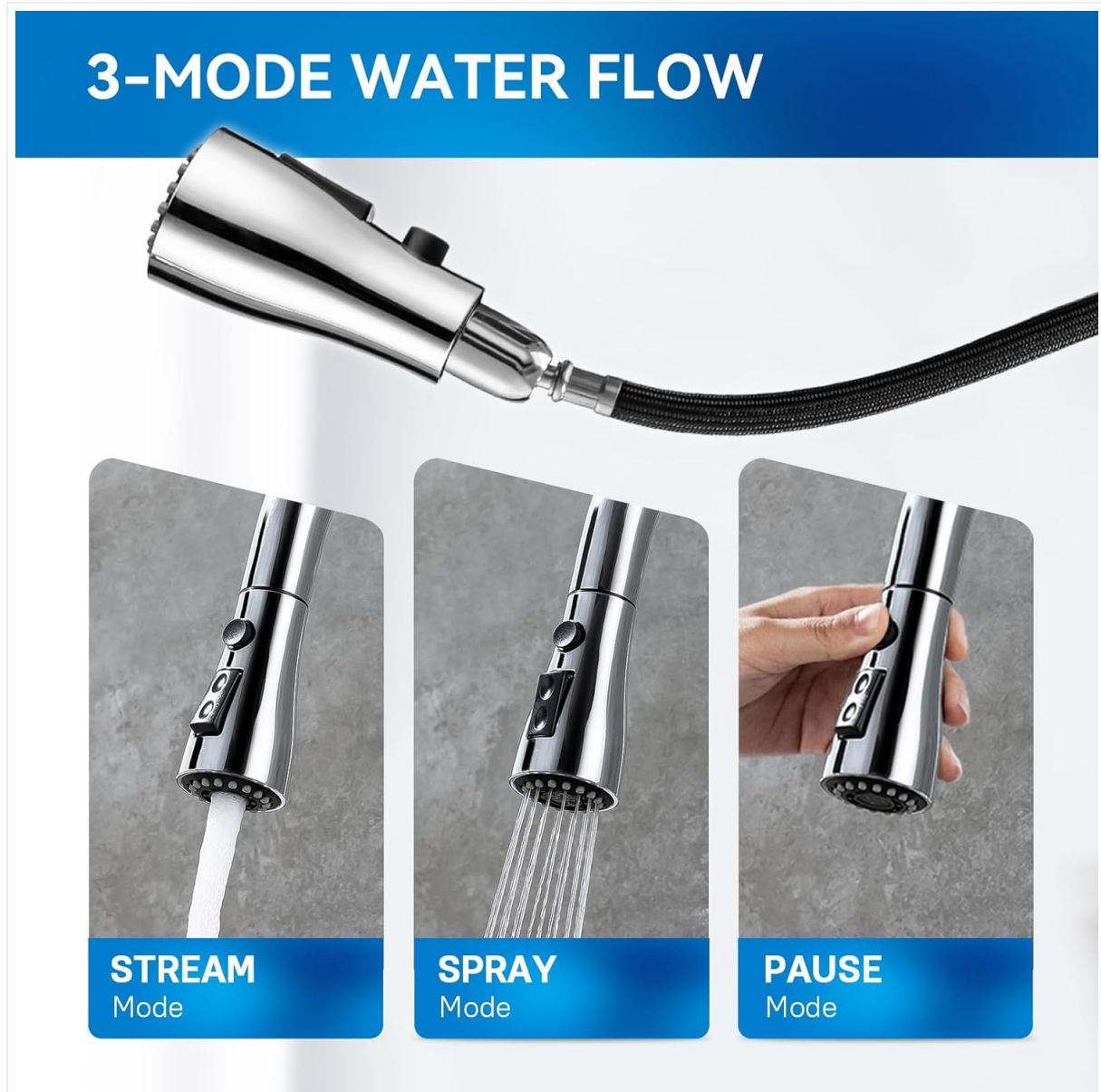
Figure 6: The sprayer head offers Stream, Spray, and Pause modes, selectable via buttons.

Switch between modes using the buttons located on the sprayer head. The gravity ball ensures smooth retraction and secure docking of the sprayer after use.