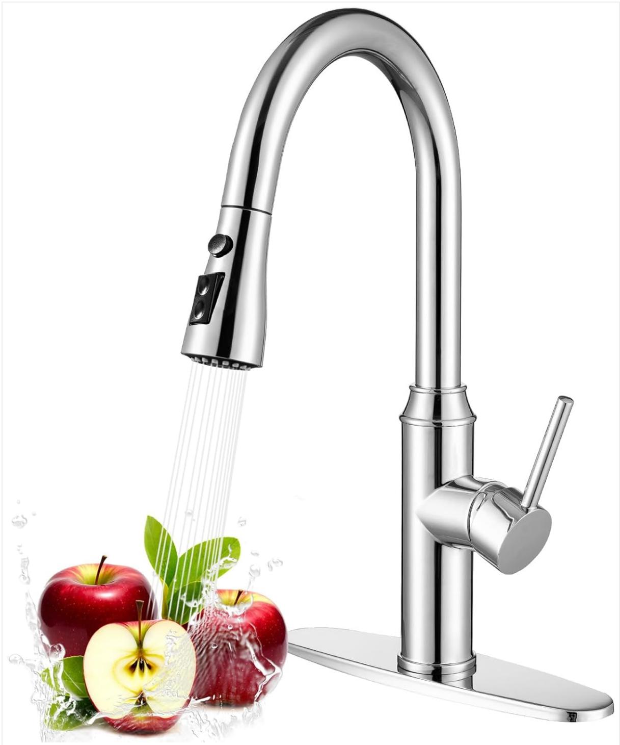
Figure 1: Arofa Kitchen Faucet with Pull Down Sprayer, Chrome finish, shown with water flowing from the sprayer head.