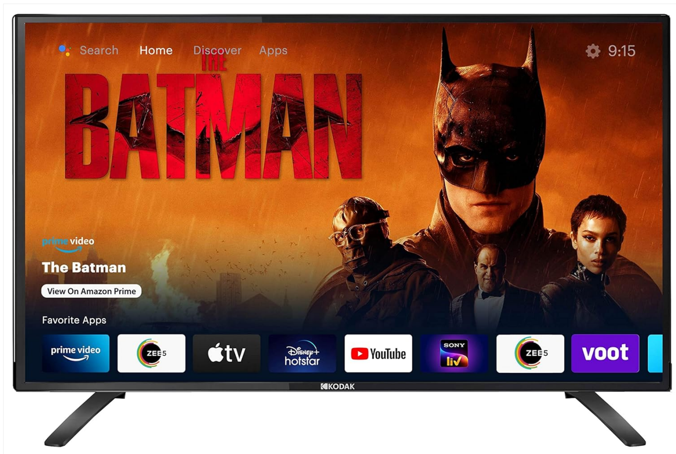
Image: Front view of the Kodak 32HDX7XPRO TV displaying its smart interface with various streaming apps.