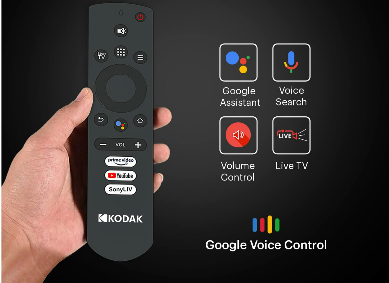
Image: The smart remote control, illustrating its dedicated hotkeys for streaming services and the Google Assistant button for voice commands.