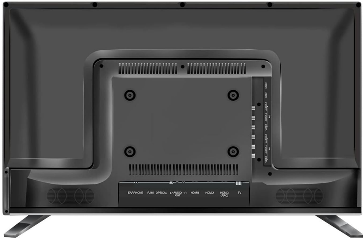
Image: Rear view of the TV highlighting the location of HDMI, USB, and other connectivity ports.