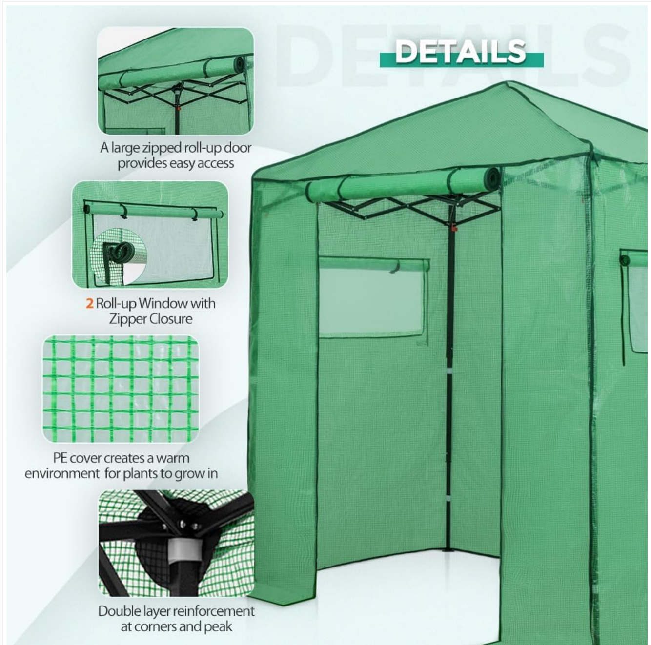
Image: Key features of the greenhouse, including zippered doors, mesh windows, and reinforced construction.

weather conditions. Utilize the zippered doors and mesh windows to manage internal temperature and humidity levels as needed for your specific plants.