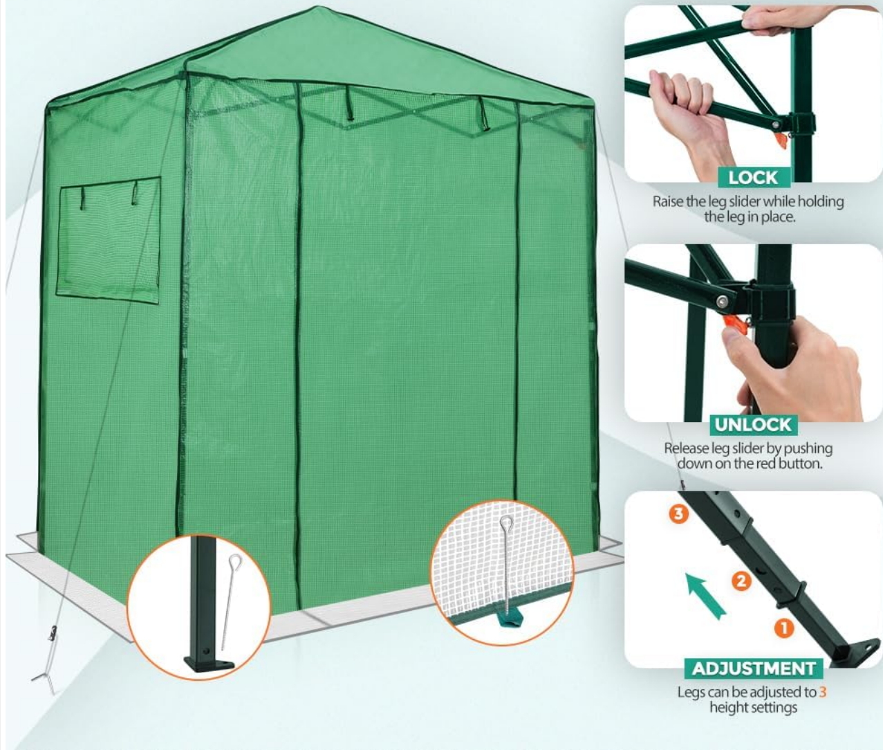
Image: Detailed view of the locking, unlocking, and height adjustment mechanisms on the greenhouse legs.

For optimal stability, especially in outdoor conditions, ensure the greenhouse is securely anchored to the ground using the provided ropes and stakes. This prevents movement and potential damage from wind.