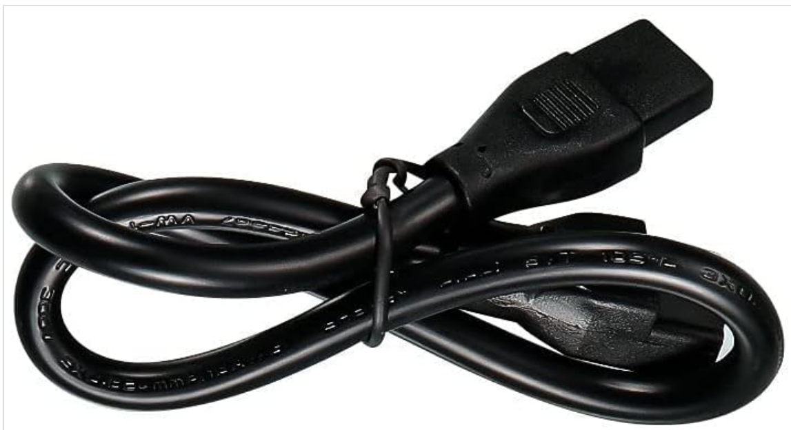
Figure 3: Power Cord for plug-in connection.

For plug-in installation, connect the provided power cord to the input port of the first light fixture and plug it into a standard wall outlet. For hardwired installation, connect the appropriate wiring to the fixture's hardwire input, following local electrical codes.