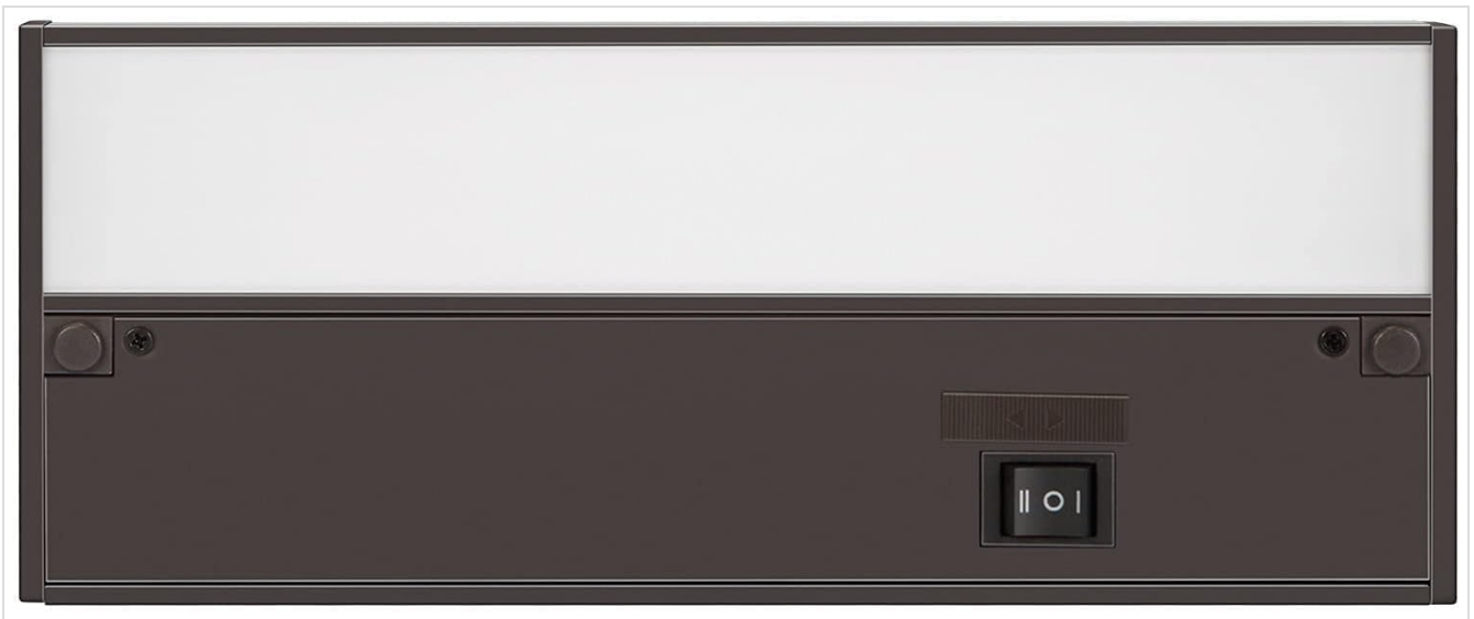
Figure 2: Side view of the light fixture with input/output ports.