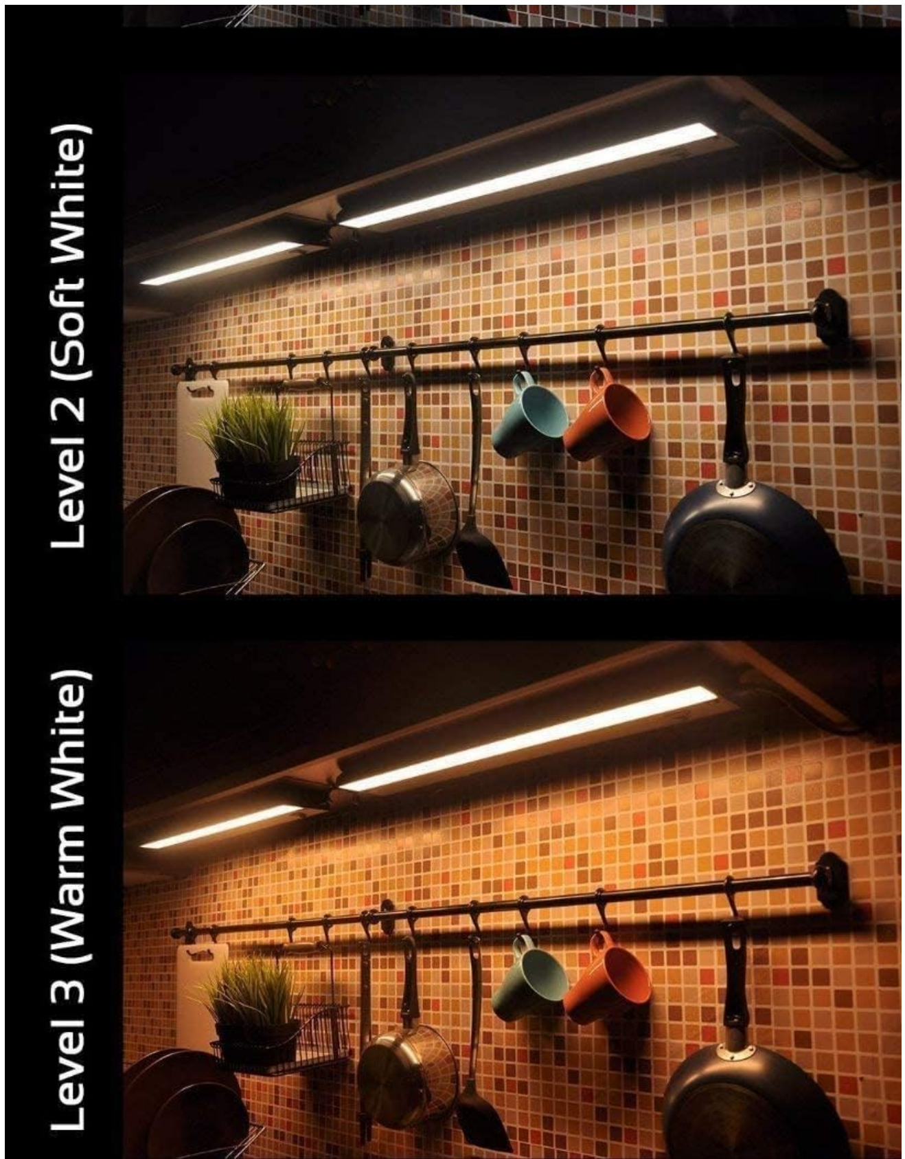
Figure 6: Visual representation of the three selectable color temperatures.