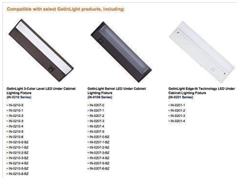
Figure 5: Compatibility chart for linking various GetInLight fixtures.