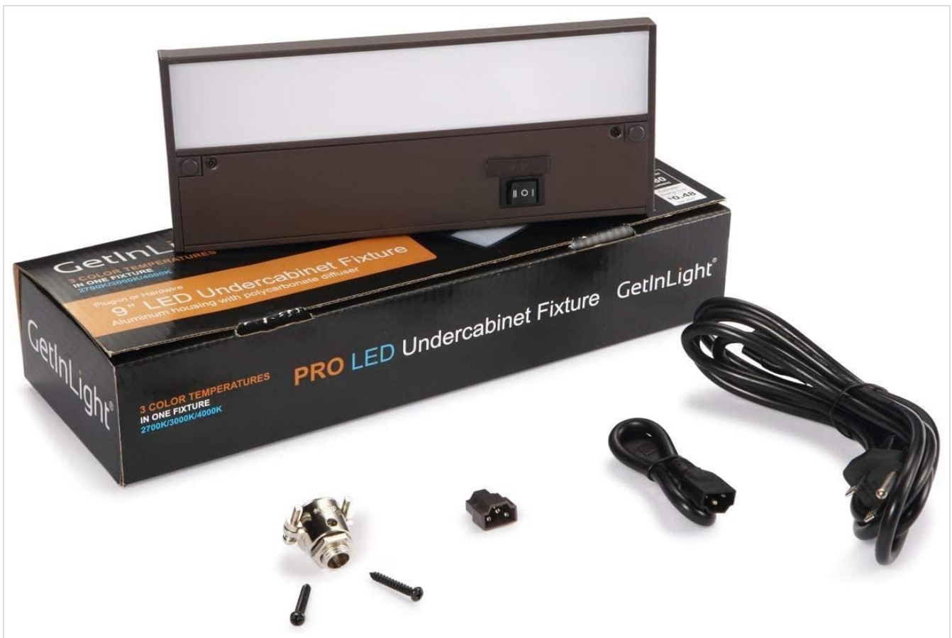
Figure 1: Package Contents. Includes the under cabinet light fixture, power cord, linking cord, and mounting hardware.