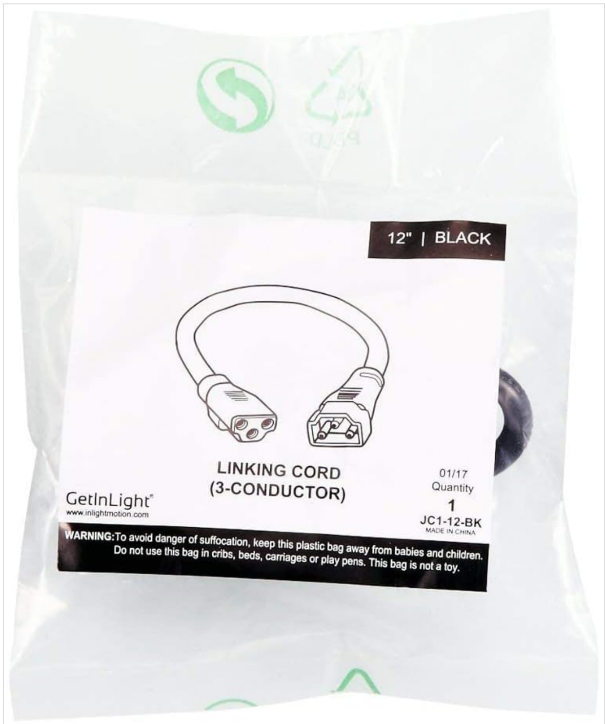
Figure 4: 12-inch Linking Cord for connecting multiple units.