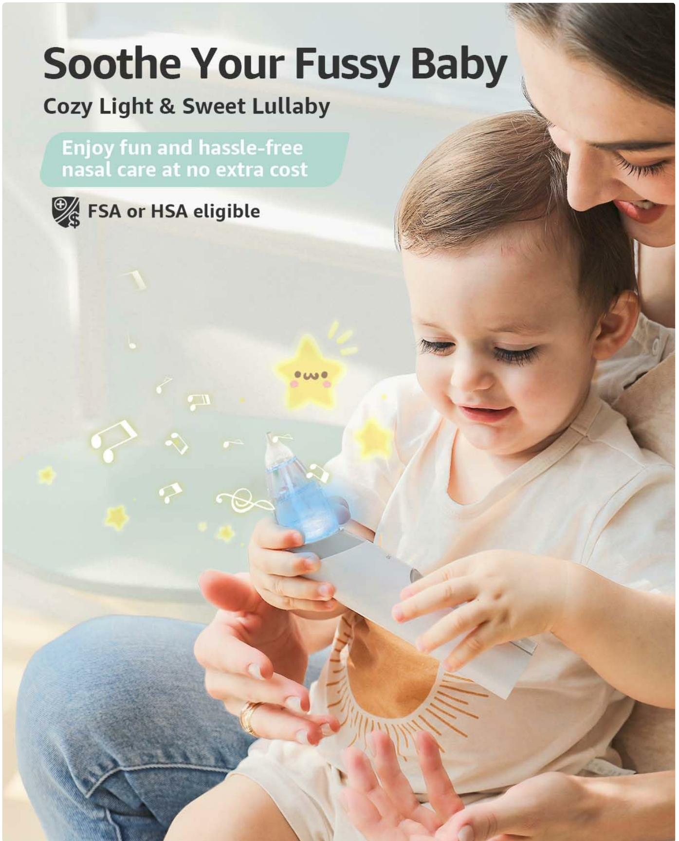
Image: A baby looking at the nasal aspirator, which emits a gentle light and plays music, illustrating the soothing features during use.