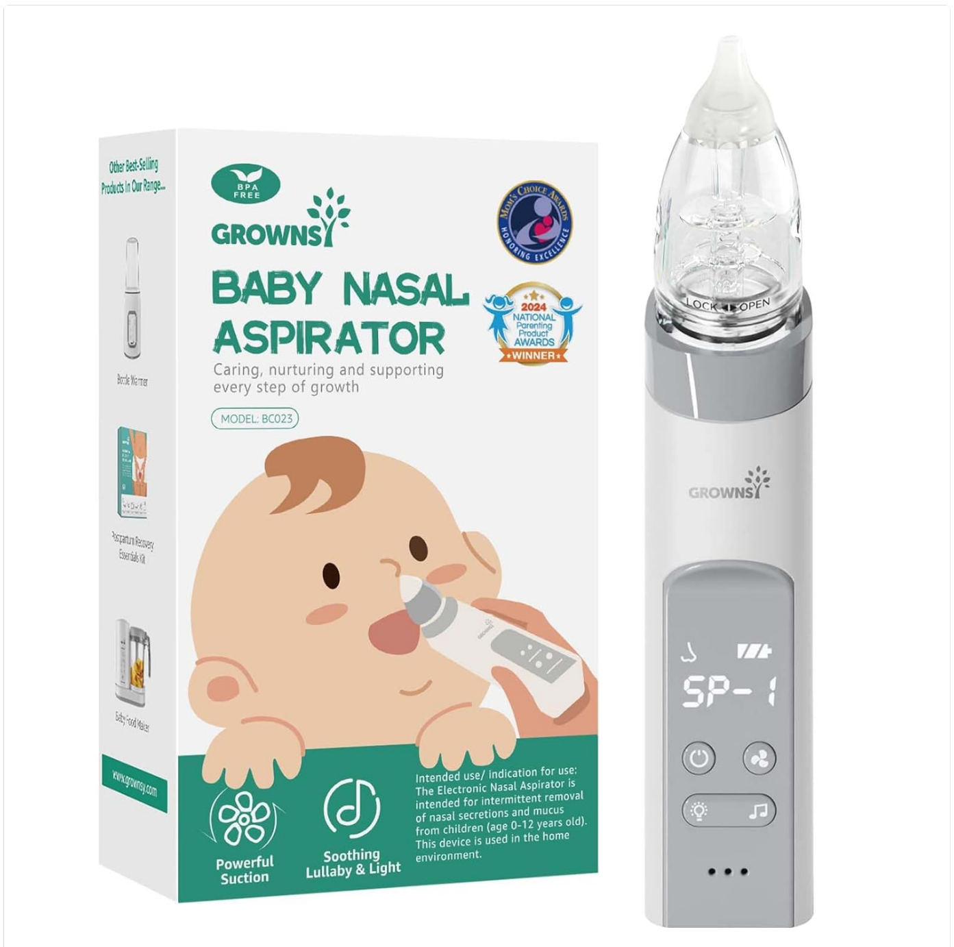
Image: The GROWNSY Electric Baby Nasal Aspirator shown alongside its product packaging, highlighting its features and design.