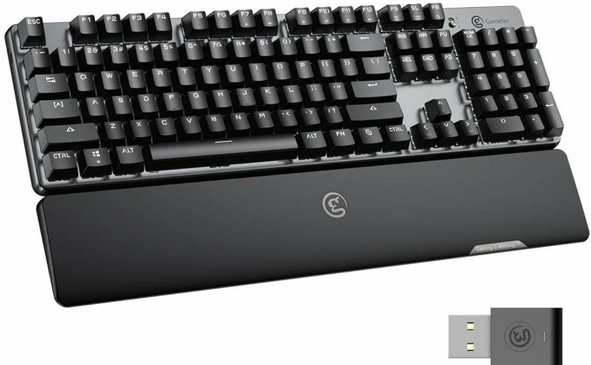
Image 1.1: GameSir GK300 Wireless Mechanical Gaming Keyboard with wrist rest.