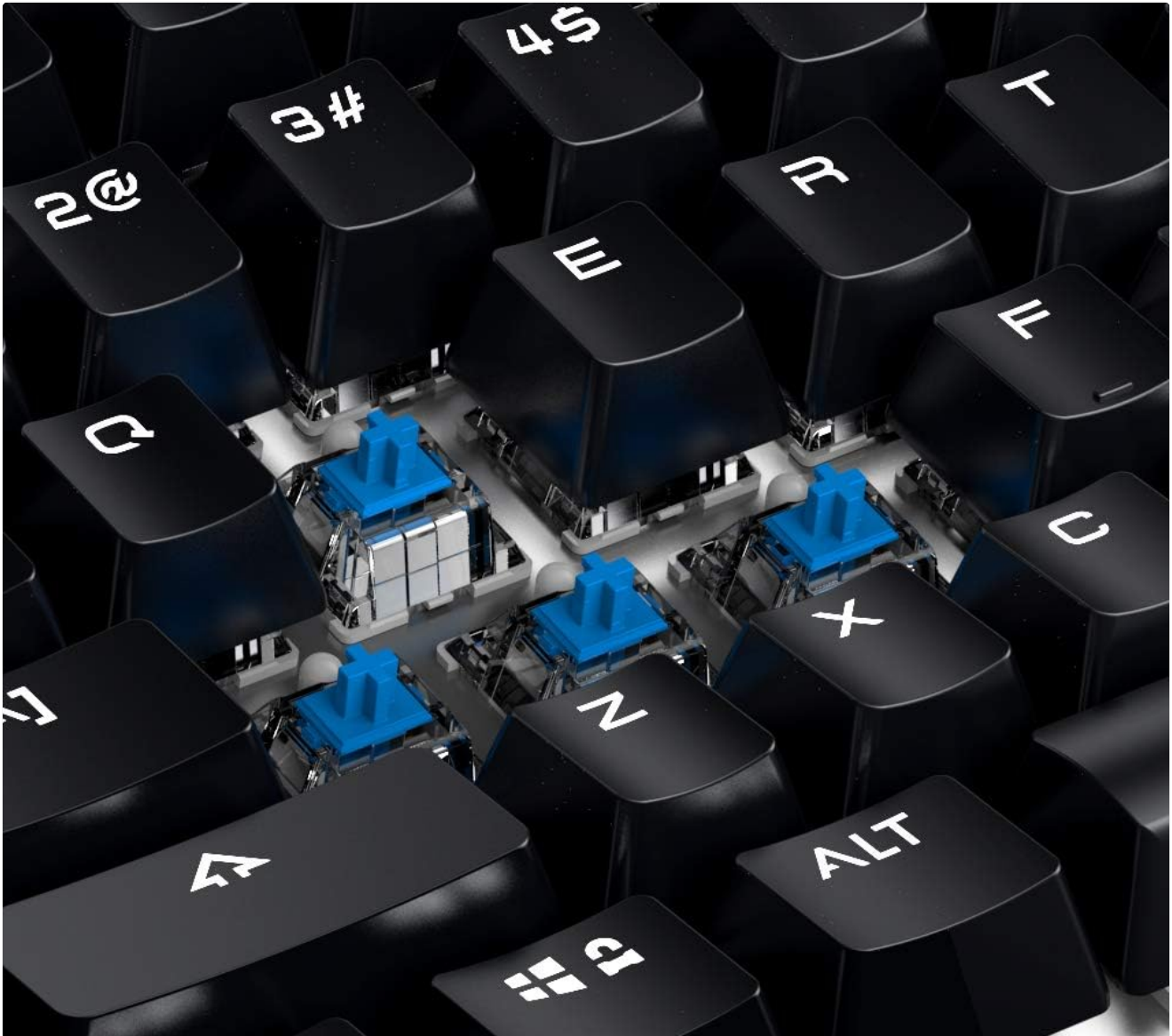
Image 3.2: Close-up view of the TTC Blue mechanical switches on the GameSir GK300 keyboard.

The keyboard is equipped with 104 TTC mechanical blue switches, known for their tactile bump and audible click feedback. These switches offer a keystroke lifespan of up to 50 million presses.