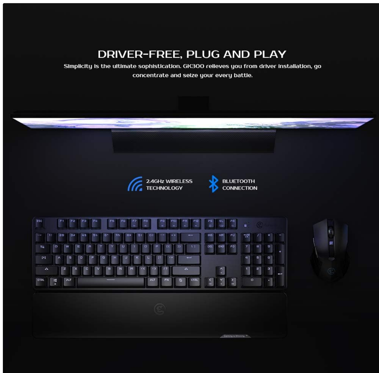
Image 2.2: Diagram illustrating 2.4GHz wireless technology and Bluetooth connection options.

This mode is suitable for connecting to smartphones, tablets, and other Bluetooth-enabled devices. To activate Bluetooth pairing, refer to the operating instructions for specific key combinations.