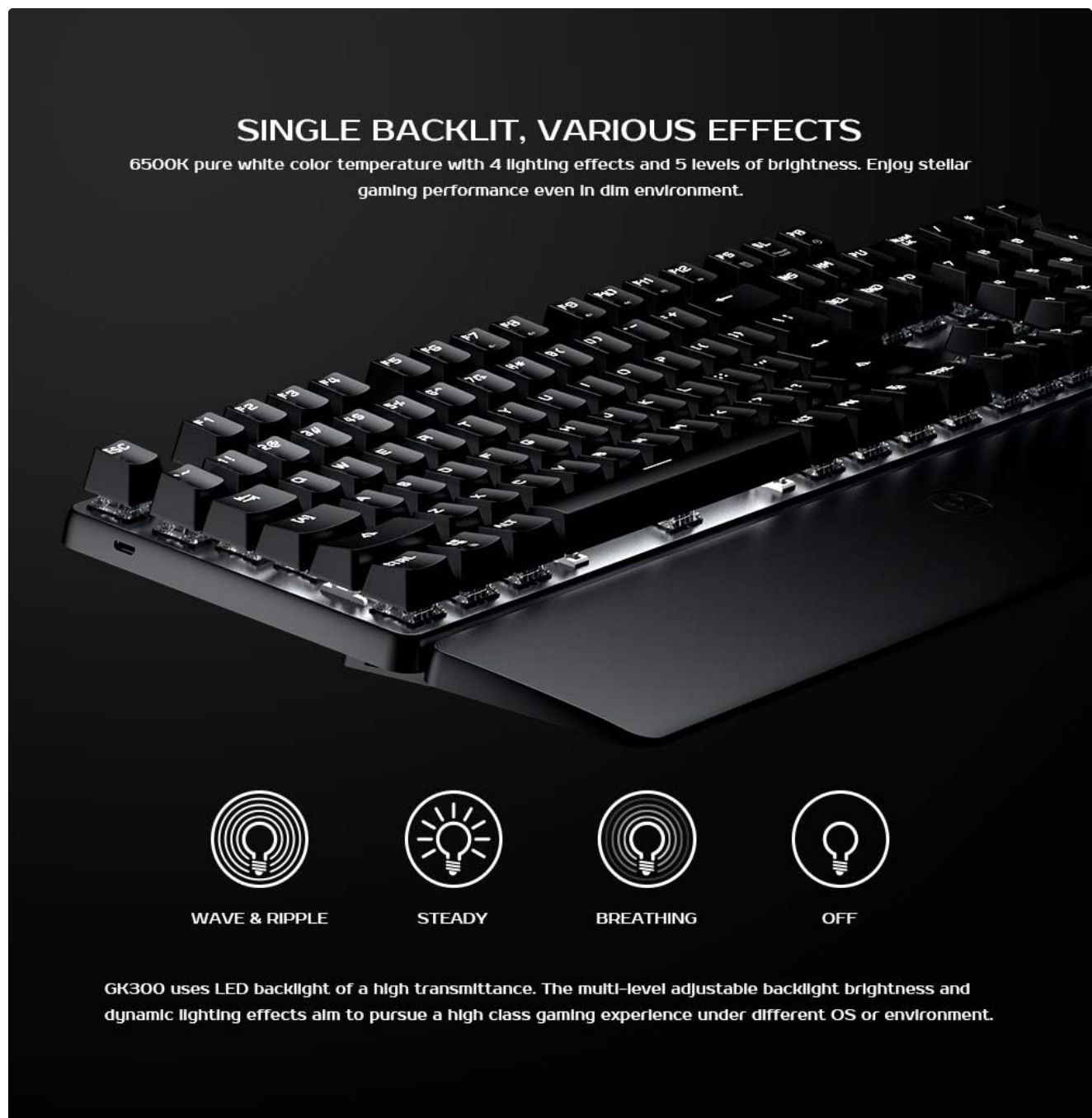
Image 3.1: Visual representation of various backlight effects including Wave & Ripple, Steady, Breathing, and Off modes.

The GK300 features a 6500K pure white LED backlight with multiple effects and 5 levels of brightness. Use FN + ← / → to cycle through lighting effects and FN + ↑ / ↓ to adjust brightness.