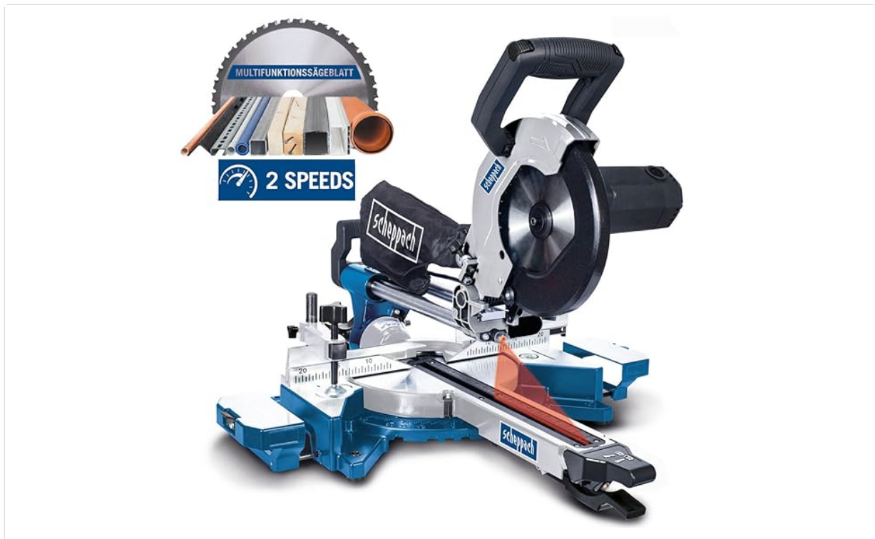
Overall view of the Scheppach HM90MP miter saw, showcasing its design and key operational areas.