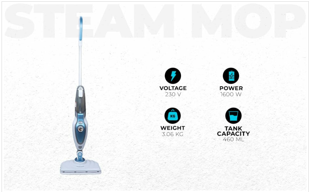
Figure 8.1: Key Product Specifications.

This infographic visually summarizes the key specifications of the steam mop, including Voltage (230V), Power (1600W), Weight (3.06 KG), and Tank Capacity (460 ML).