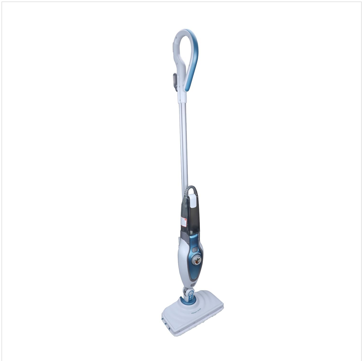
Figure 3.2: Removable Water Tank.

This image shows a close-up of the transparent, removable water tank on the steam mop, designed for easy refilling.