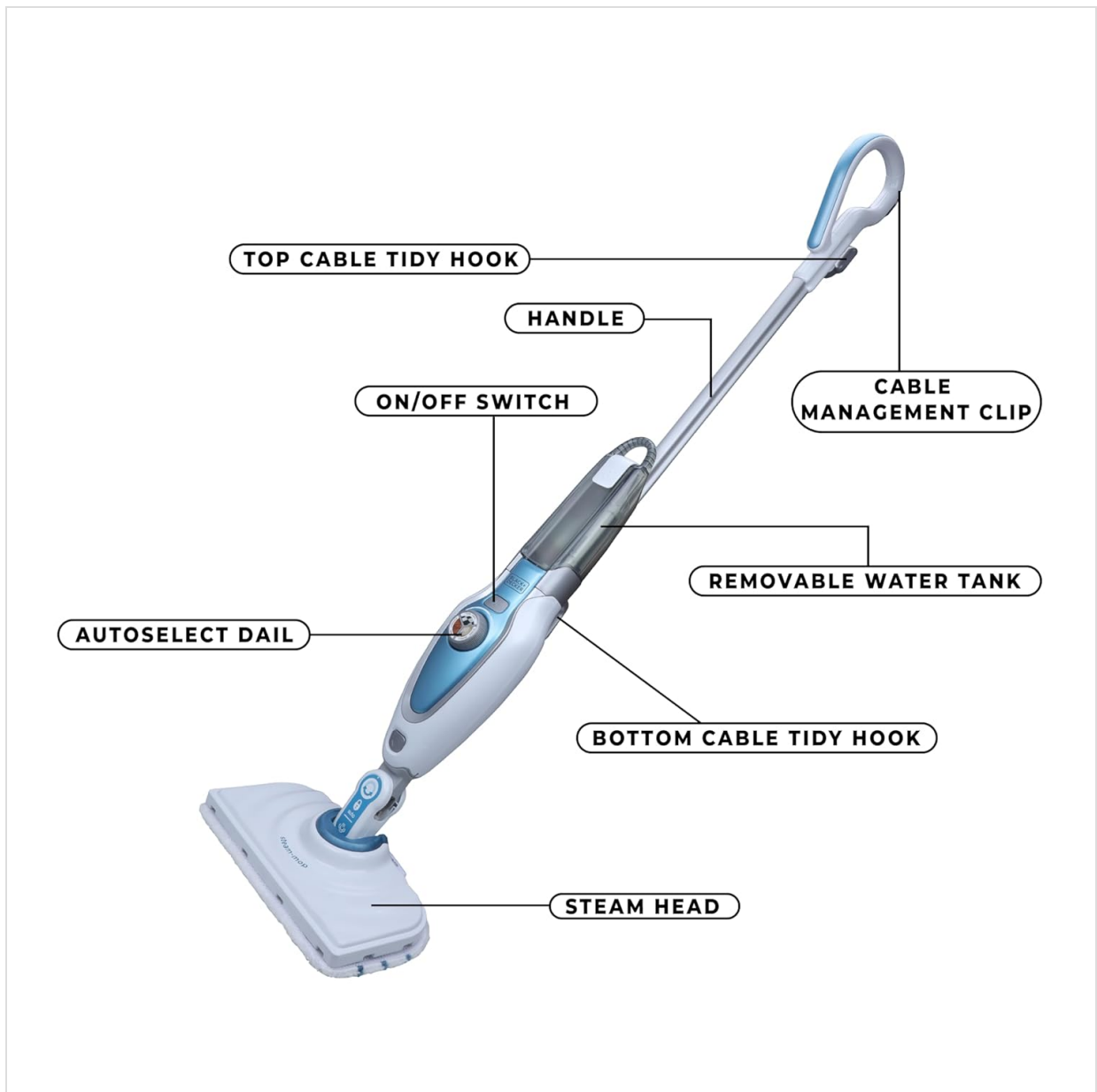
Figure 3.1: Main components of the FSM1620 Steam Mop.

This image displays the BLACK+DECKER FSM1620 Steam Mop with various parts labeled for identification.