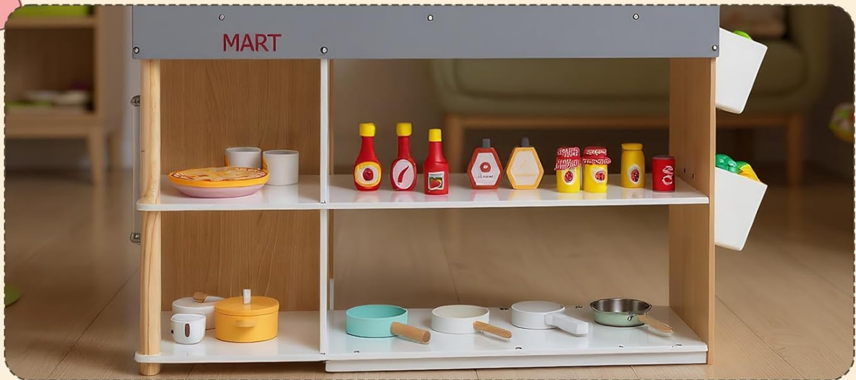
Front Display Racks