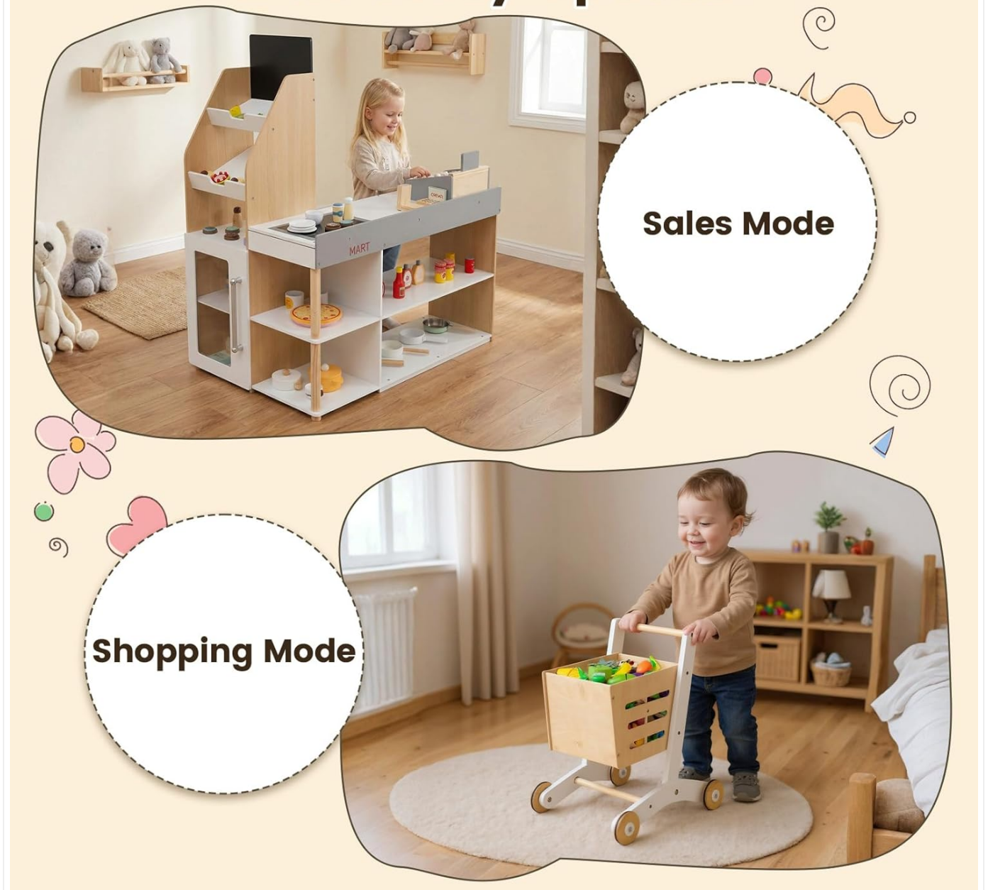
Figure 4.4: 2-in-1 Play Options (Sales and Shopping Mode)