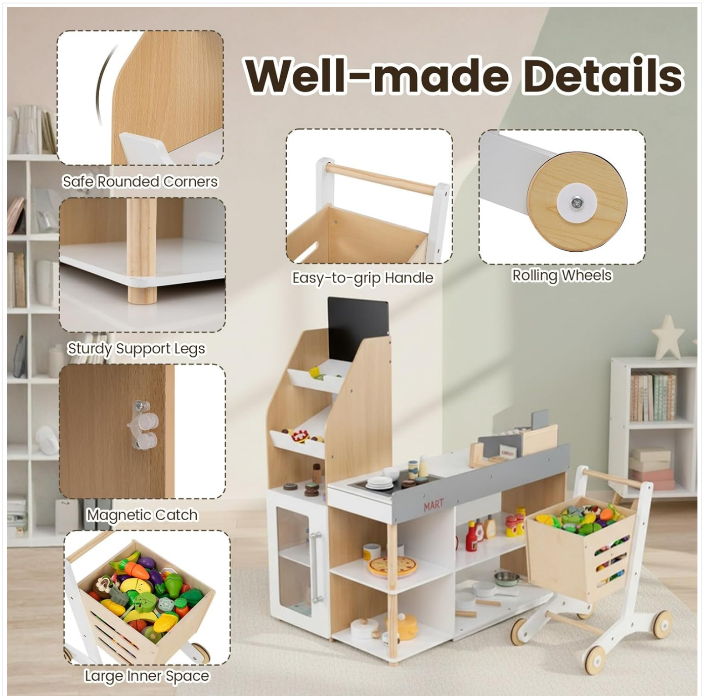
Figure 5.1: Well-made Details for Durability