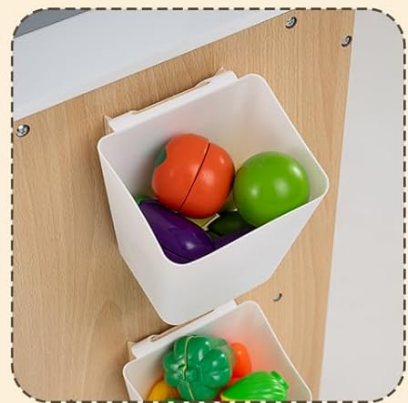
2 Storage Baskets