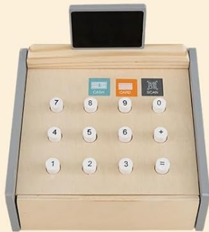
1 x Cash Register

Offer kids real selling and buying experience