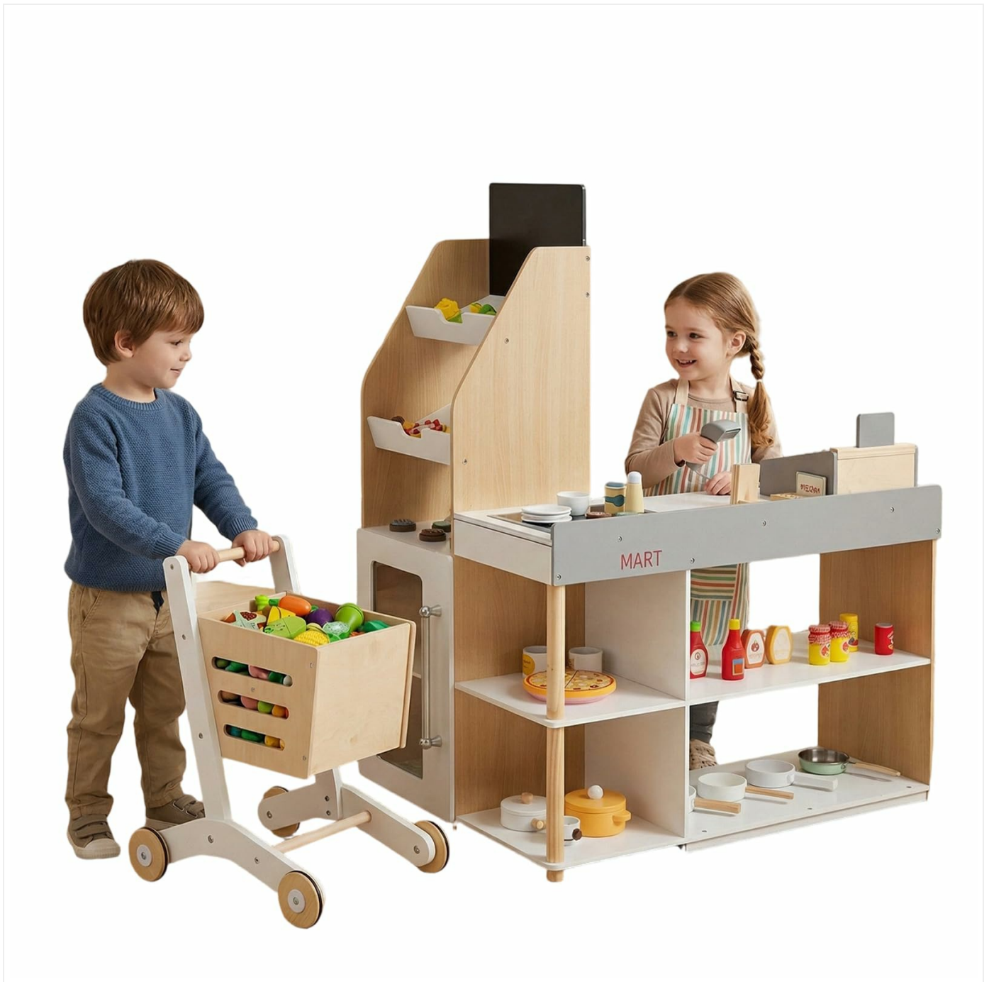
Figure 3.1: Assembled Playset Overview