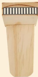
1 x Money Detector