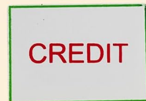
1 x Credit Card