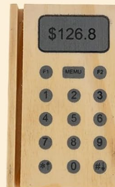
1 x POS Machine