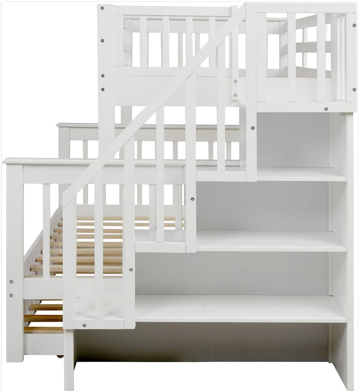
Image: A detailed side view of the bunk bed's staircase, highlighting the built-in storage shelves on the side, providing convenient access and organization.