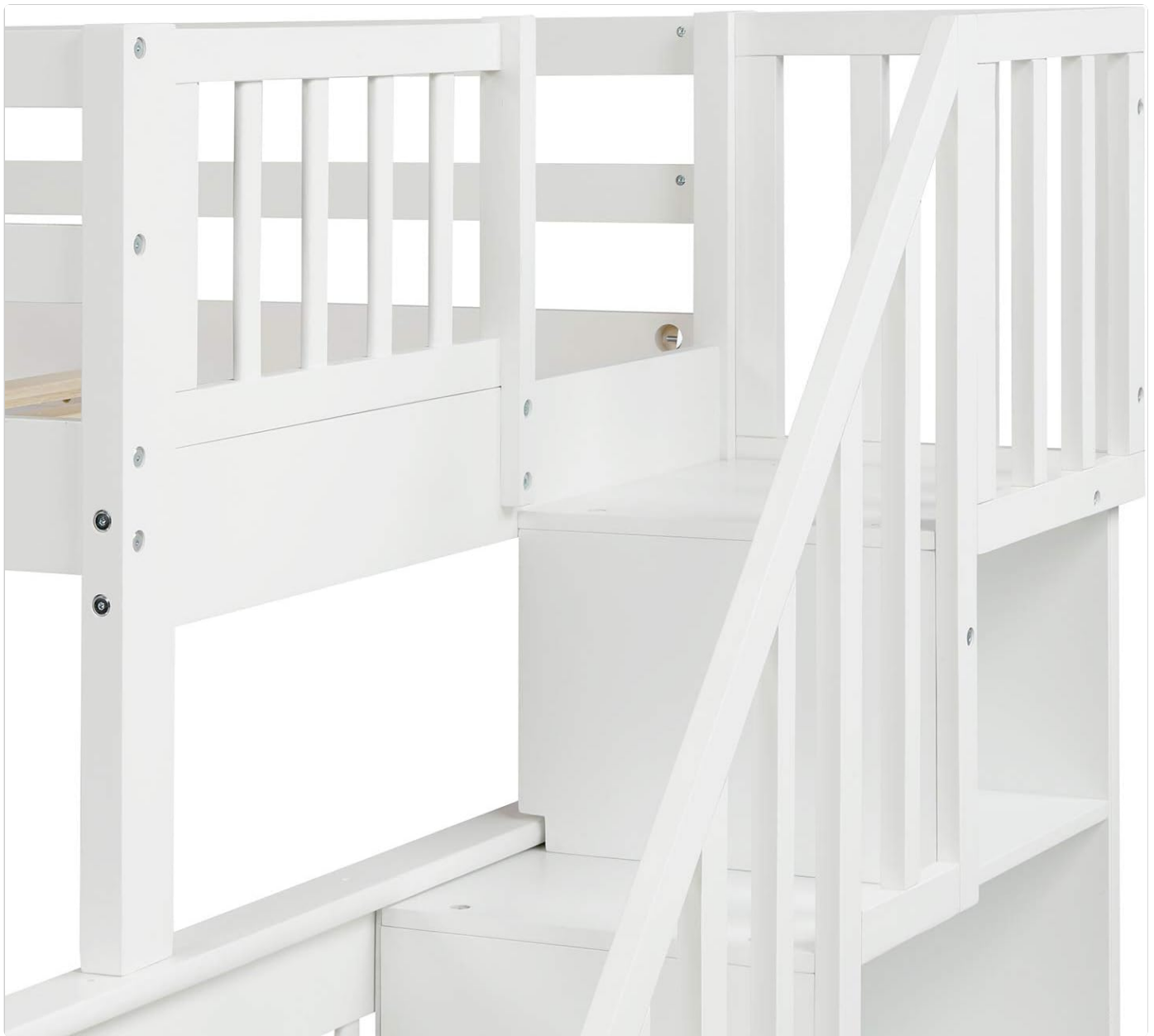
Image: A close-up of the upper section of the bunk bed, showing the secure attachment of the top bunk to the staircase and the guardrails in place.