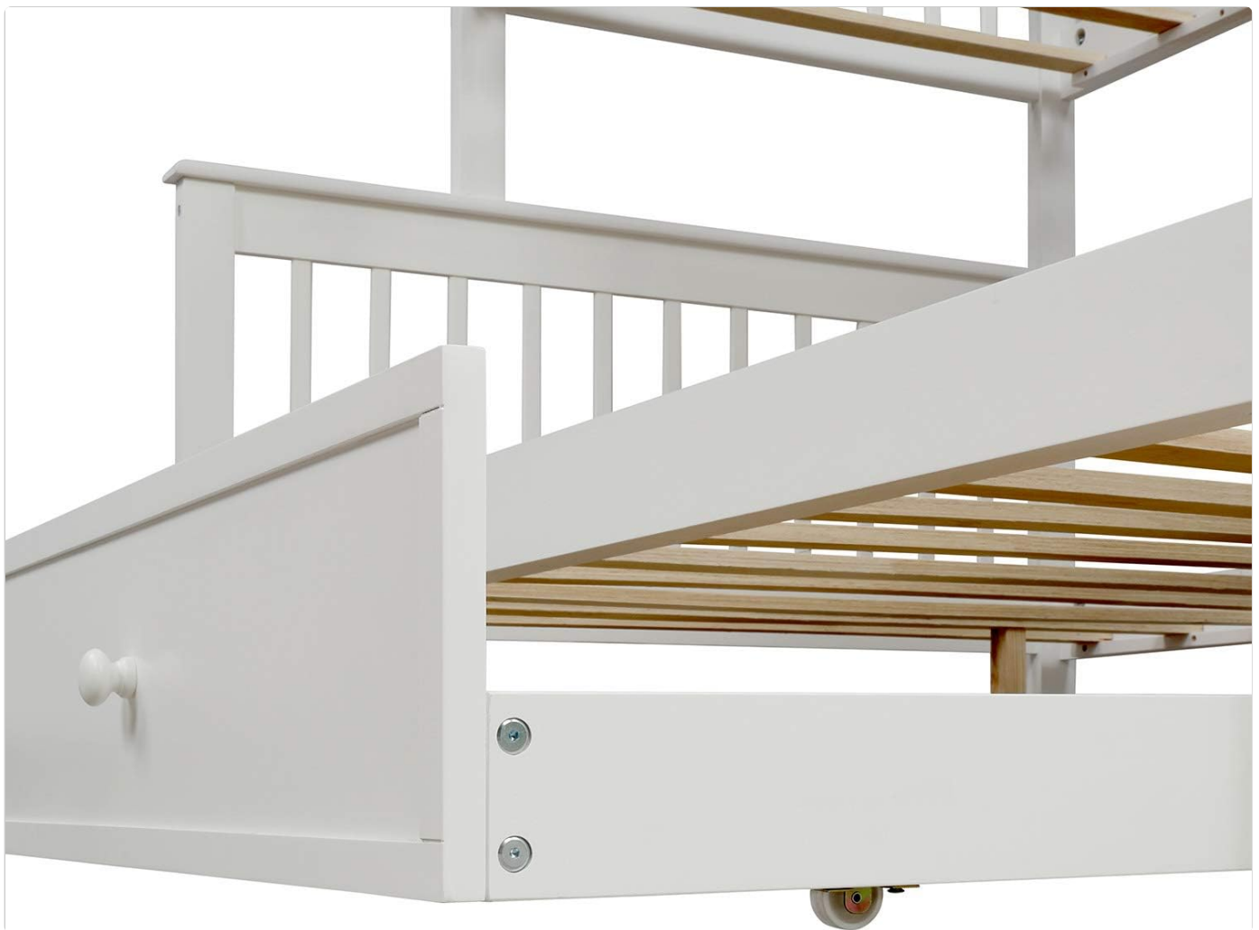
Image: A detailed view of the pull-out trundle bed, showing its integrated storage drawers, designed to slide smoothly under the main bed.