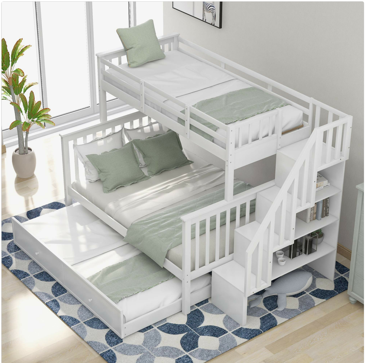
Image: The MERITLINE Twin Over Full Bunk Bed in white, featuring a twin bed on top, a full bed on the bottom, a pull-out trundle bed, and integrated stairs with storage shelves.