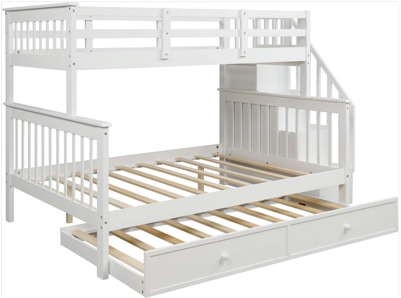
Image: A view of the assembled full bed frame, showing the wooden slats in place, ready for a mattress.