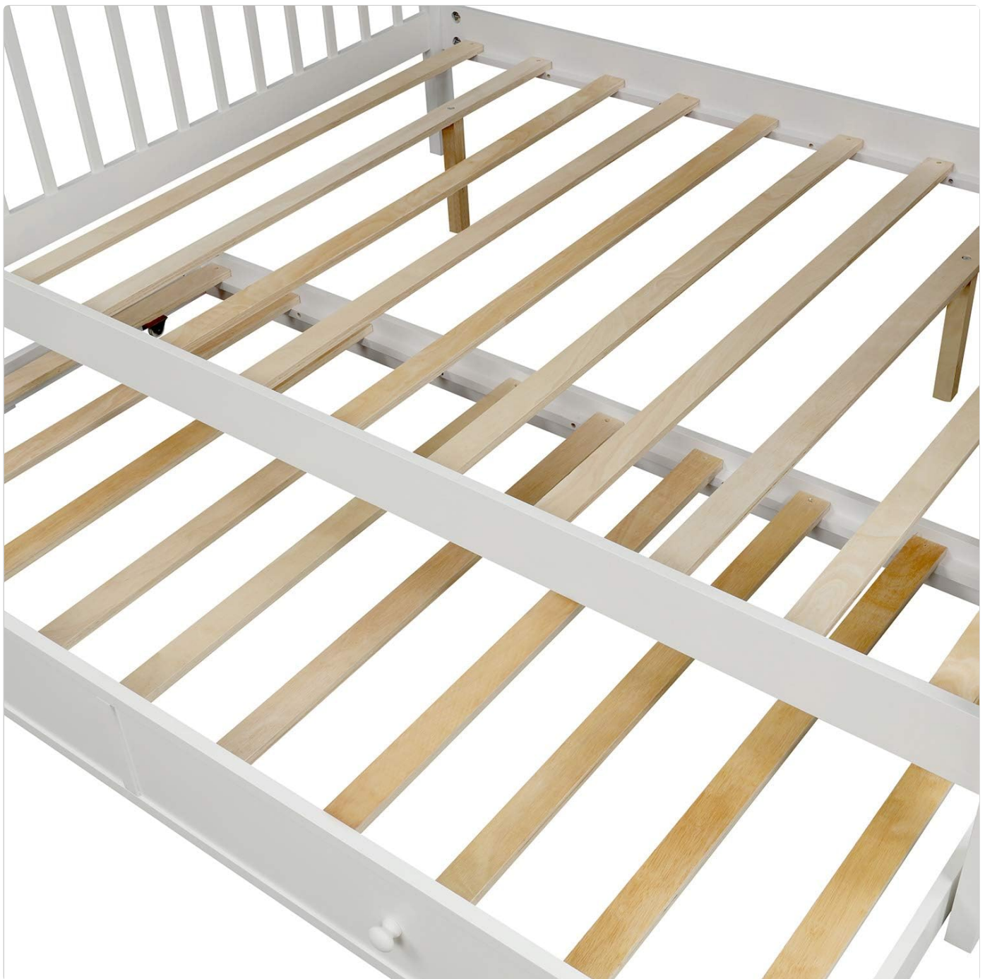
Image: A close-up showing the wooden slats securely fastened to the bed frame, providing a sturdy base for the mattress.