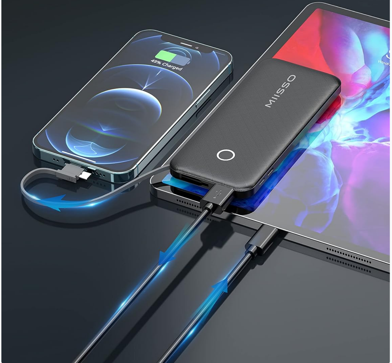
Image: The Miisso Power Bank connected and charging two different devices simultaneously, demonstrating its multi-device charging capability.