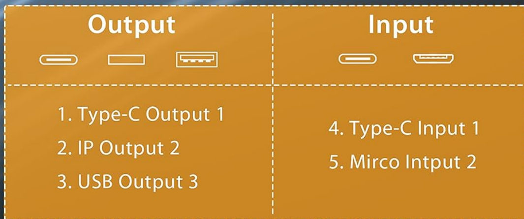
Image: A detailed diagram highlighting the various input and output ports on the Miisso Power Bank, including Type-C Output 1, IP Output 2, USB Output 3, Type-C Input 1, and Micro Input 2.