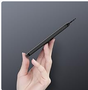
Image: A hand holding the Miisso Power Bank, demonstrating its slim and compact design for easy handling and portability.