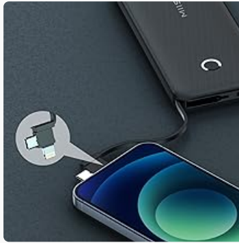
Image: A close-up view of the power bank's built-in charging cable, showing both the Lightning and Type-C connectors for versatile device compatibility.