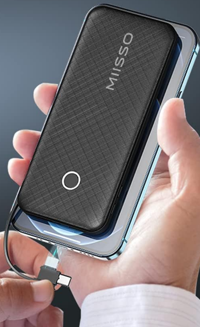
Image: The Miisso Power Bank simultaneously charging an iPhone using its built-in Lightning cable and a Type-C Android phone using its built-in Type-C cable.