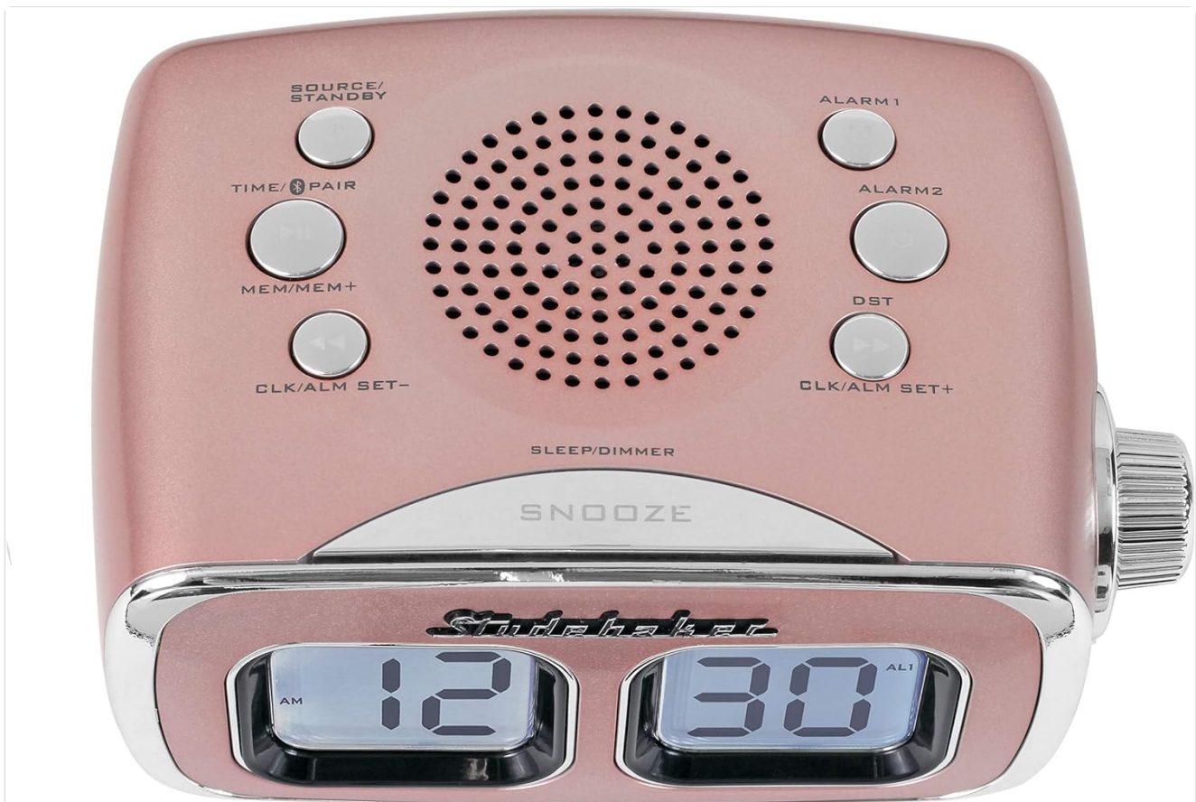
Figure 1: Top View Controls

Familiarize yourself with the various parts and controls of your Studebaker SB3500 unit.