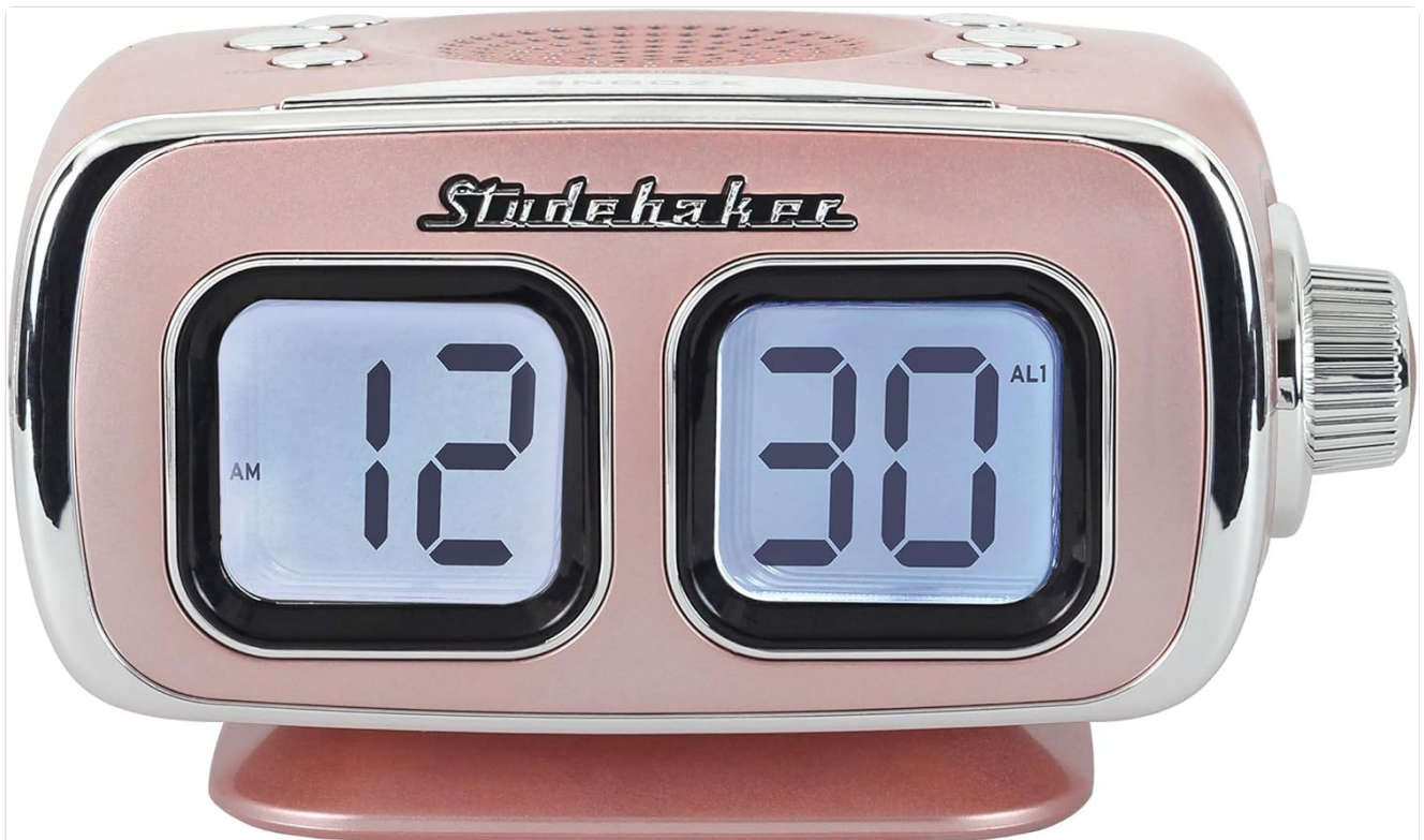
Figure 3: Front View Display

This image shows the side of the clock radio, featuring the prominent analog volume control knob, which also functions as the tuning knob for radio frequencies.