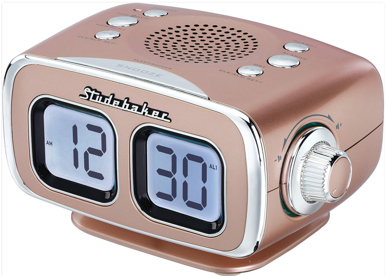
Figure 4: Overall Product View

An angled view of the Studebaker SB3500 in Rose Gold, demonstrating its compact size and retro design, suitable for various home settings.