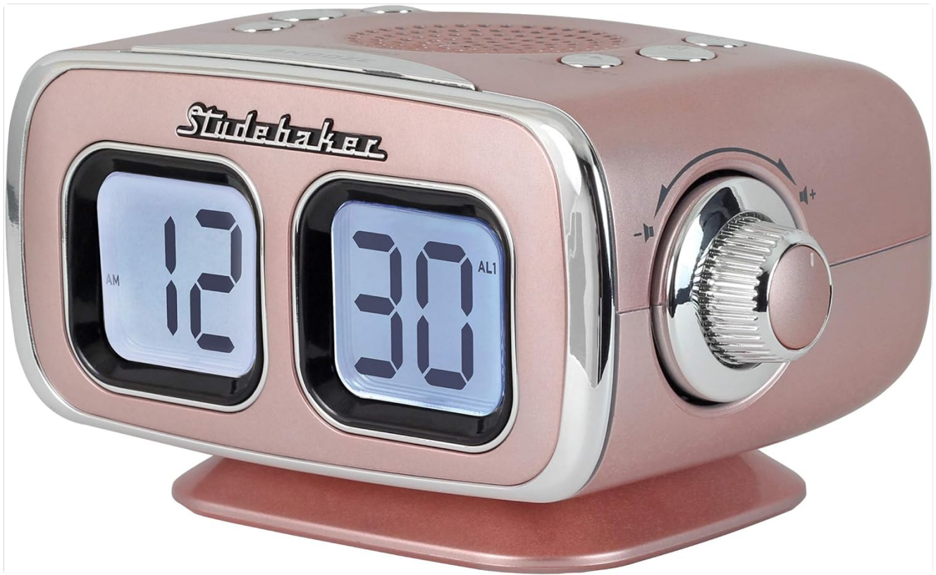
Figure 2: Side View with Volume Control

This image shows the side of the clock radio, featuring the prominent analog volume control knob, which also functions as the tuning knob for radio frequencies.