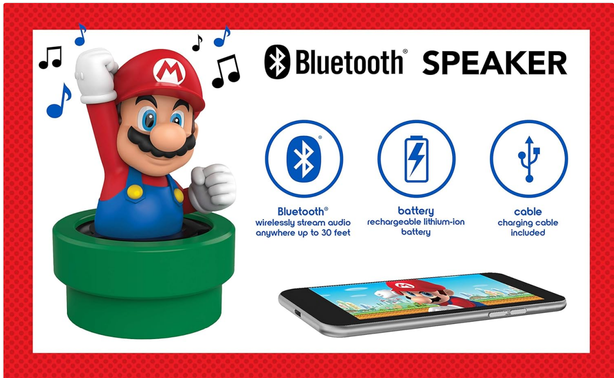
Image: A visual representation of the speaker's key features: Bluetooth wireless streaming, rechargeable lithium-ion battery, and included USB charging cable.