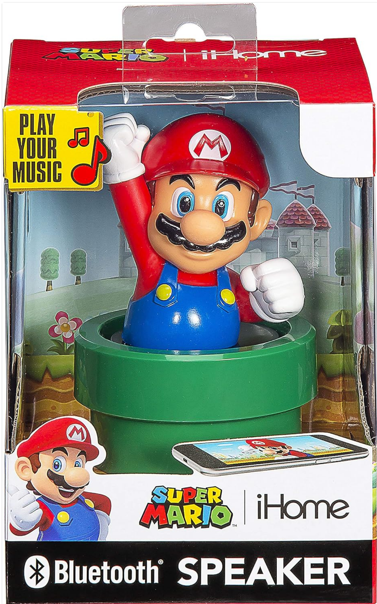
Image: The eKids Super Mario Bluetooth Speaker in its retail packaging, featuring Mario in a green pipe design.