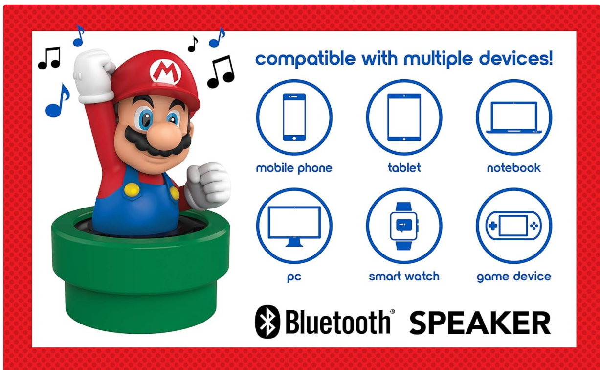
Image: An illustration highlighting the speaker's compatibility with various devices such as smartphones, tablets, laptops,