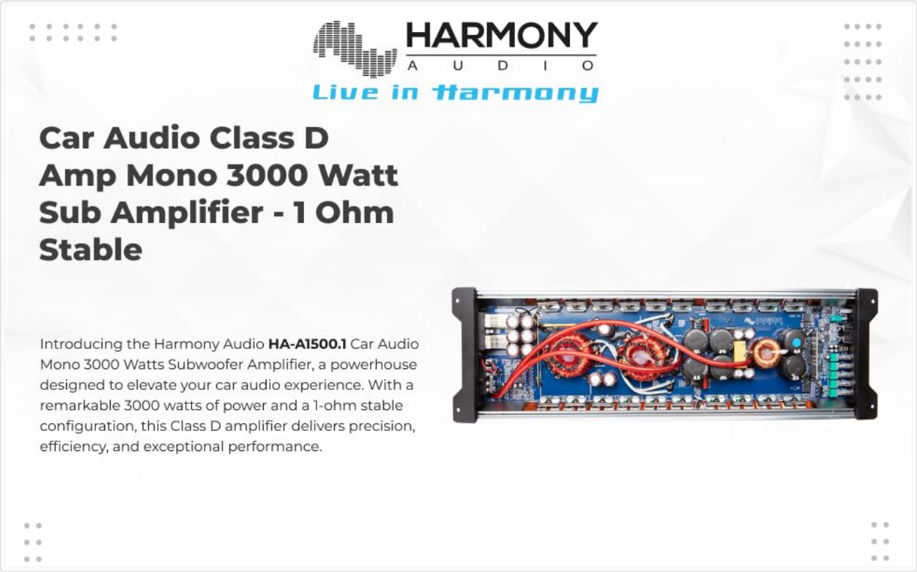
Figure 9.1: Internal view of the HA-A1500.1 amplifier, showcasing its Class D circuitry and robust components.