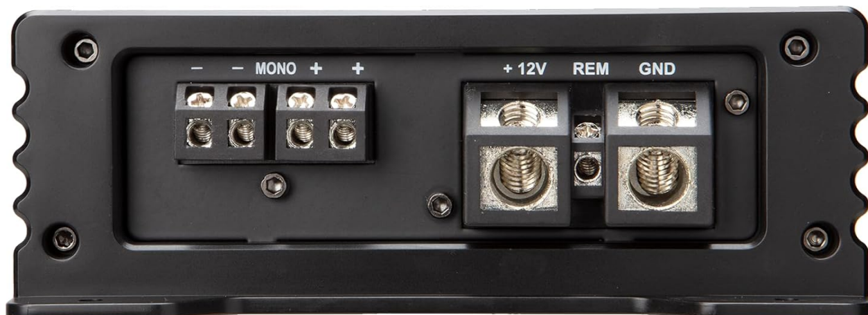
Figure 5.2: Close-up of the power (+12V, REM, GND) and mono speaker output terminals on the amplifier.