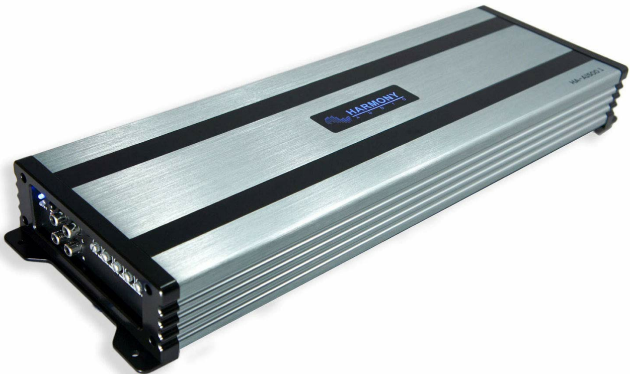
Figure 5.1: Top-down view of the HA-A1500.1 amplifier, showing its compact design suitable for various mounting locations.