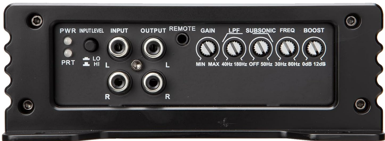
Figure 5.3: View of the amplifier's control panel, showing RCA inputs, gain control, LPF, Subsonic filter, and Bass Boost knobs.