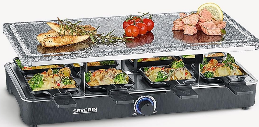
The SEVERIN Raclette Party Grill RG 2372 in operation, with grilled fish, vegetables, and meat on the natural stone plate, and melted cheese with ingredients in the raclette pans below. This image demonstrates typical usage.