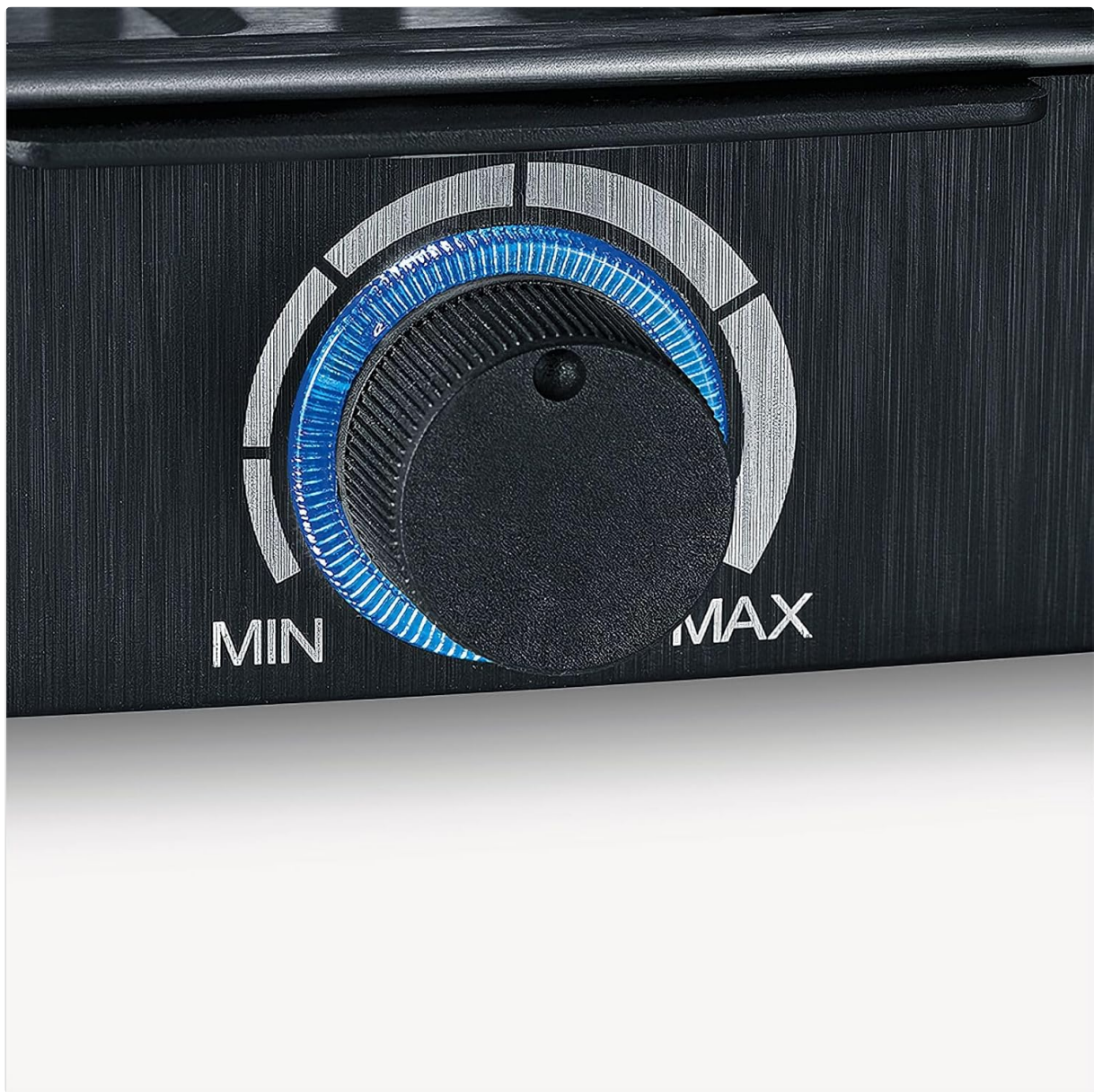
A detailed view of the rotary control knob on the SEVERIN Raclette Party Grill RG 2372. The knob features 'MIN' and 'MAX' settings and is surrounded by an illuminated blue ring, indicating power and temperature adjustment.