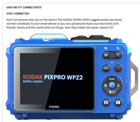
Figure 2.2.2: Rear View. This image shows the back of the camera, featuring the LCD display and various control buttons for navigation and settings.

WPZ2 camera, highlighting the lens, flash, and 'PIXPRO WPZ2' branding.