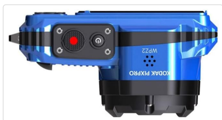
Figure 2.2.3: Top View. This image illustrates the top of the camera, where the power button and shutter release button are located.