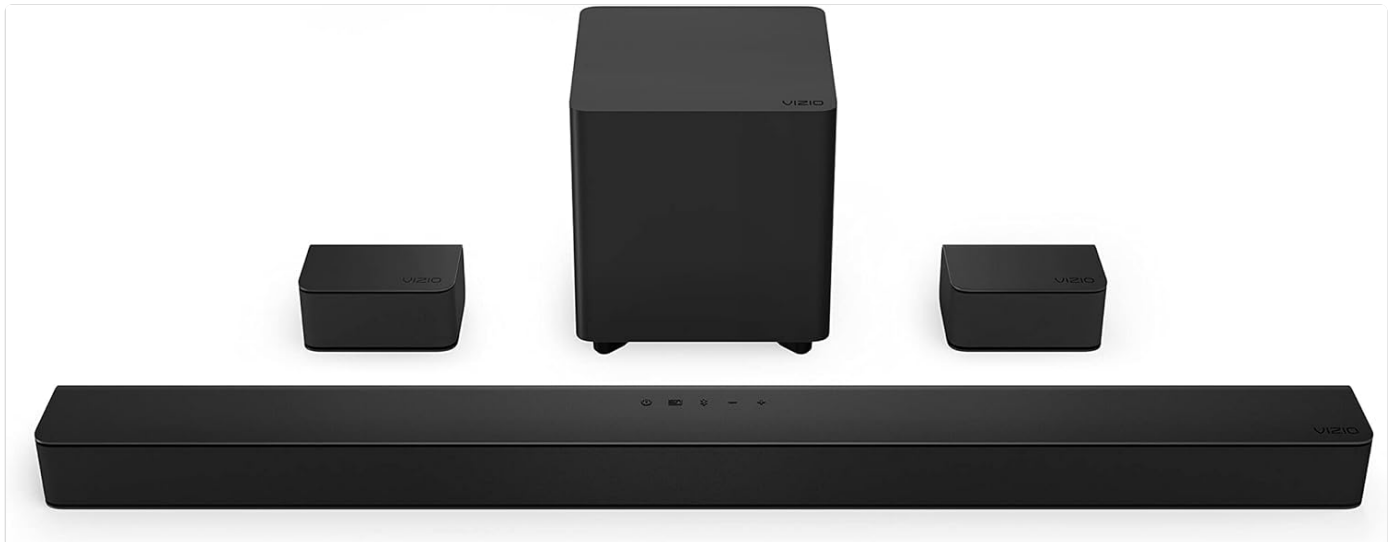
Image: The complete VIZIO V-Series 5.1 Home Theater Sound Bar system, showcasing the soundbar, wireless subwoofer, and two compact satellite speakers.

The VIZIO V-Series 5.1 Home Theater Sound Bar system is designed to deliver an immersive audio experience for your home entertainment. This system includes a sound bar, a wireless subwoofer, and two satellite speakers, providing 5.1-channel surround sound with Dolby Audio and DTS Digital Surround support. It offers versatile connectivity options including HDMI ARC and Bluetooth for seamless integration with your devices.