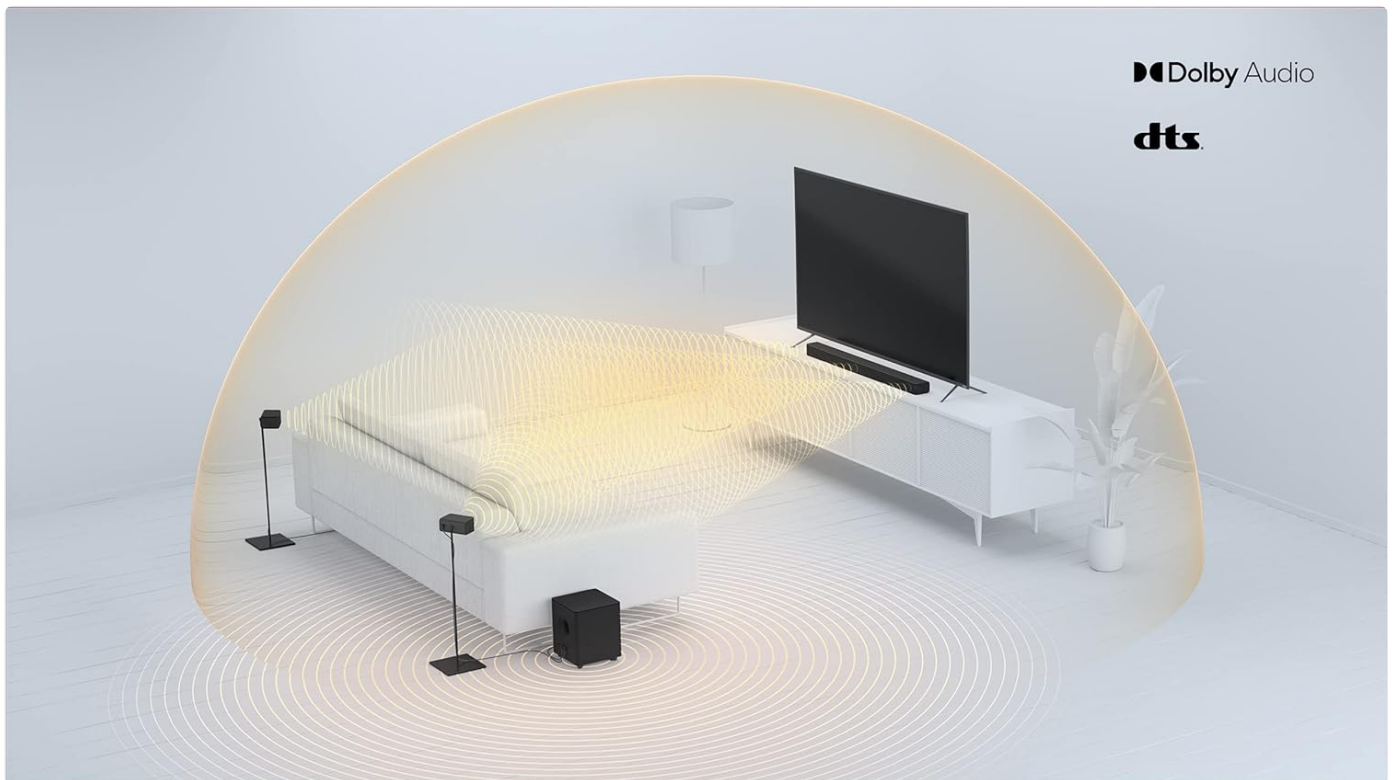
Image: A visual representation of a typical 5.1 home theater setup, illustrating the recommended positions for the soundbar, wireless subwoofer, and two satellite speakers relative to the viewing area.