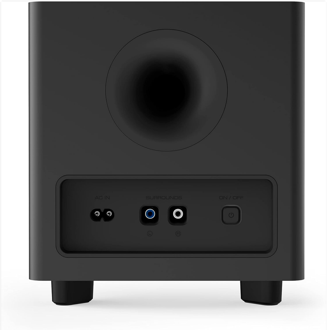
Image: The back panel of the wireless subwoofer, displaying the power input and the RCA output jacks for connecting the satellite speakers.

5. Power: Connect the power cables to the soundbar and wireless subwoofer, then plug them into a power outlet.