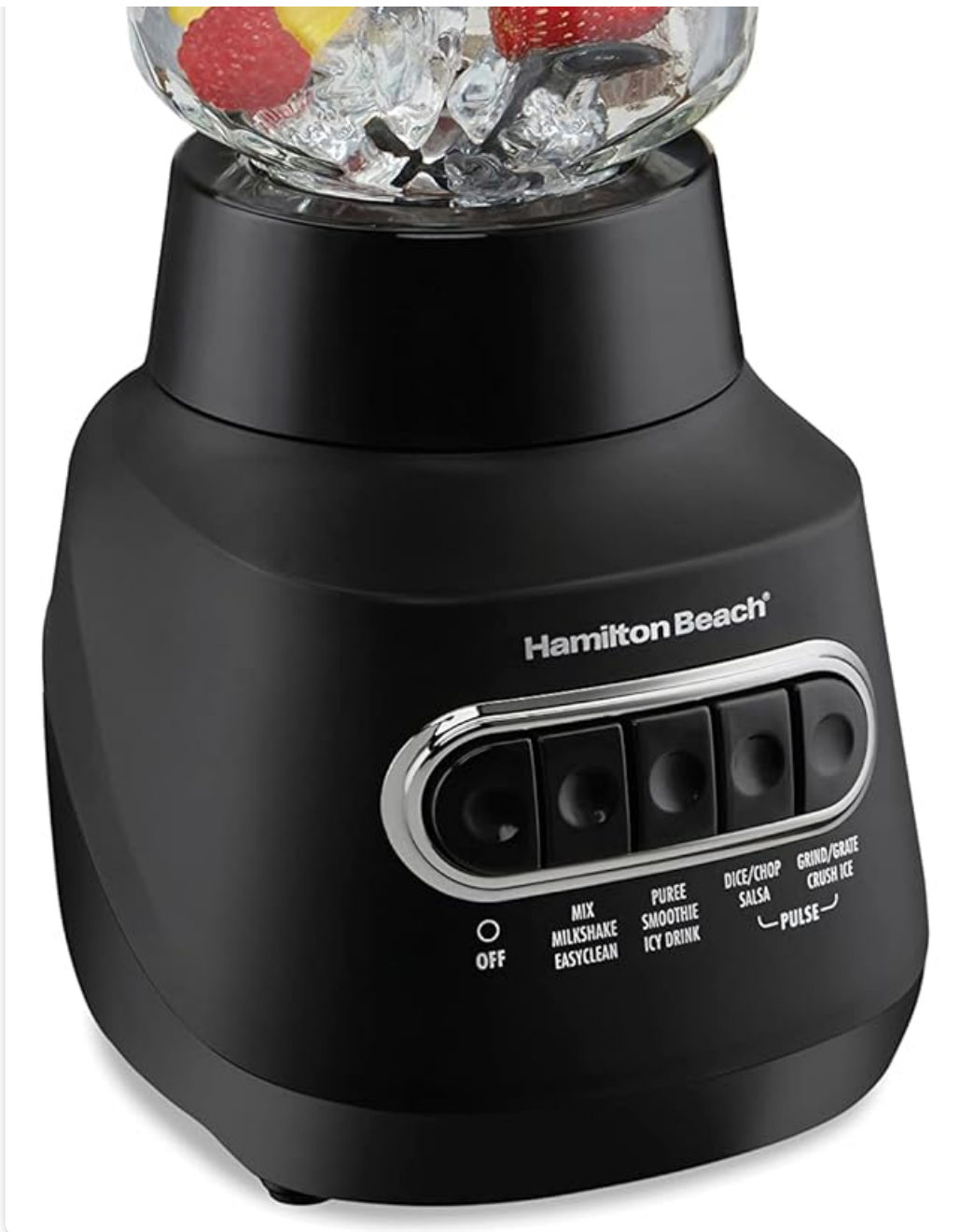
Image: The Hamilton Beach Wave Action Blender, featuring a black base and a clear glass jar filled with colorful fruits and ice, ready for blending.