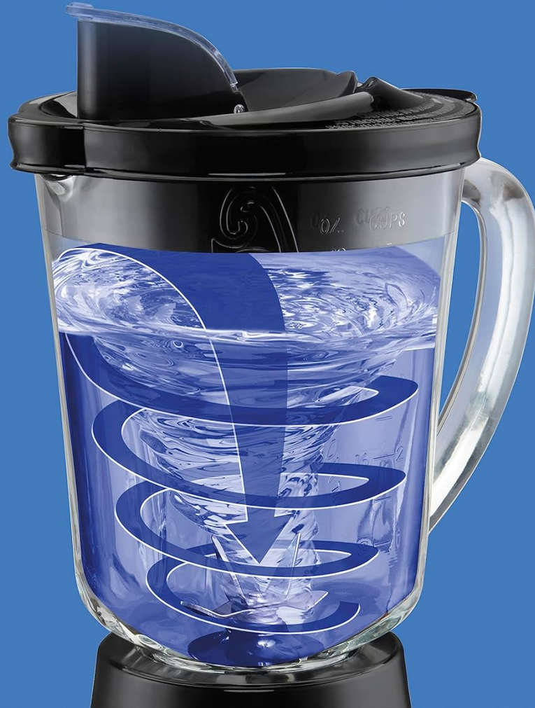
Image: A diagram showing the patented Wave~Action system, where ingredients are continuously forced down into the blades and circulated for ultra-smooth results.

Patented Wave~Action® system continuously forces ingredients into blades