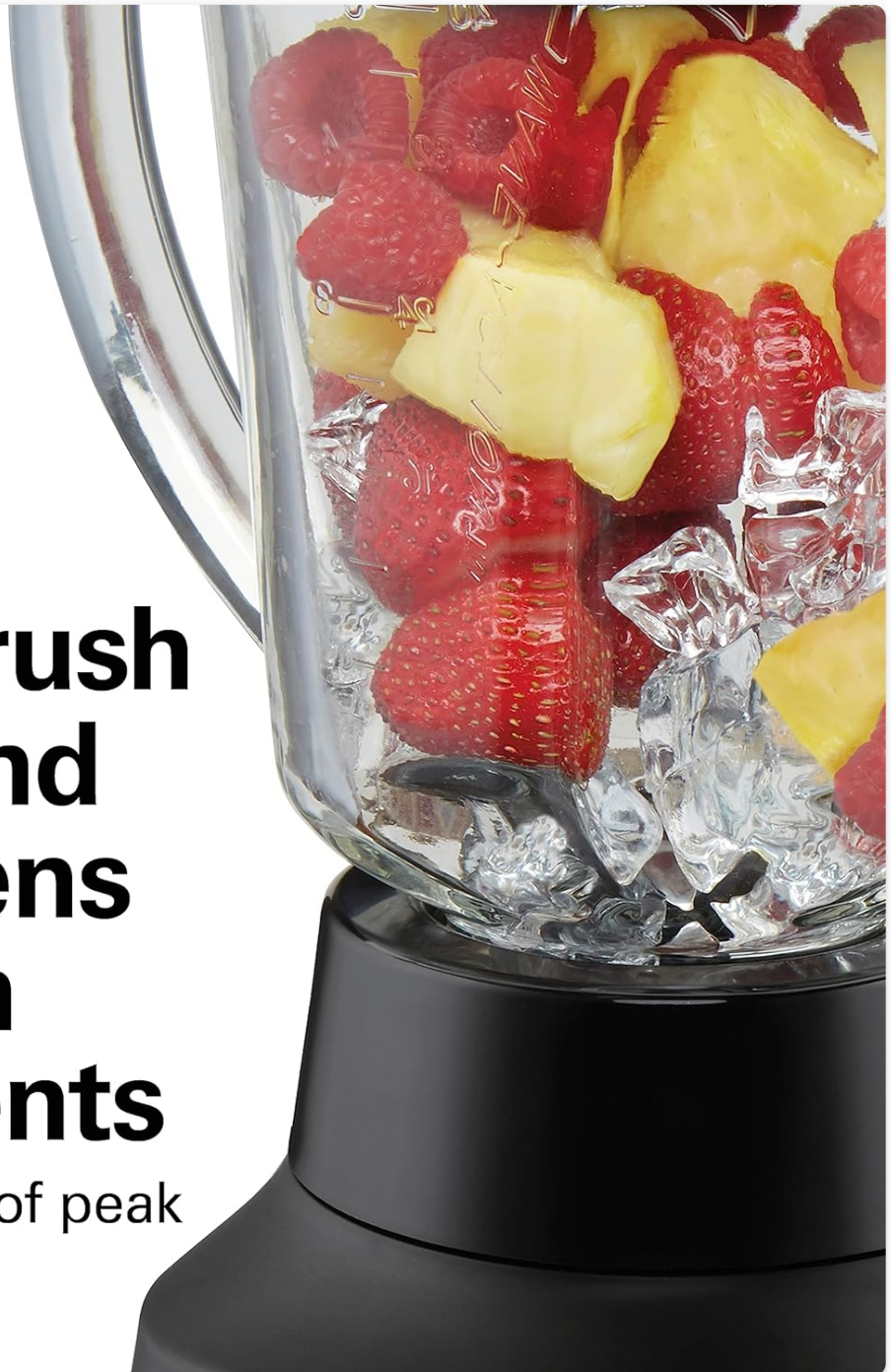
Image: The blender jar filled with ice, leafy greens, and frozen fruit, demonstrating its capability to crush and blend various ingredients.