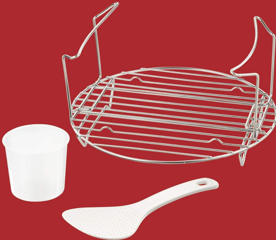
Figure 2: All included accessories: the lift-out roasting/steaming rack, rice measuring cup, and rice paddle.

Comes with a lift-out roasting/steaming rack, plus a rice measuring cup and paddle