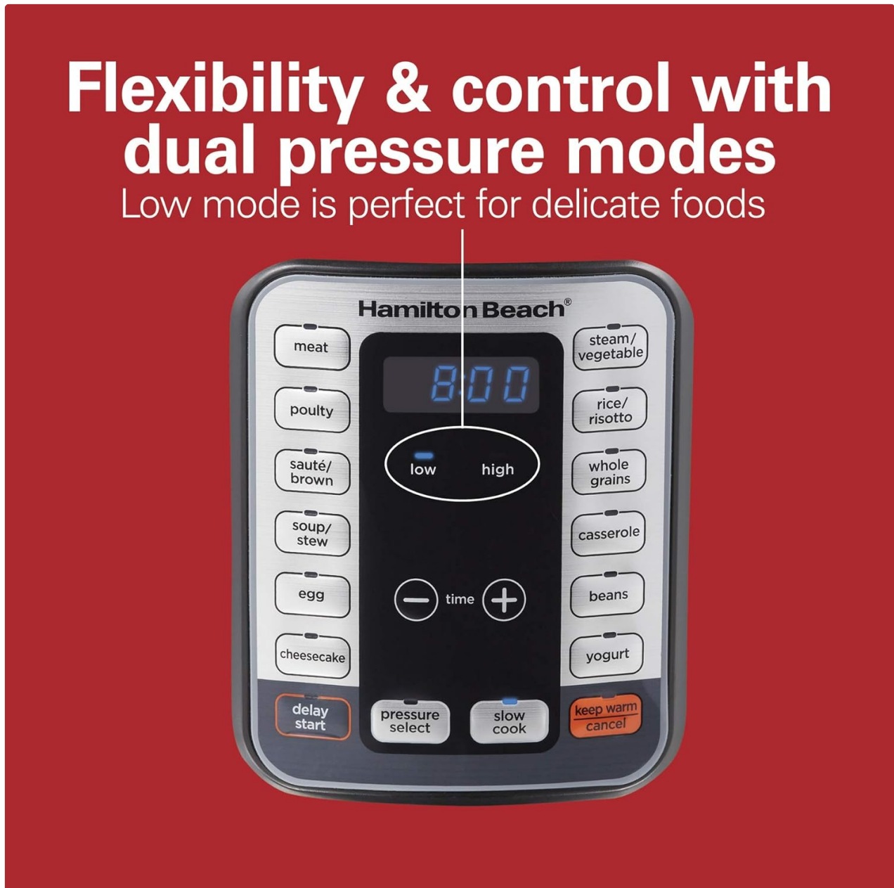
Figure 4: Detailed view of the control panel, showing preset buttons and pressure mode selection.

The front panel features a digital display and dedicated buttons for each cooking function, along with time and pressure adjustments.