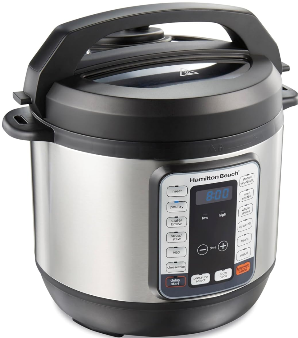
Figure 6: The dishwasher-safe inner pot simplifies cleanup after cooking.

With dishwasher safe 8 quart nonstick pot and stainless steel exterior