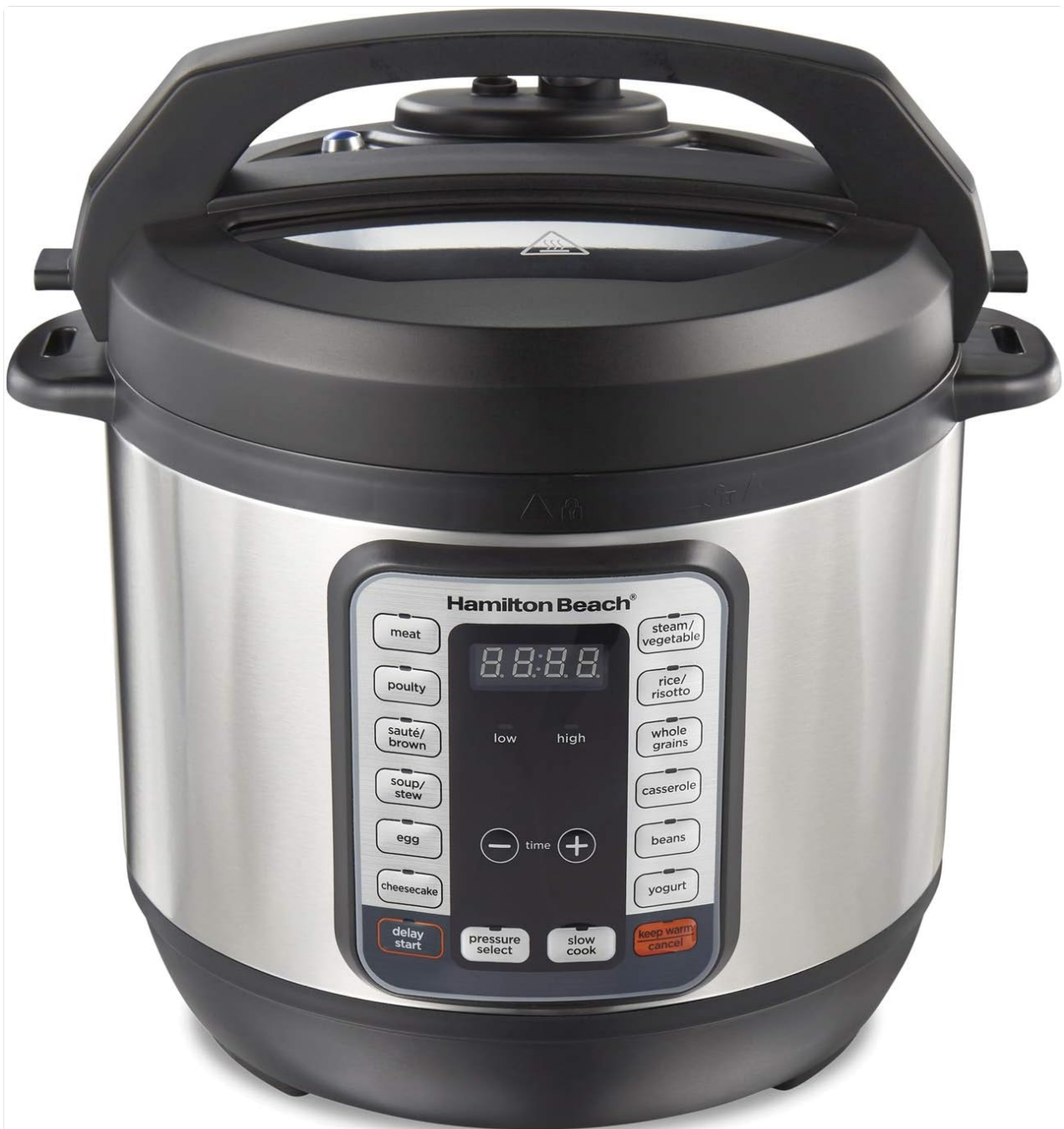
Figure 1: The Hamilton Beach 12-in-1 Electric Pressure Cooker, showcasing its sleek stainless steel design and control panel.