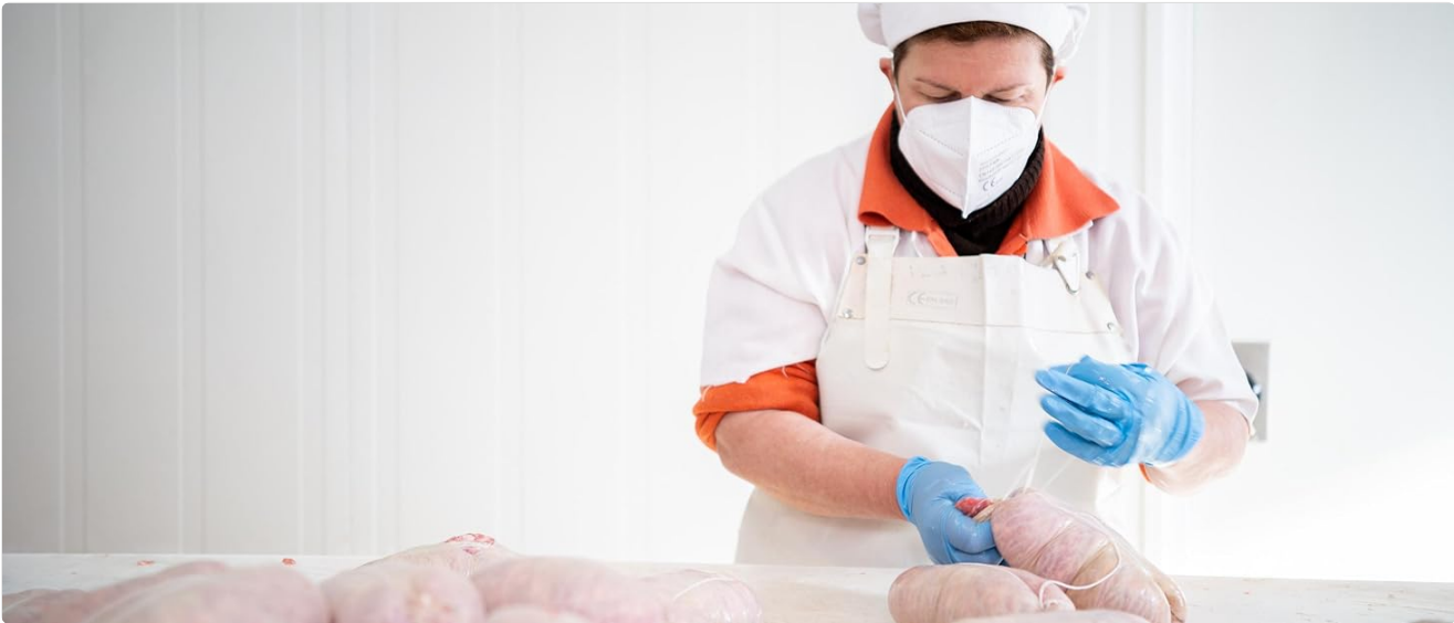
Image: A scene from the Moretti production, highlighting the commitment to traditional Calabrian culinary practices and quality ingredients.

For further assistance, please refer to the seller's contact information or visit the official Moretti website for the most up-to-date support options.