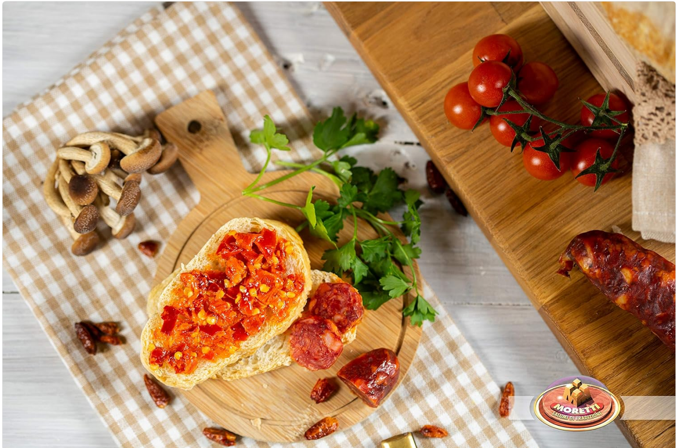
Image: Two pieces of bruschetta topped with Moretti Calabrian Chili Pepper Cream, garnished with parsley and surrounded by dried chili peppers and sliced sausage.