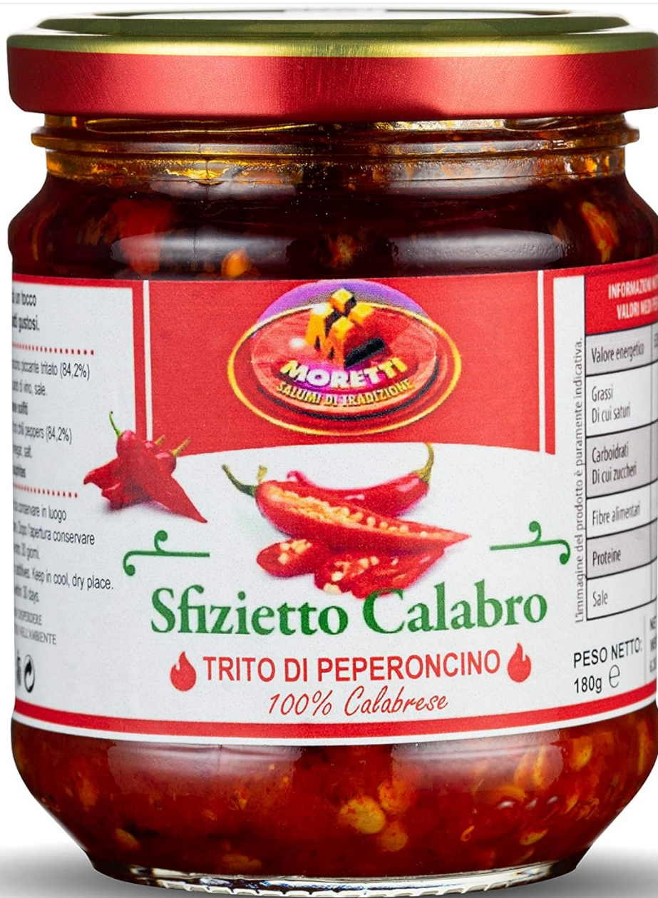
Image: A glass jar of Moretti Calabrian Chili Pepper Cream, showcasing its vibrant red color and label.