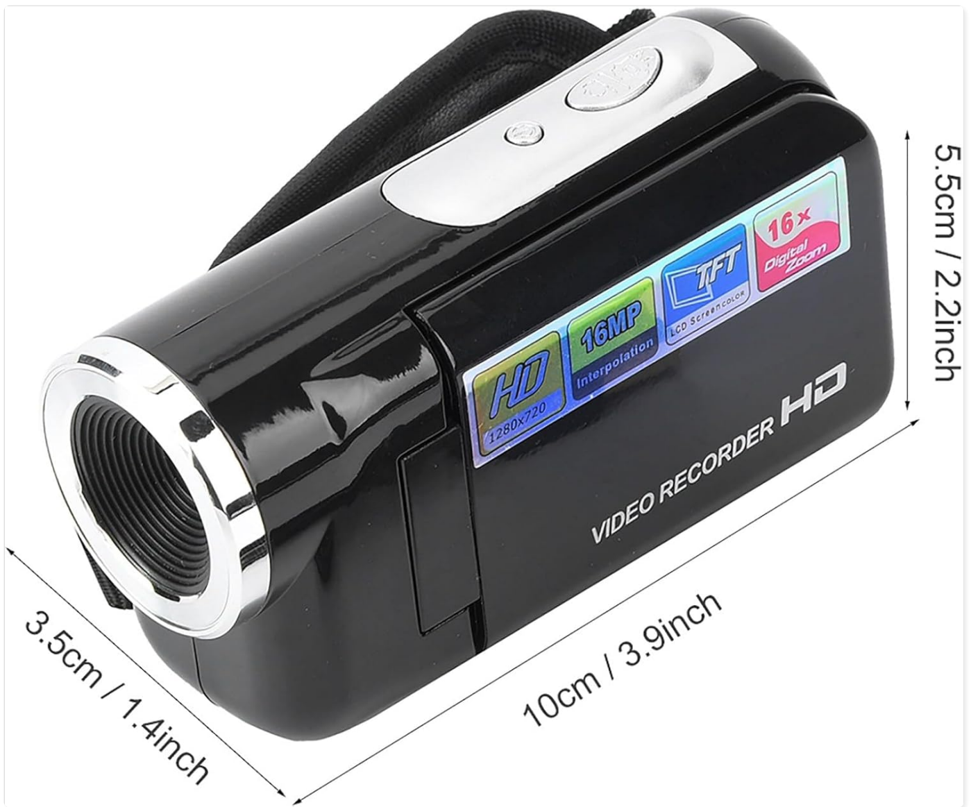
Image: Diagram illustrating the approximate dimensions of the camcorder: 10cm (3.9 inches) length, 5.5cm (2.2 inches) height, and 3.5cm (1.4 inches) width.