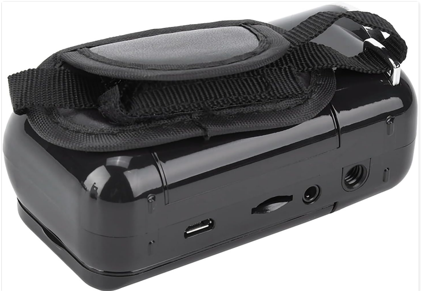
Image: The rear view of the camcorder, highlighting the various ports and slots, including the Micro SD card slot and USB port.