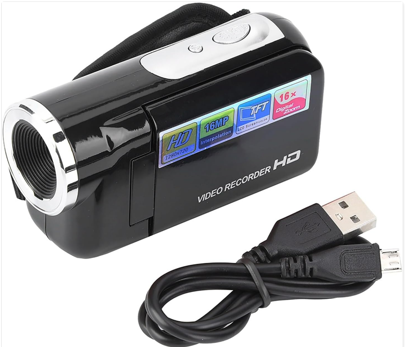
Image: The camcorder alongside its Micro USB cable, illustrating the connection method for data transfer.