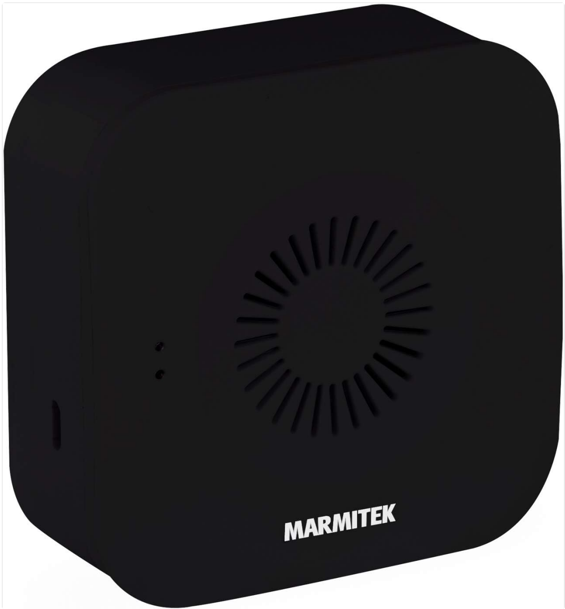
Image: Front view of the Marmitek Bell ME BLK wireless chime, showcasing its minimalist design and speaker grille.