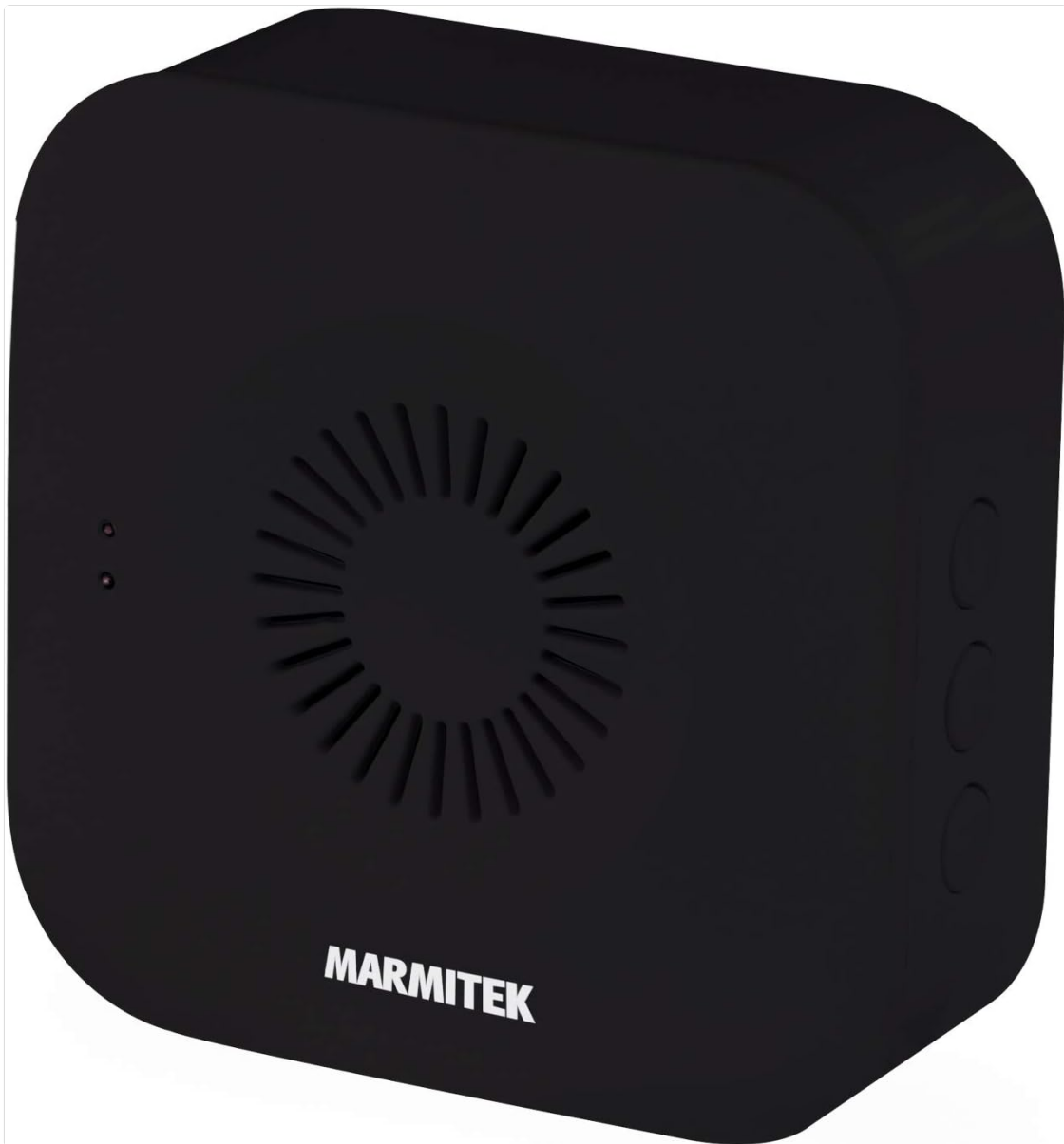
Image: Side view of the Marmitek Bell ME BLK wireless chime, highlighting the control buttons for settings.