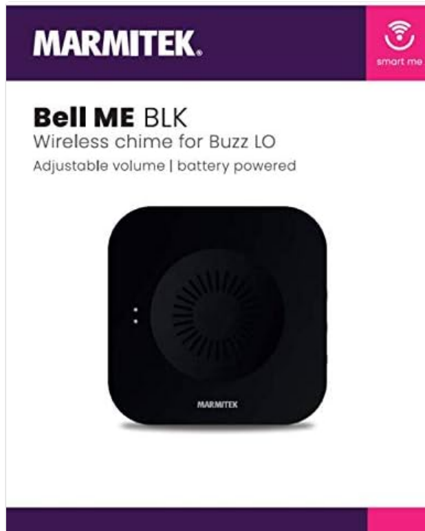
Image: The retail packaging for the Marmitek Bell ME BLK wireless chime, showing the product name and key features.