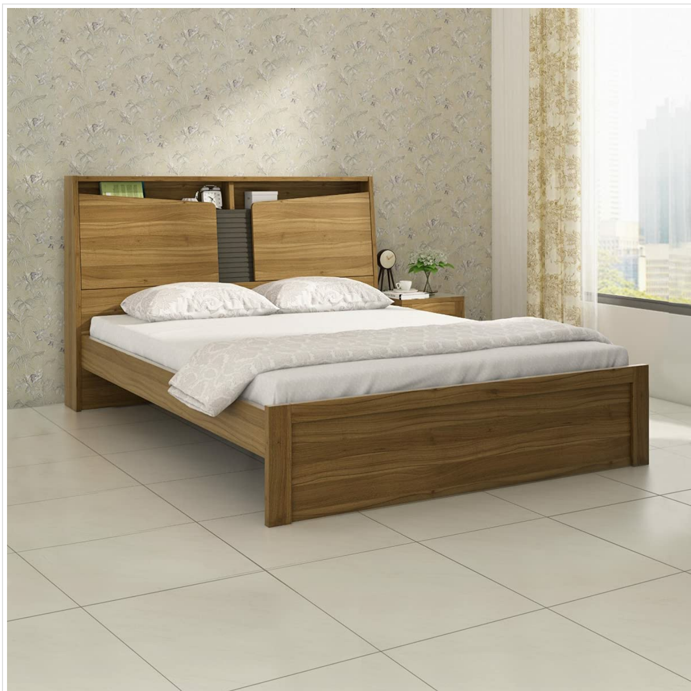
Figure 1: Home Centre Quadro Flex Queen Size Bed (General View)