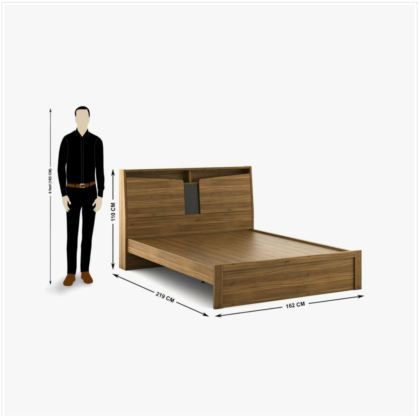
Figure 2: Bed Dimensions Overview