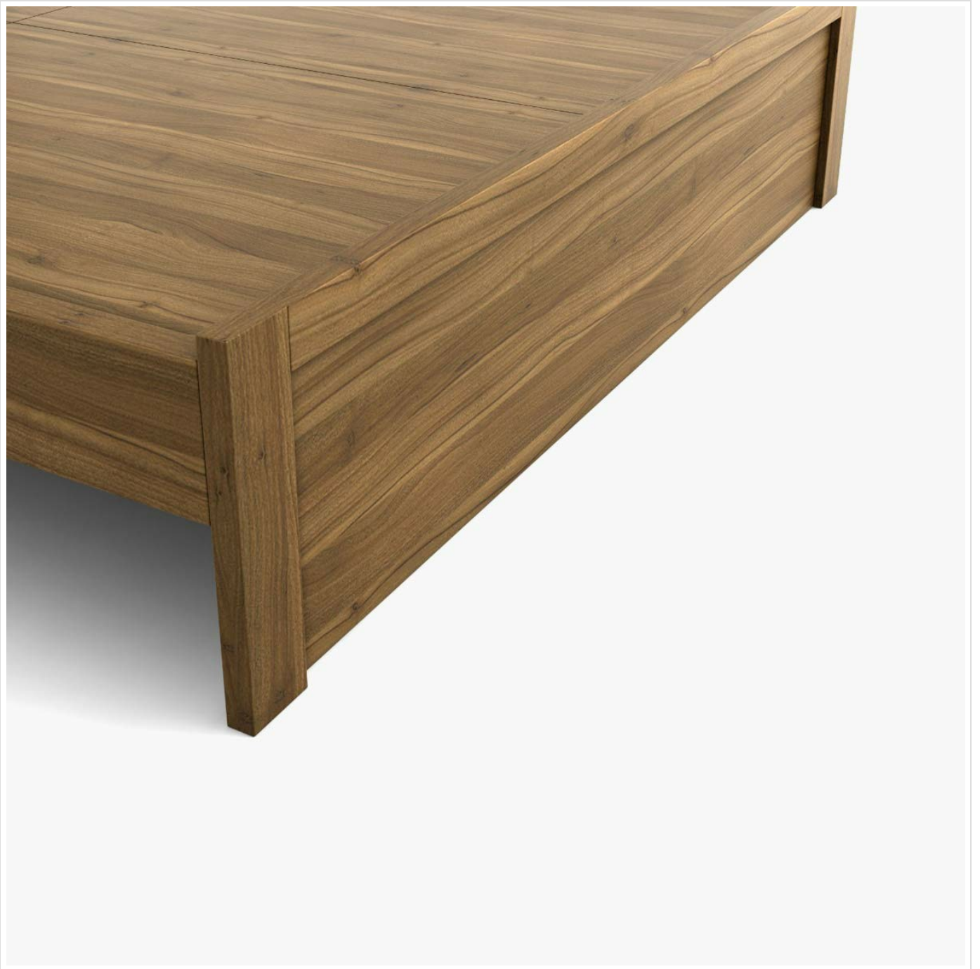
Figure 3: Headboard with Integrated Storage (Closed)