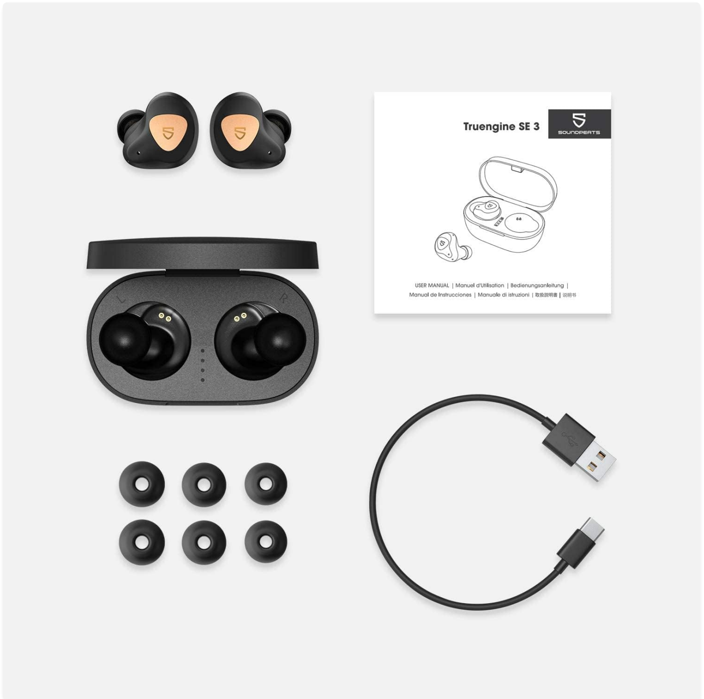
Image: Contents of the SoundPEATS Truengine 3 SE package, including earbuds, charging case, user manual, USB-C charging cable, and multiple sizes of ear tips.