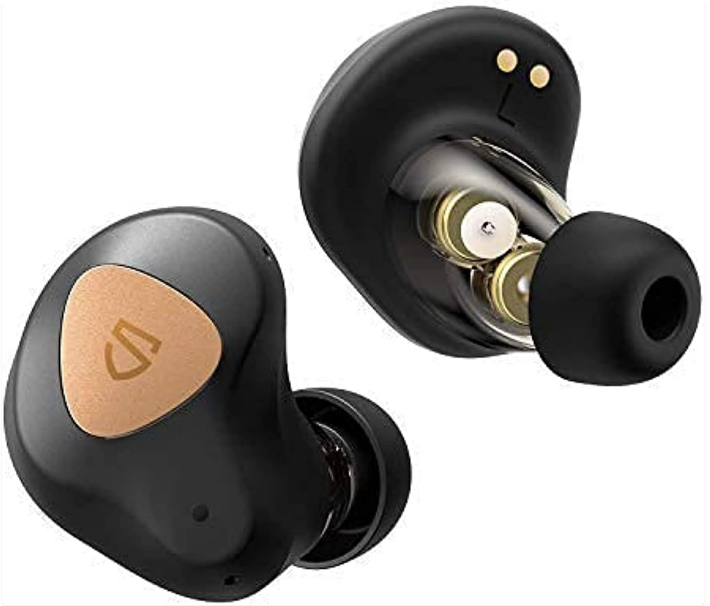
Image: Front view of the SoundPEATS Trueengine 3 SE wireless earbuds, showcasing their ergonomic design and the SoundPEATS logo.