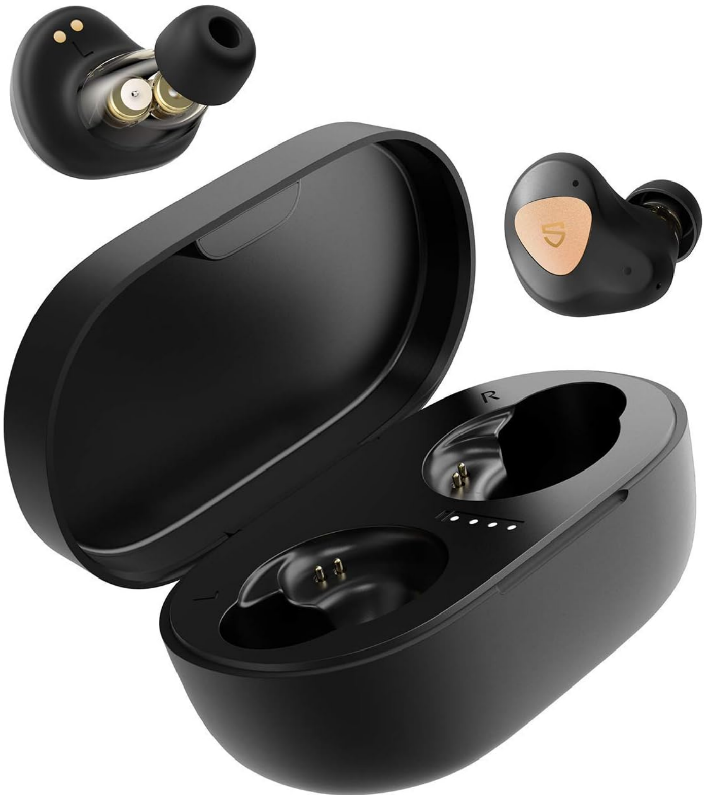
Image: SoundPEATS Truengine 3 SE Wireless Earbuds, showing both earbuds and the open charging case.