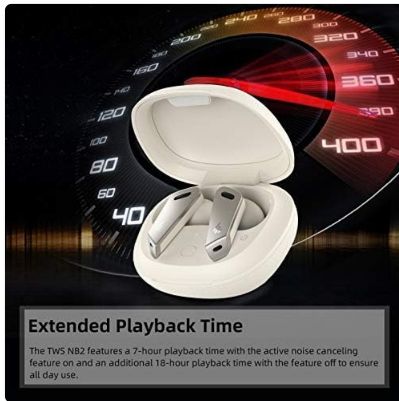
Image: The earbuds in their case with a speed gauge background, illustrating the extended playback time of up to 32 hours.

Your browser does not support the video tag.