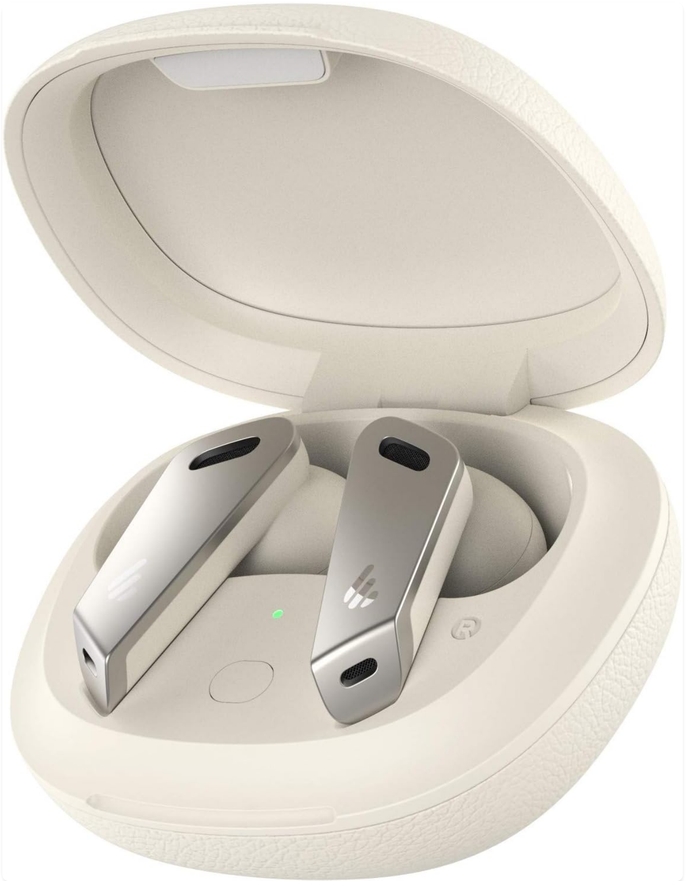
Image: The Edifier TWS NB2 earbuds resting in their open charging case, showcasing their sleek design and compact form factor.