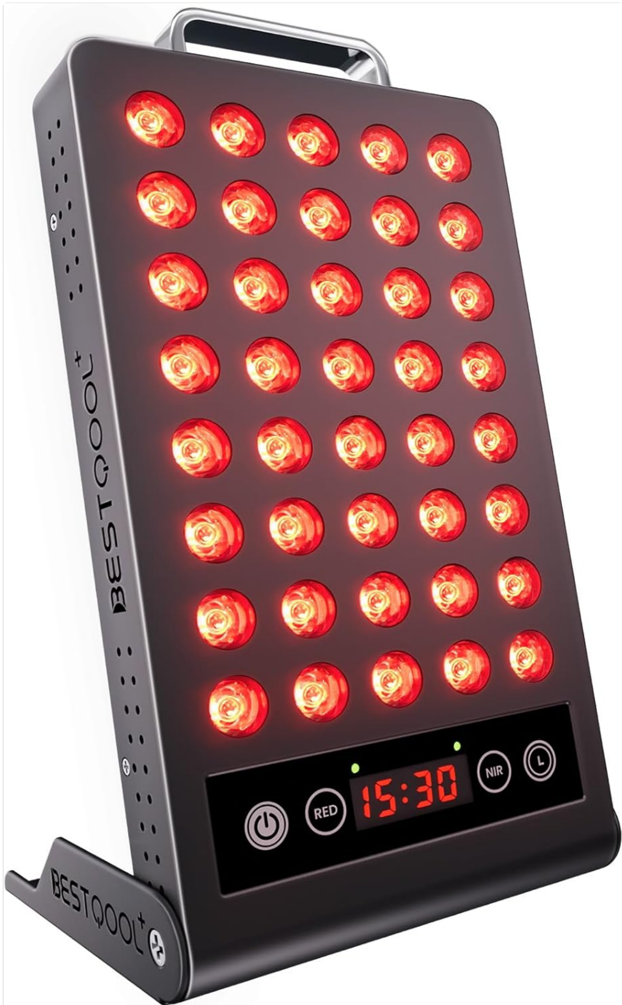
Figure 1: Bestpool BQ40 Red Light Therapy Device