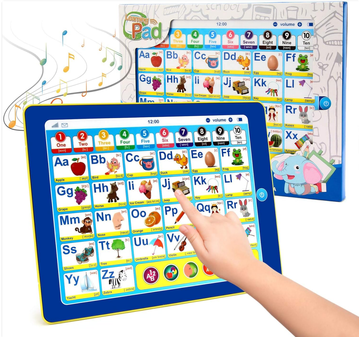
Image: Front view of the BEAURE WP9902 6-in-1 Kids Educational Learning Tablet.

The BEAURE WP9902 is an interactive learning tablet designed for early childhood education. It features a touch-sensitive surface with various learning modes.