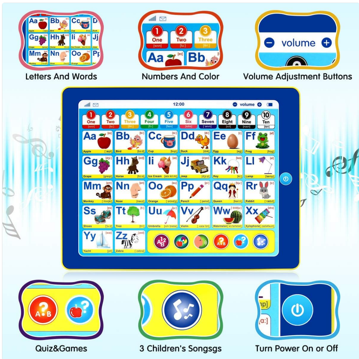
Image: The tablet displaying different learning sections for letters, words, numbers, colors, and controls for volume, quiz, songs, and power.