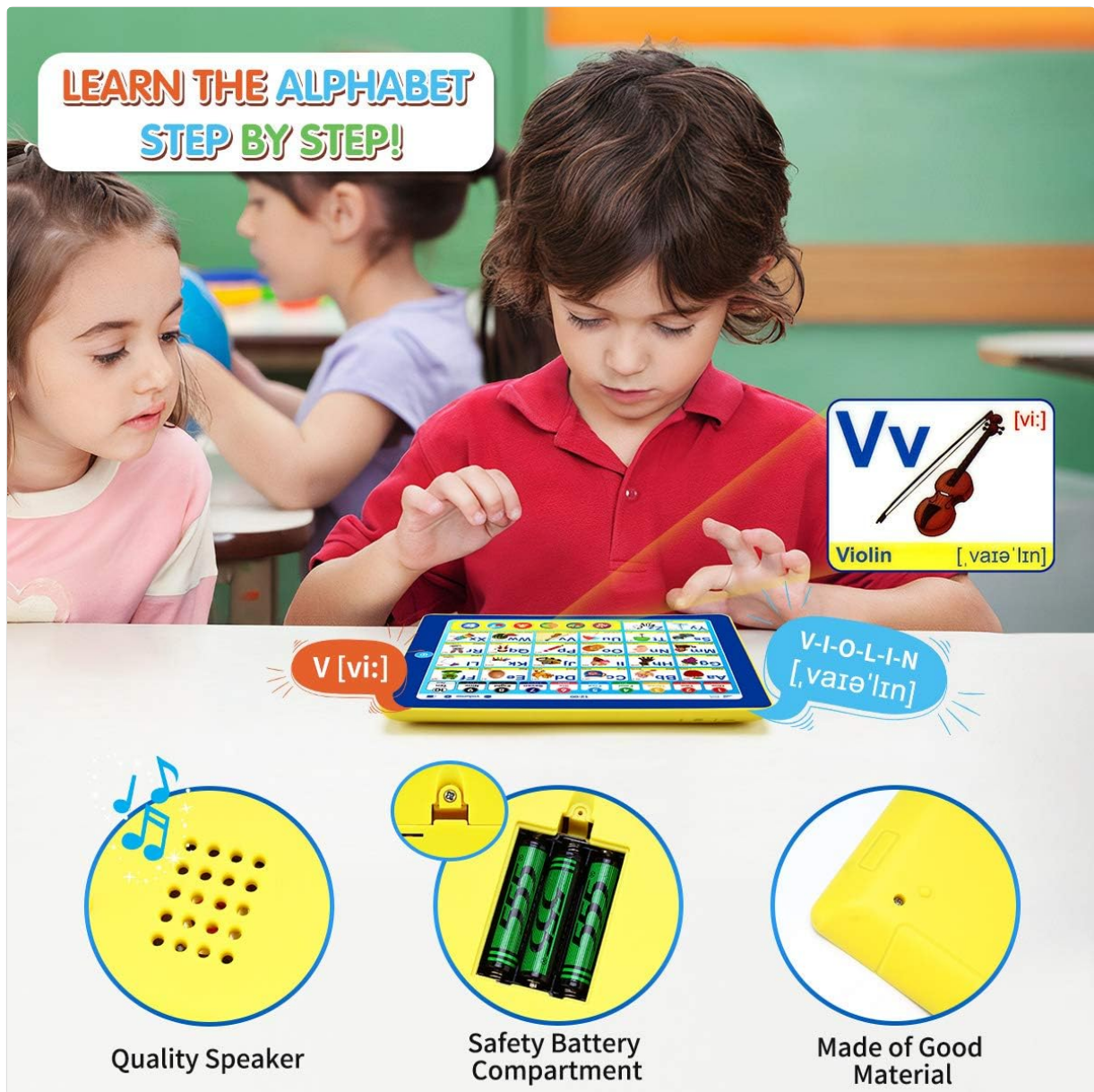
Image: A detailed view of the tablet's back, showing the speaker, safety battery compartment with AAA batteries, and the material construction.