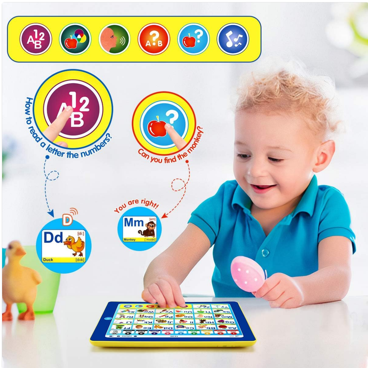
Image: A young child happily interacting with the learning tablet, which displays letters, numbers, and associated images.