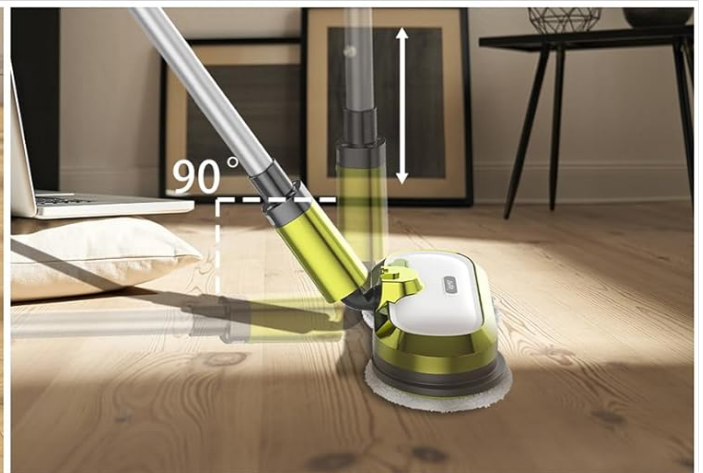
Image: The mop head swivels 180 degrees horizontally and 90 degrees vertically, showcasing its maneuverability and self-propelled feature.