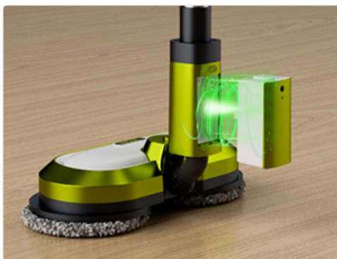
Image: A close-up view of the detachable battery being inserted into the mop's main unit.