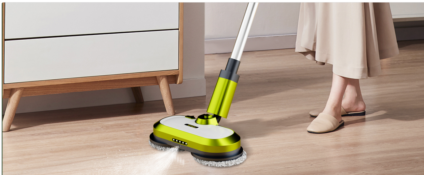
Image: The LED headlight on the front of the mop head helps to reveal hidden dirt and dust, ensuring a thorough clean.