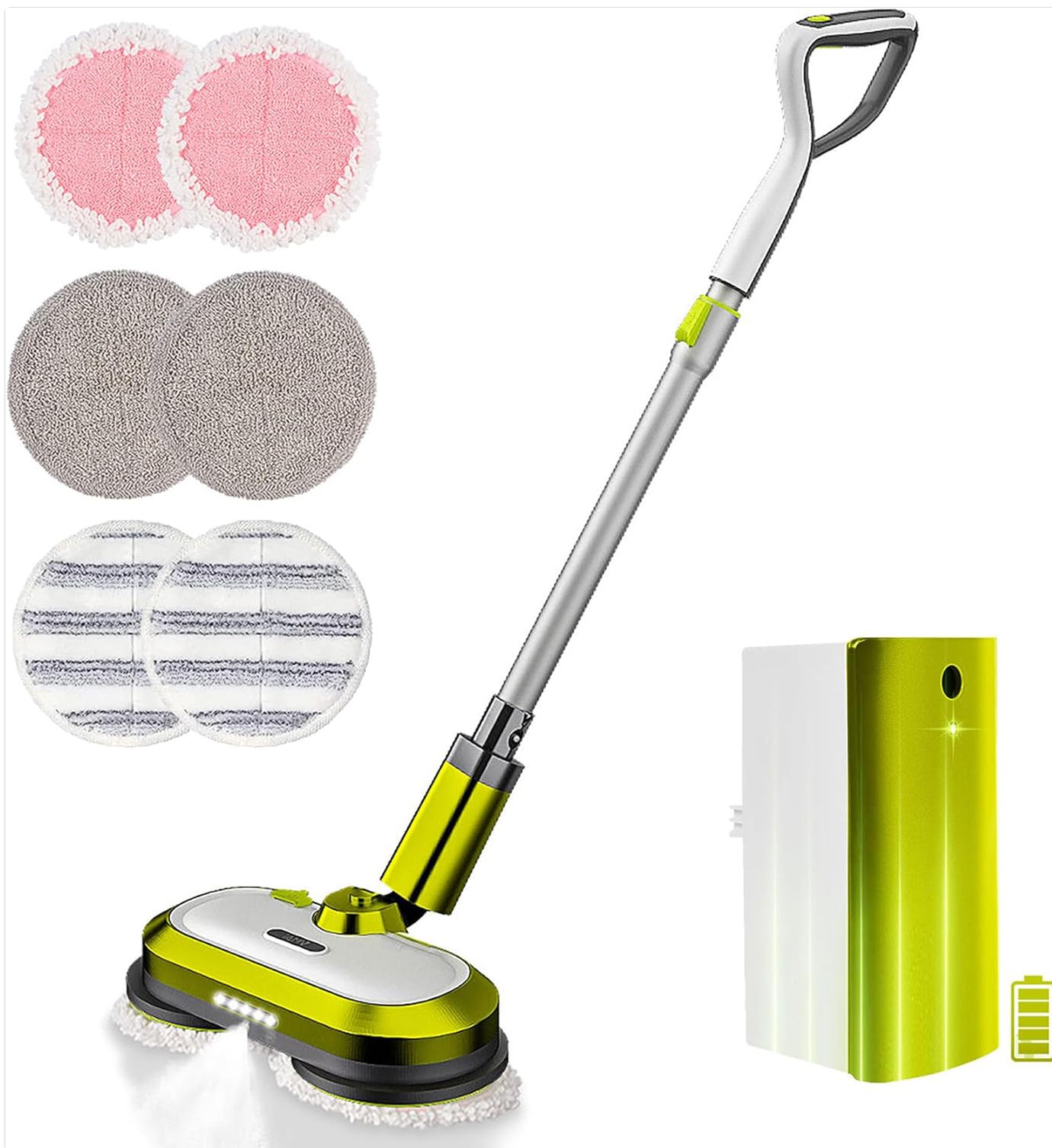
Image: The VMAI Cordless Electric Mop with its included accessories, including the main unit, handle, battery, charger, and various mop pads.