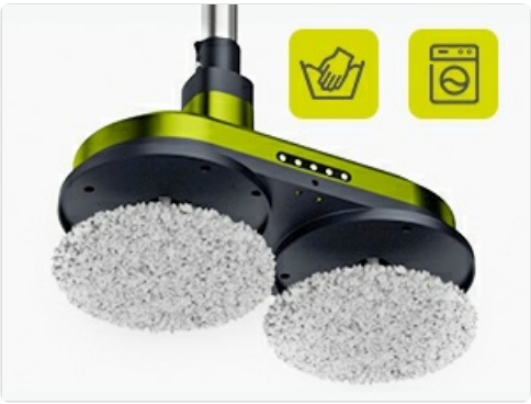
Image: The reusable mop pads can be easily cleaned by hand or in a washing machine for continued use.

To prevent mold buildup and ensure proper function, empty any remaining liquid from the water tank after each use.