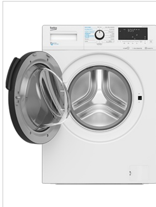
View inside the drum showing the steam function in action.