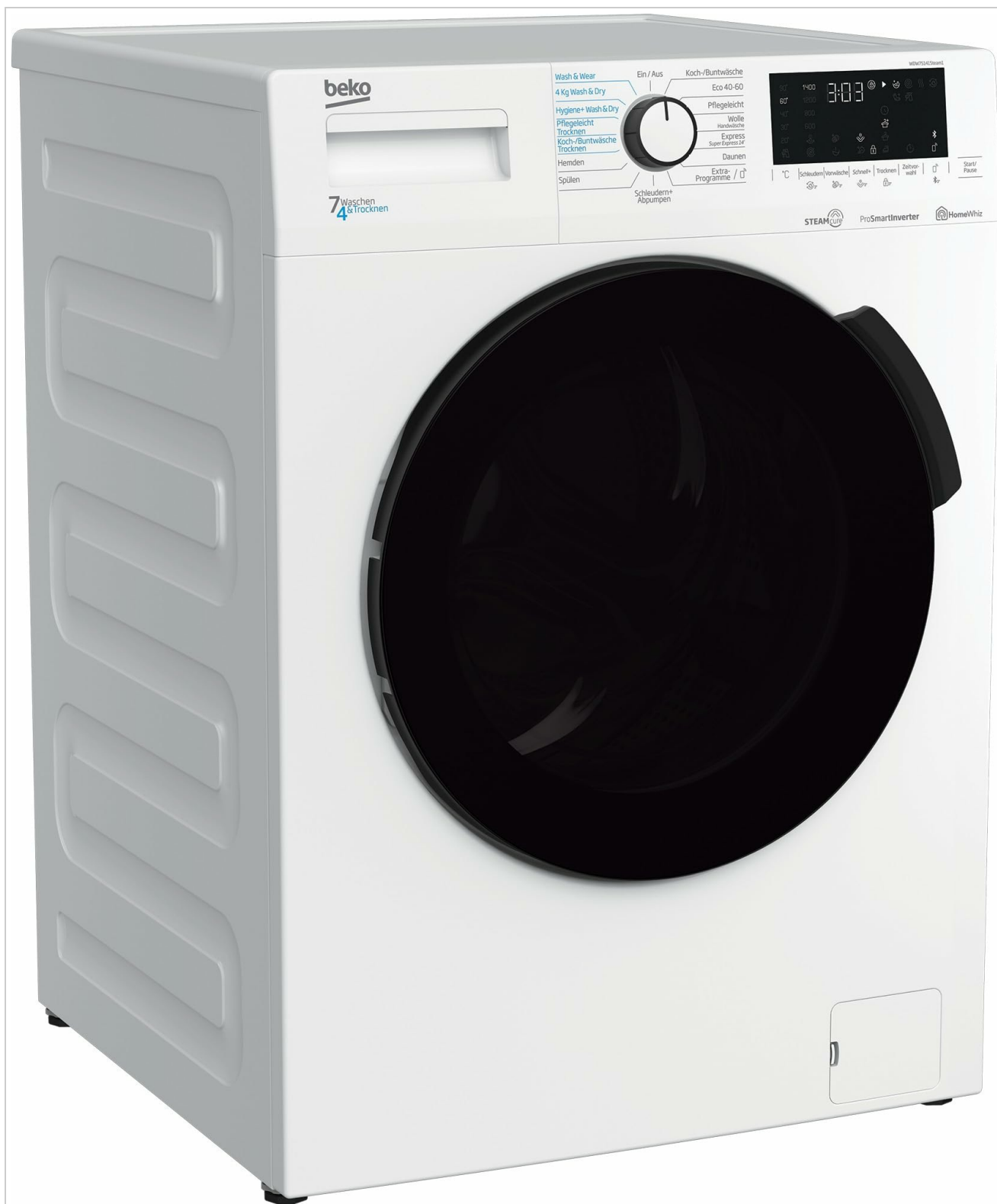
Front view of the Beko WDW75141Steam1 Washer Dryer with the loading door slightly open.