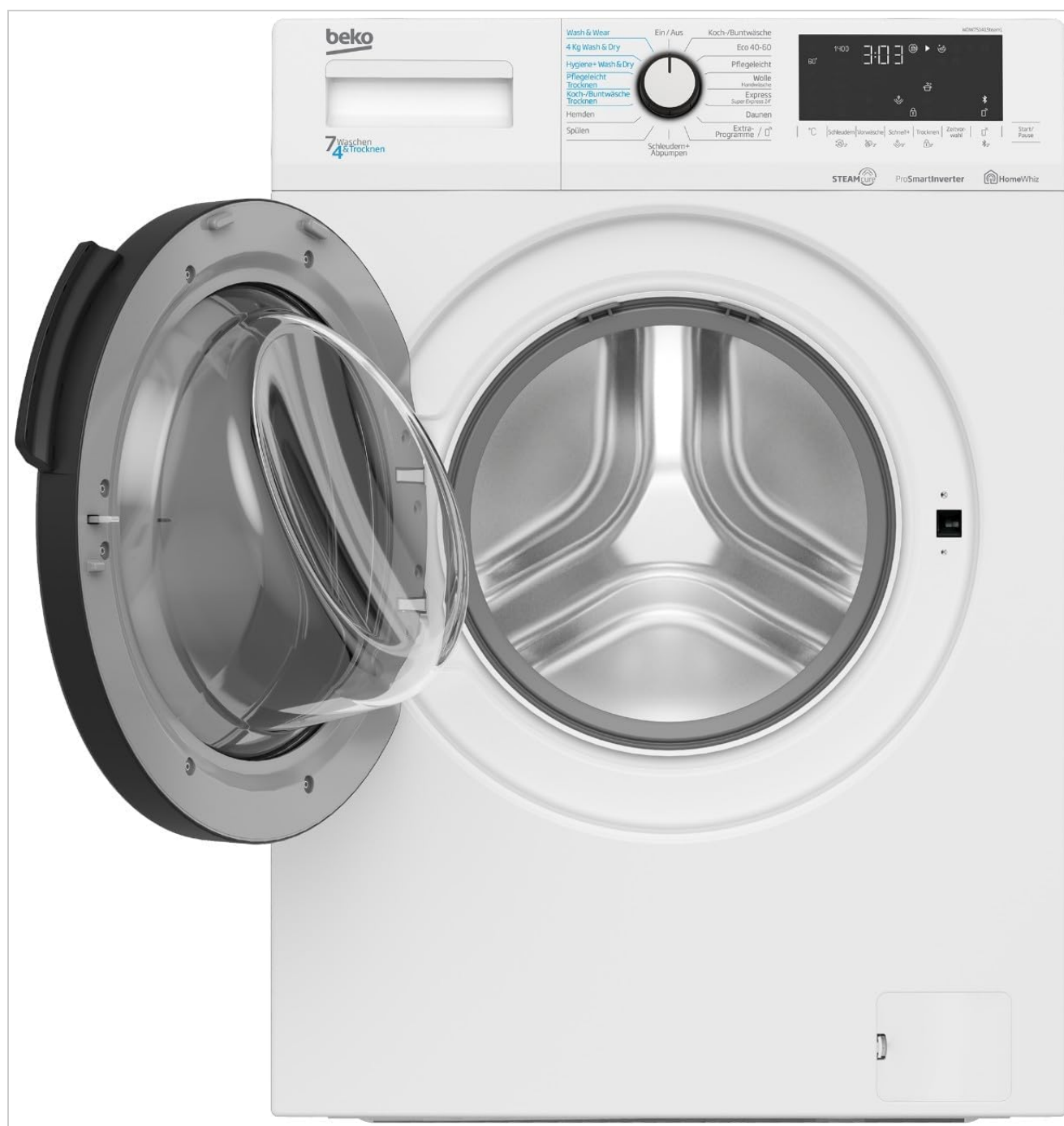
Detailed view of the control panel, showing the program selection dial, digital display, and touch buttons.

The appliance features a touch control panel for easy operation. The main dial allows selection of wash and dry programs, while additional buttons control temperature, spin speed, and special functions.