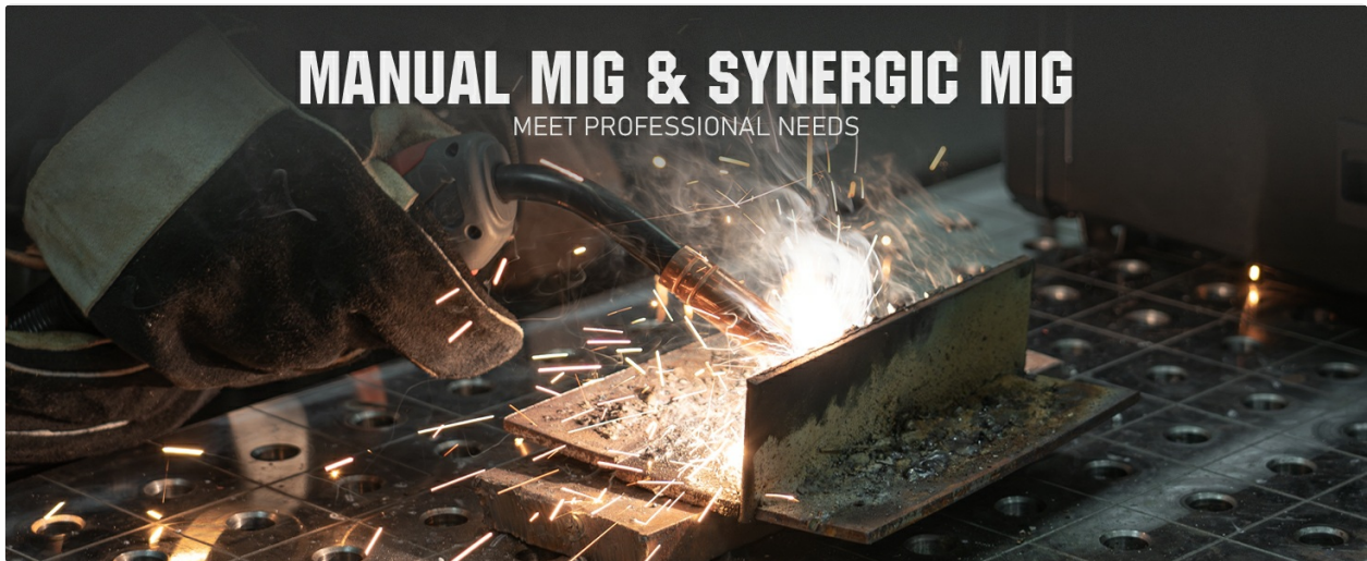
Figure 6.3: Demonstrating Manual MIG and Synergic MIG capabilities.

The MIG-250 PRO offers both Synergic and Manual MIG modes. In Synergic mode, the machine automatically sets optimal voltage based on your selected wire feed speed, simplifying operation for consistent welds. Manual mode provides full control over voltage and wire feed speed for experienced users.