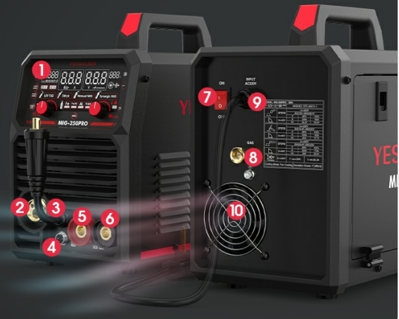
Figure 5.1: Front and rear view of the MIG-250 PRO with labeled components.