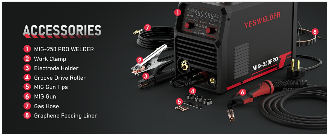
Figure 4.1: All accessories included with the MIG-250 PRO.