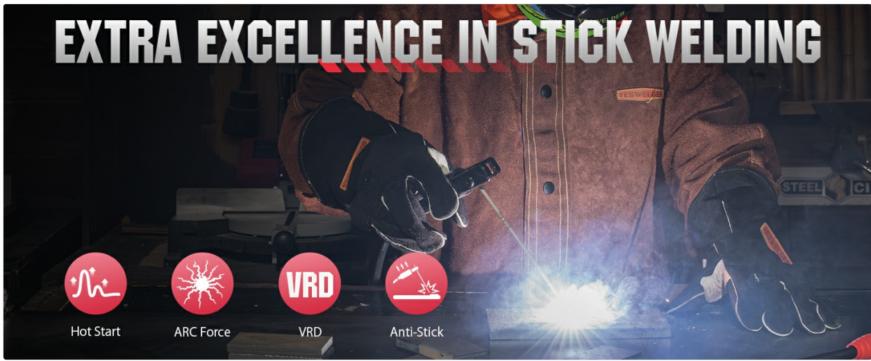
Figure 6.4: Key features for Stick welding, including Hot Start and Anti-Stick.