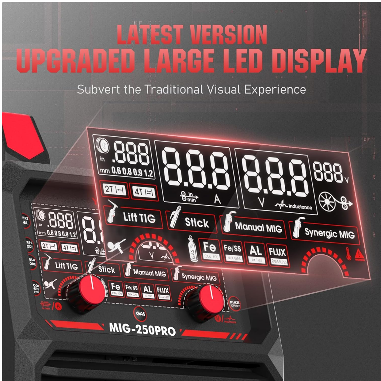
Figure 3.2: Detailed view of the upgraded large LED digital display.