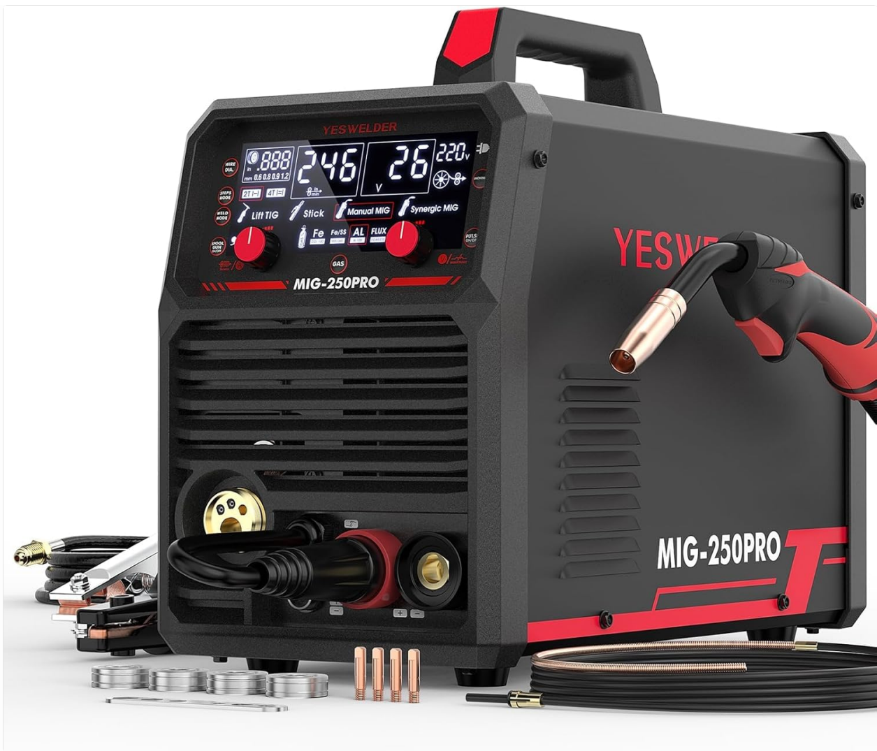
Figure 1.1: The YESWELDER MIG-250 PRO Aluminum MIG Welder.