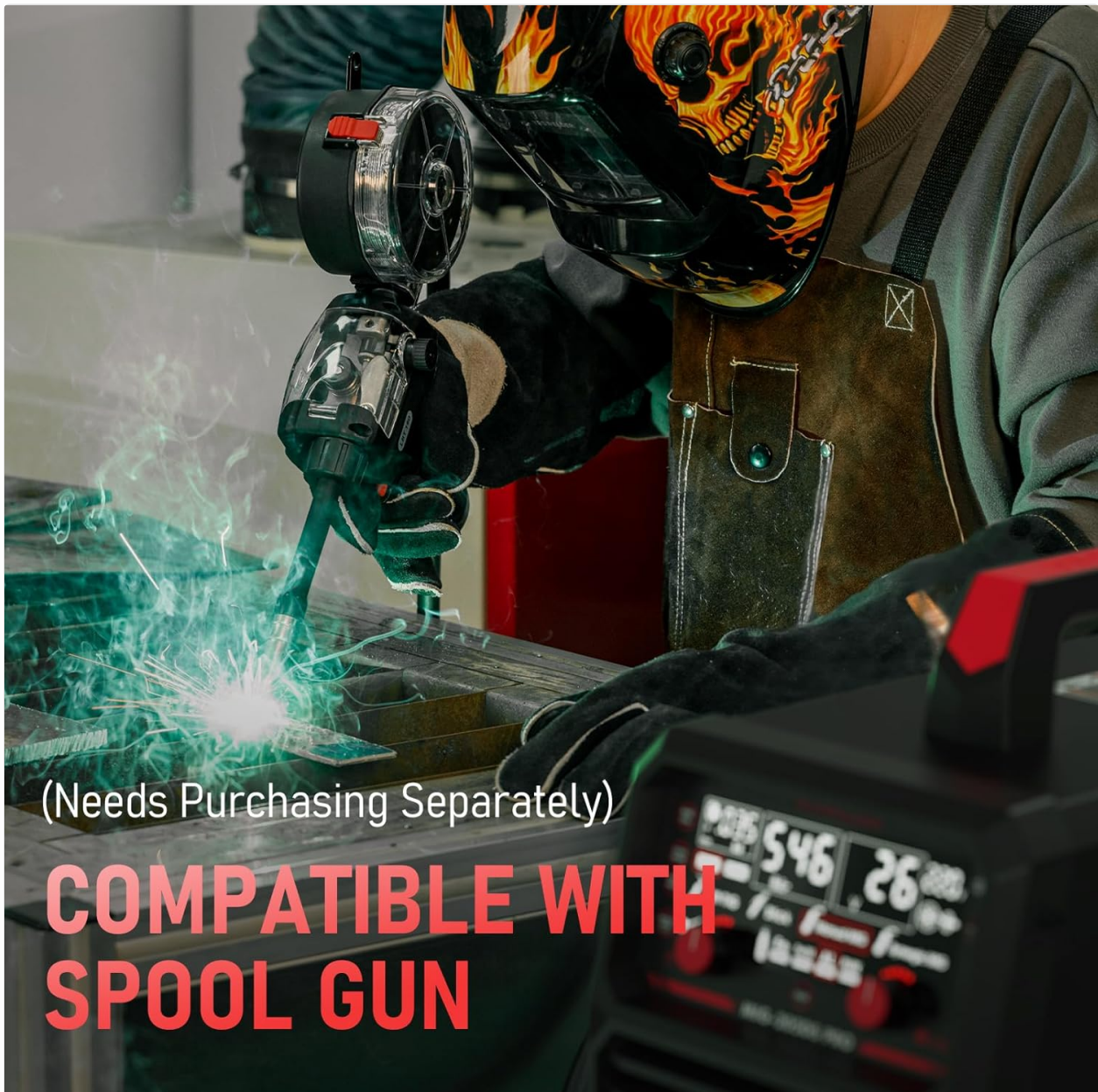
Figure 6.5: The MIG-250 PRO is compatible with spool guns for aluminum welding.

The MIG-250 PRO is compatible with a spool gun (sold separately) for aluminum welding. Connect the spool gun to the dedicated socket and select the Spool Gun mode.