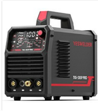
Figure 7.1: Ensure the cooling fan is clean and unobstructed for proper machine operation.