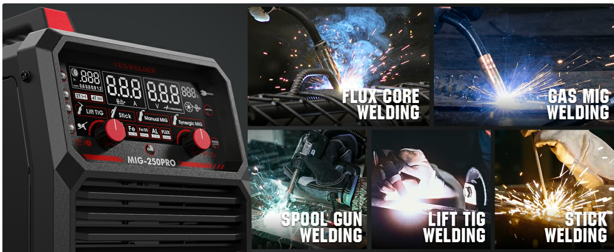
Figure 6.1: Examples of Flux Core, Gas MIG, Spool Gun, Lift TIG, and Stick welding.