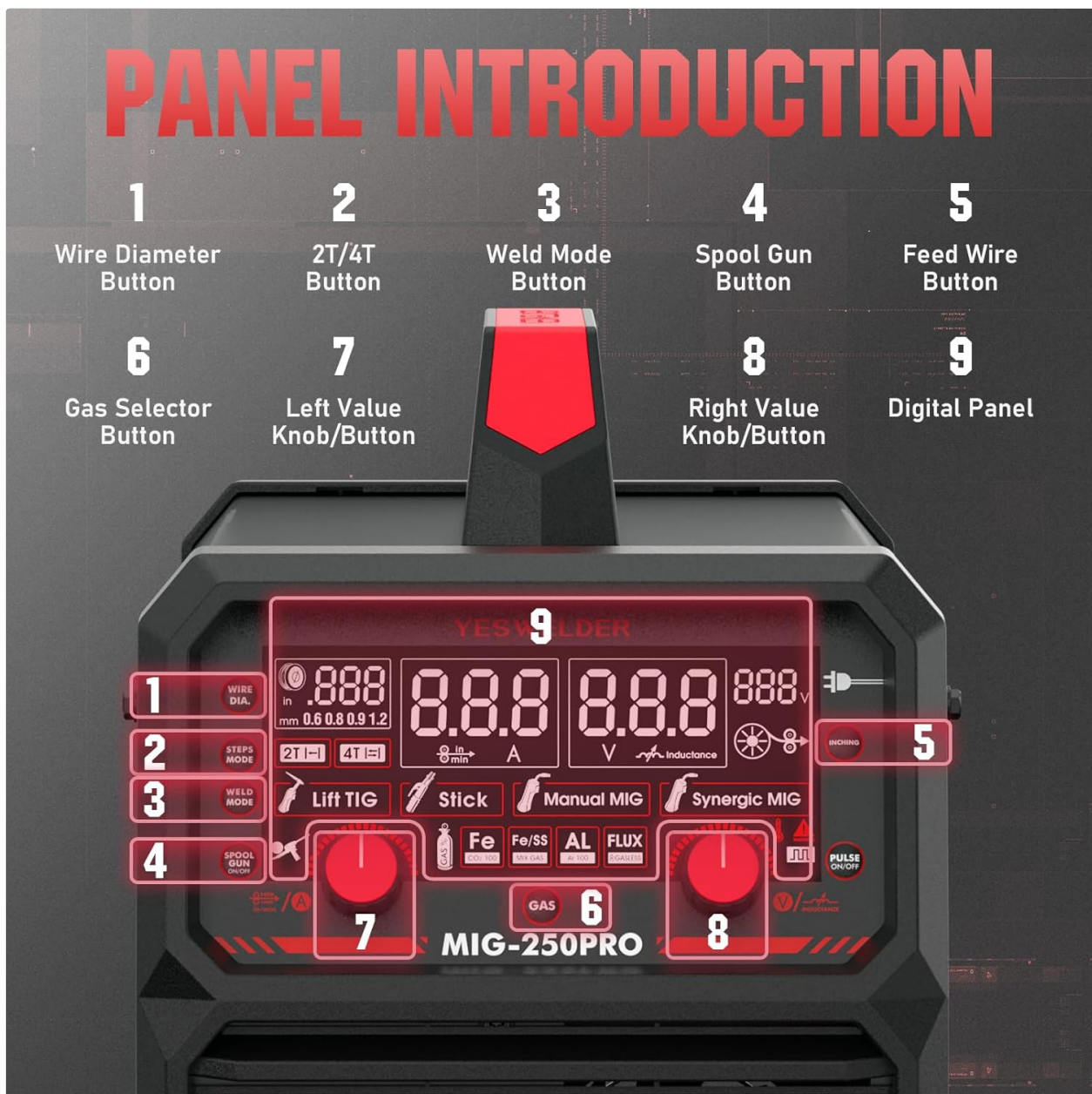
Figure 5.2: Detailed view of the control panel and digital display.