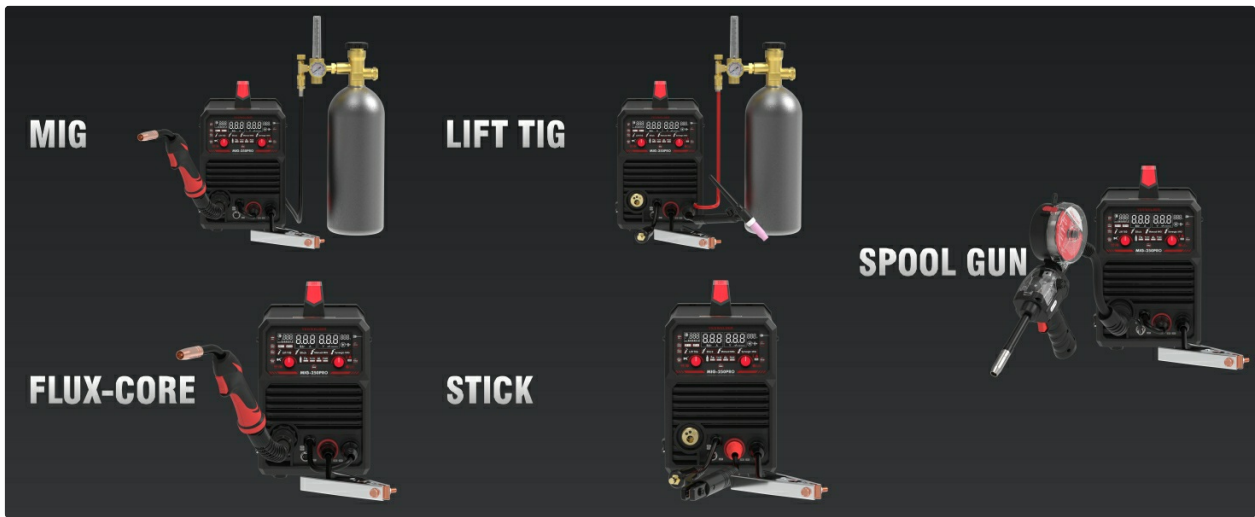
Figure 6.2: Setup configurations for MIG, Lift TIG, Spool Gun, Flux-Core, and Stick welding.