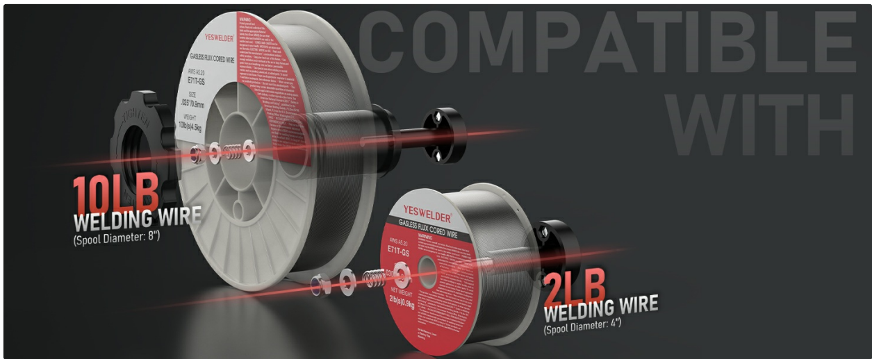
Figure 5.3: Illustration of compatible welding wire spool sizes.