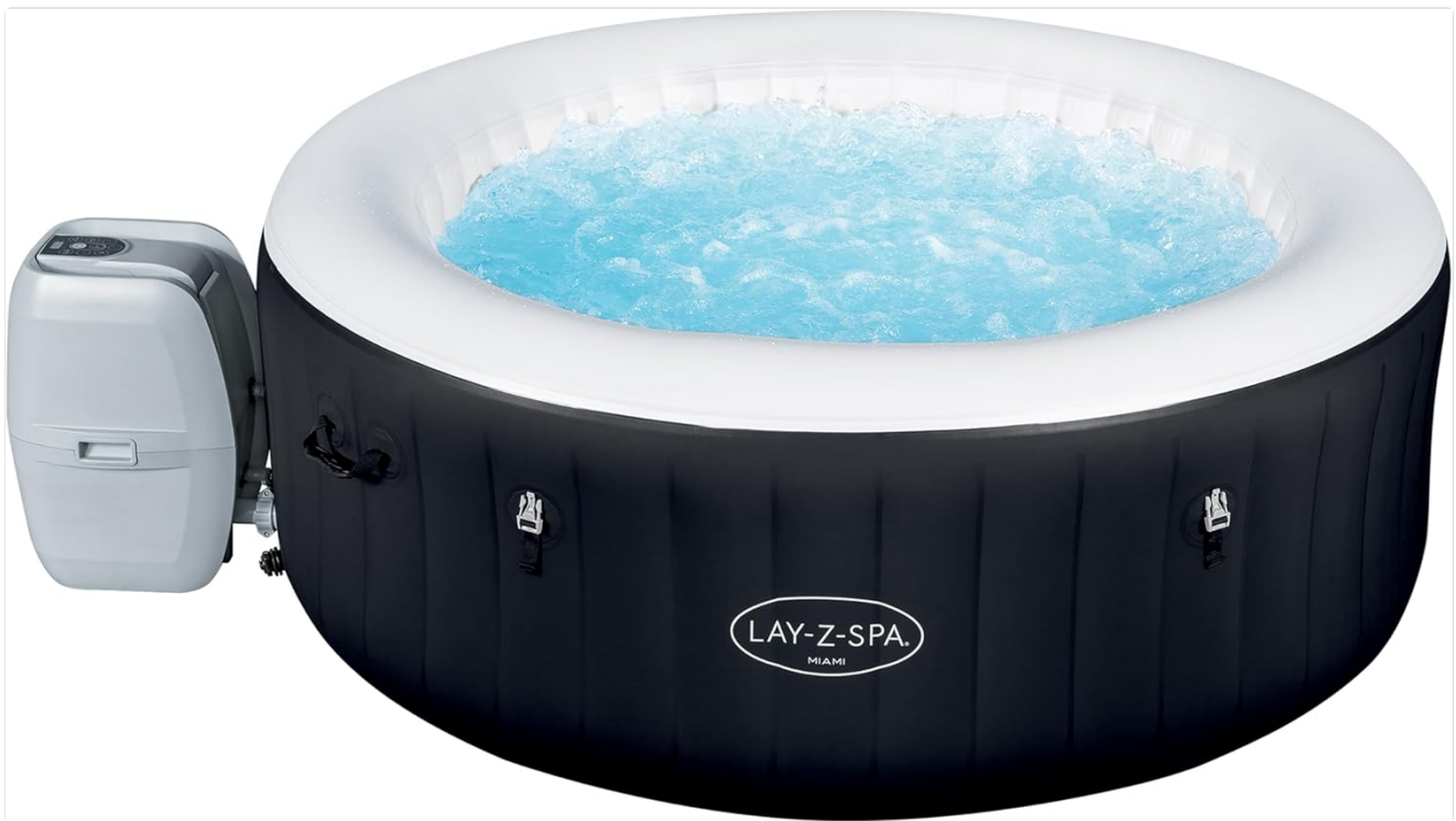
Image: The Lay-Z-Spa Miami AirJet hot tub fully set up with its external pump unit.