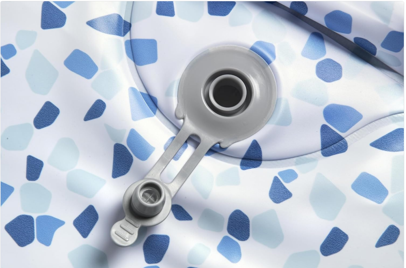
Image: A close-up of the hot tub's drain valve, designed for easy water removal.