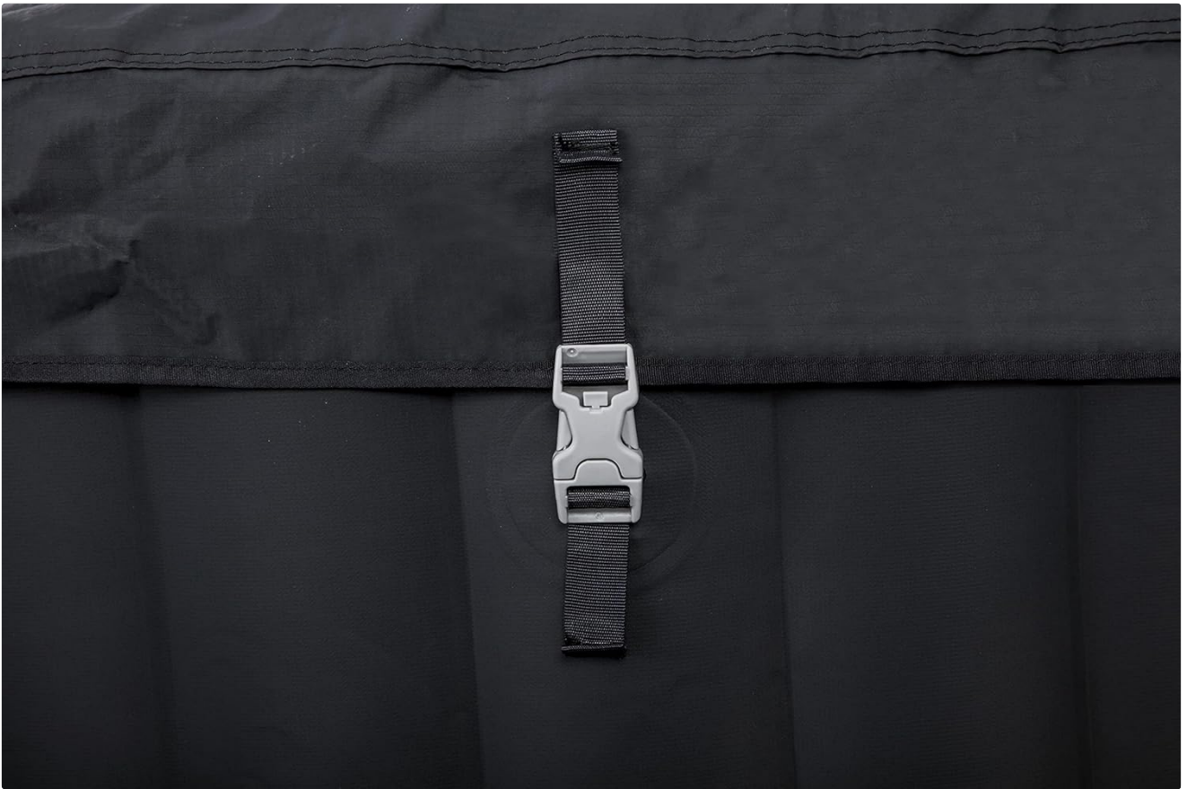
Image: A close-up of the durable buckle strap used to secure the hot tub cover, ensuring heat retention and protection.