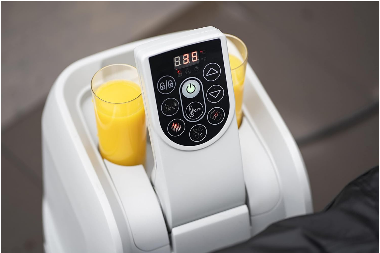
Image: A close-up view of the digital control panel, showing buttons for power, heating, AirJet activation, and temperature adjustment, with integrated cup holders.