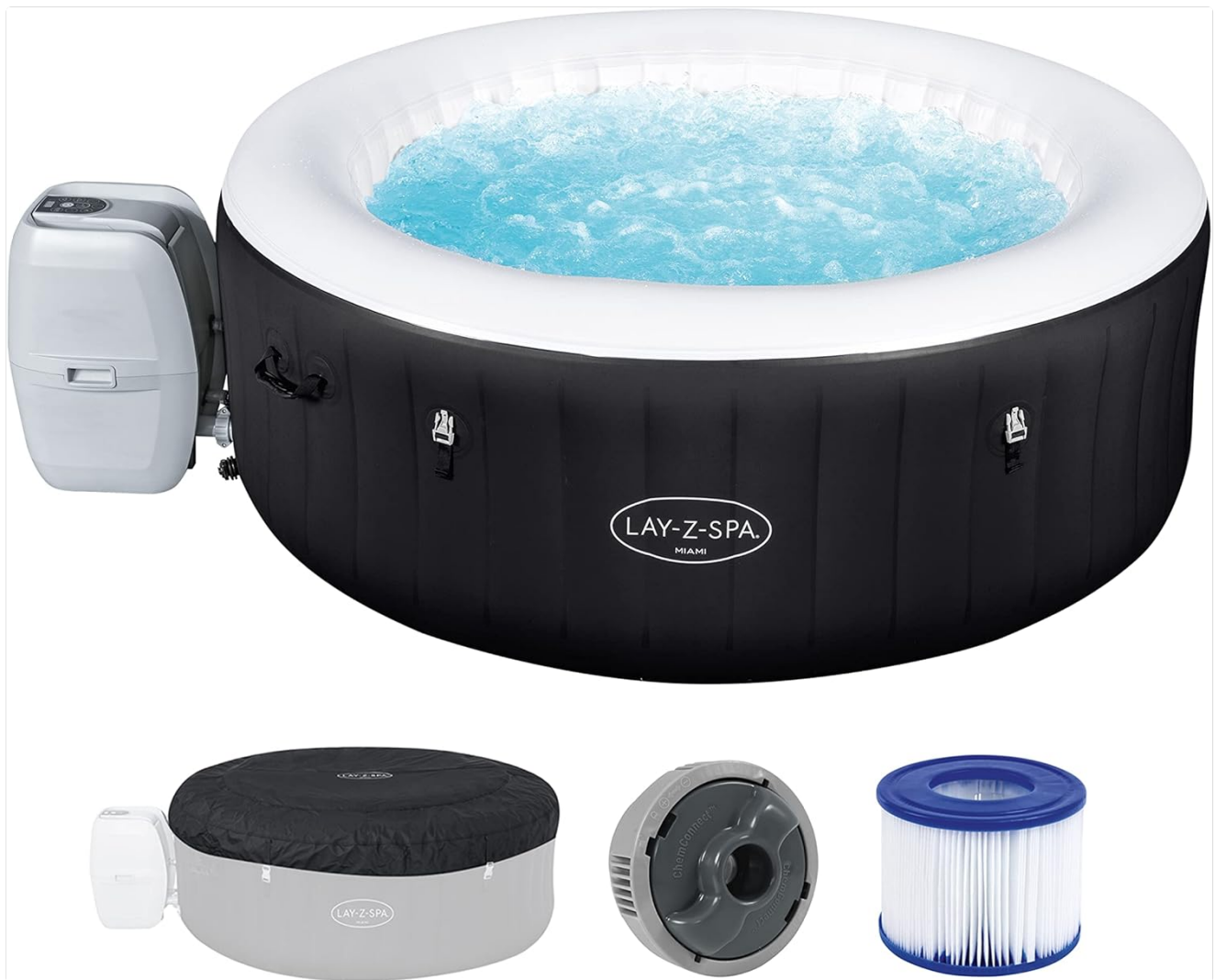
Image: The Lay-Z-Spa Miami AirJet hot tub shown with its included accessories: cover, ChemConnect dispenser, and filter cartridge.