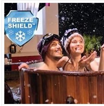
Graphic illustrating the Freeze Shield technology, which protects the spa pump and liner from freezing temperatures.