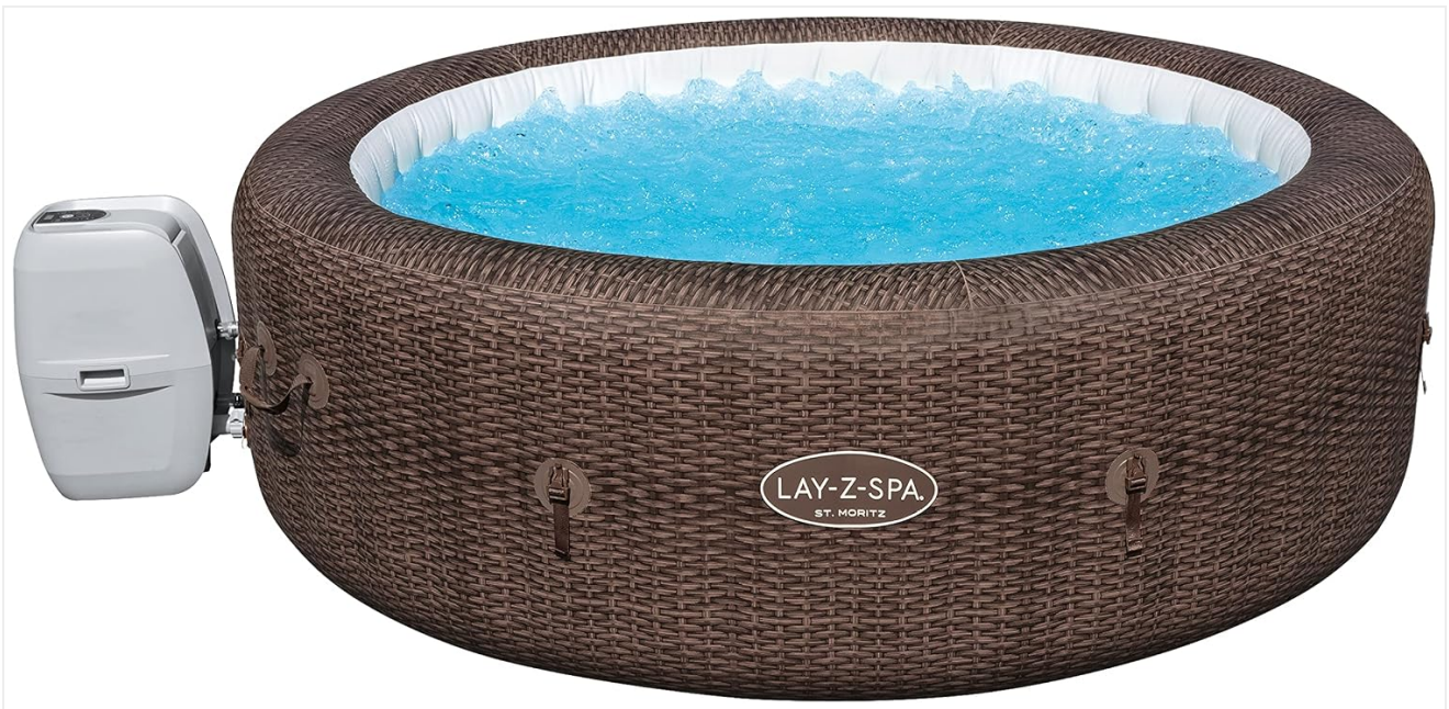
The Bestway Lay-Z-Spa St. Moritz Airjet inflatable spa with its external pump unit securely connected, ready for water filling.