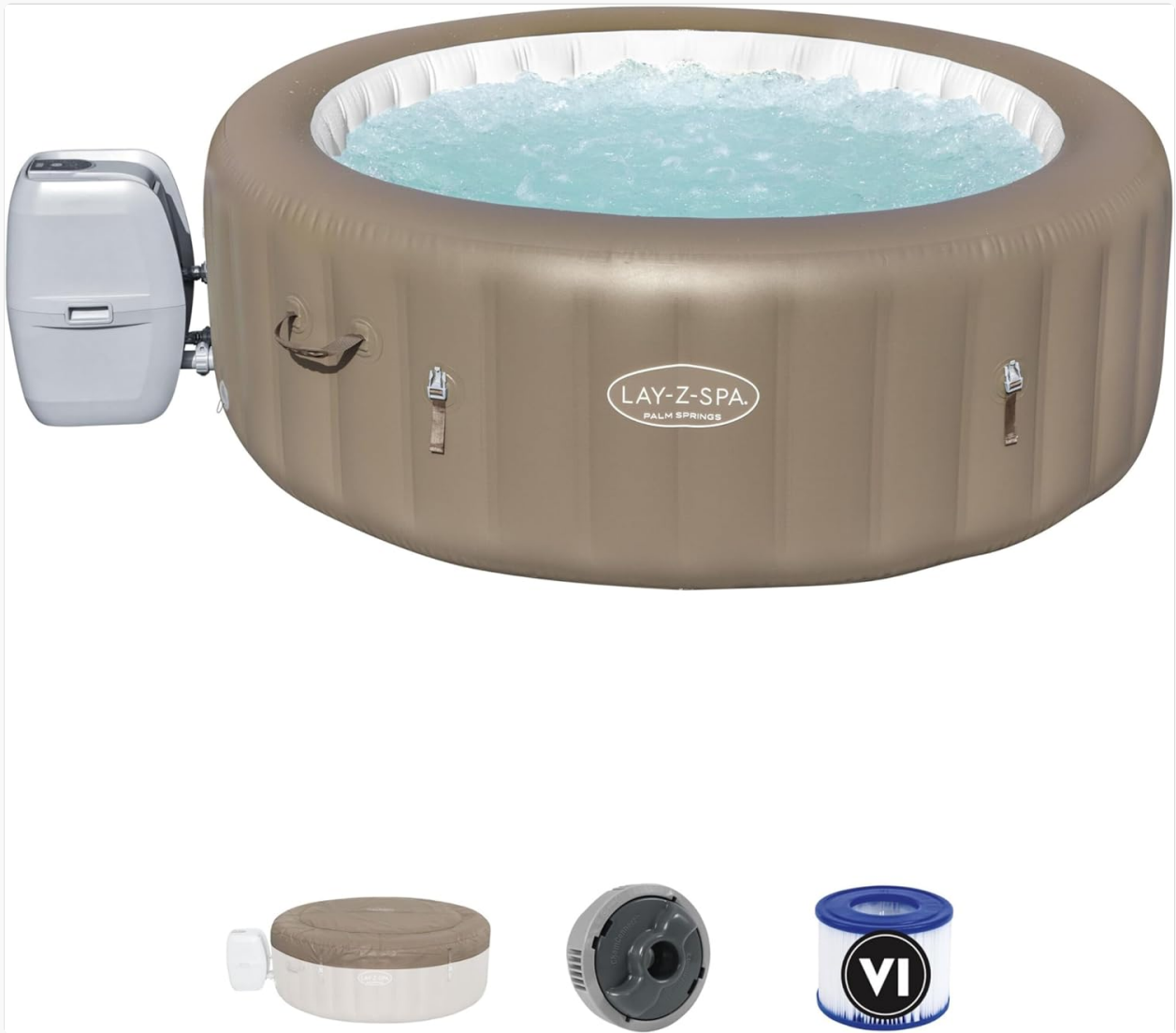
Figure 3.1: Main components of the Bestway Lay-Z-Spa Model 60017, including the inflatable spa, external pump unit, spa cover, and a filter cartridge.