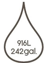
Figure 4.2: A technical diagram illustrating the inflated dimensions of the Lay-Z-Spa (196 cm x 71 cm / 77" x 28") and its 80% water capacity of 916 liters (242 gallons).