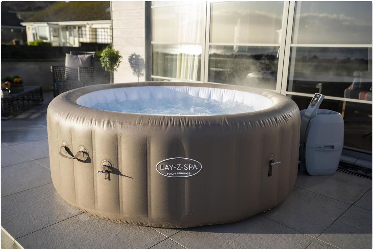
Figure 4.1: The Lay-Z-Spa positioned on a level outdoor patio, ready for use.