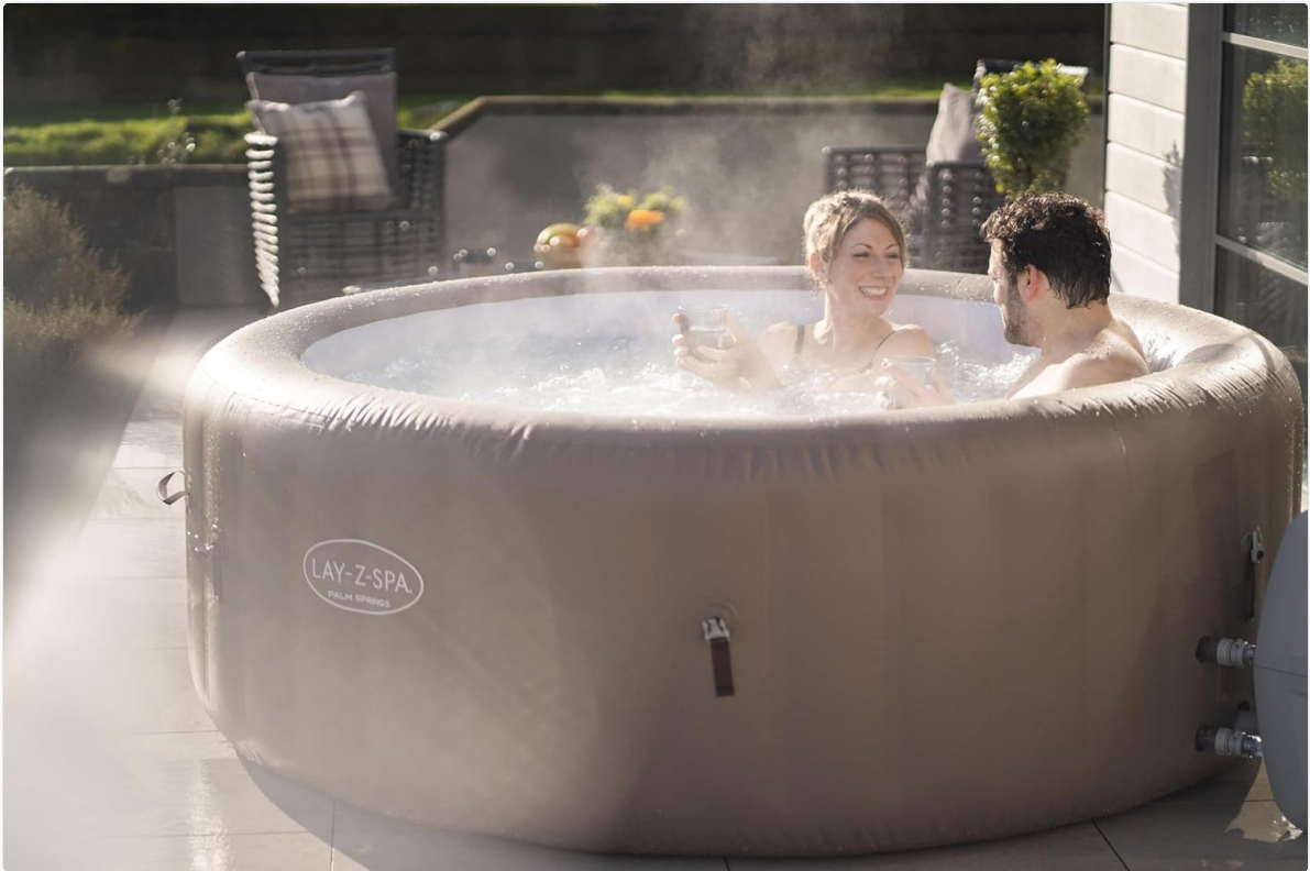
Figure 5.2: A couple relaxing in the Lay-Z-Spa, demonstrating the bubble massage feature in action.