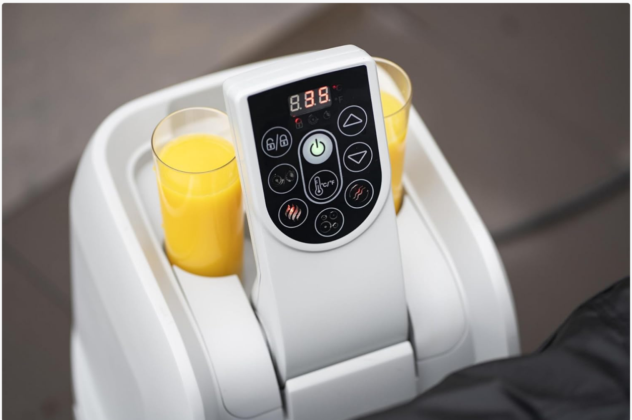
Figure 5.1: The digital control panel on the spa pump, featuring buttons for power, temperature adjustment, bubble activation, and timer settings.

Your Lay-Z-Spa is equipped with a user-friendly digital control panel.