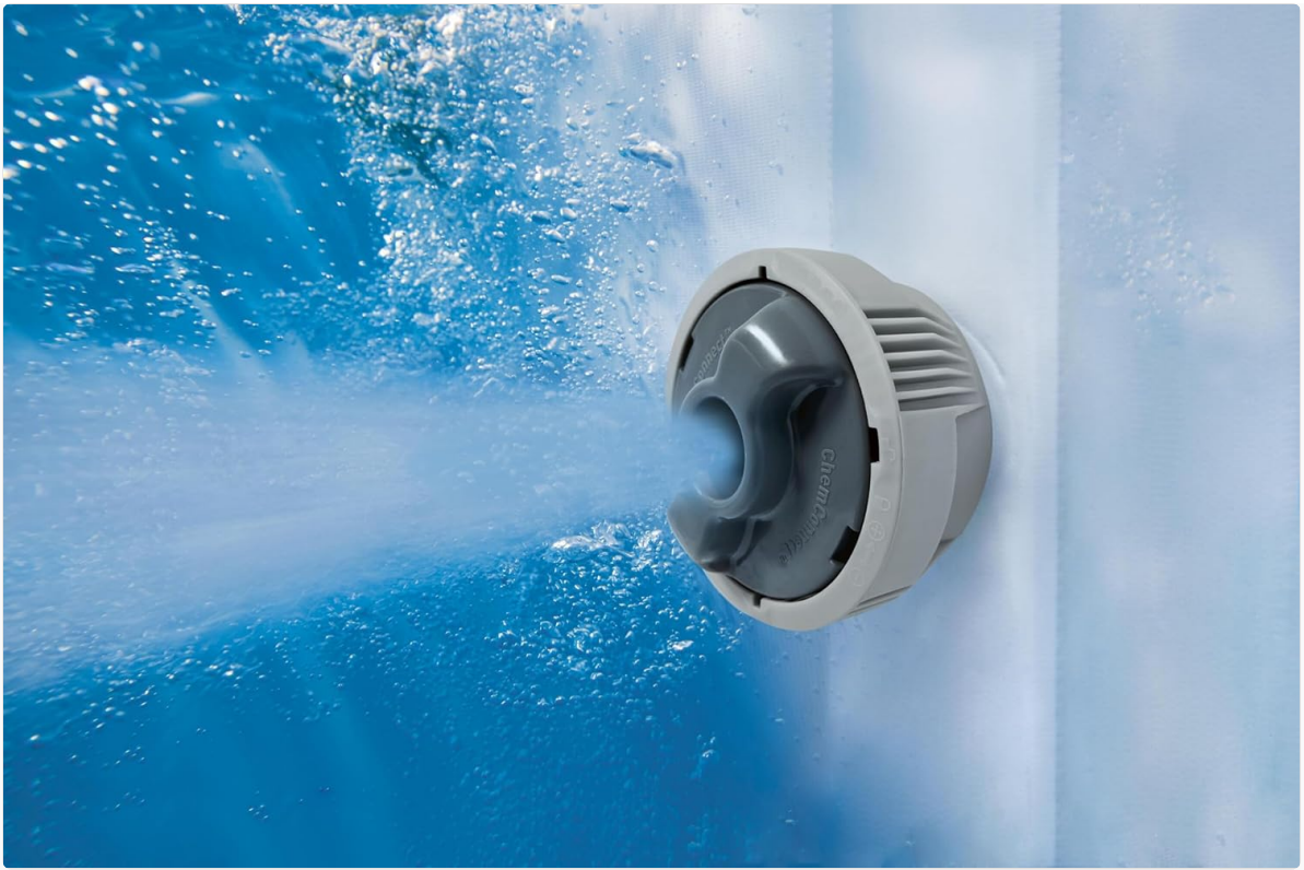
Figure 4.3: A detailed view of the ChemConnect™ dispenser, designed to release chlorine evenly into the spa water.