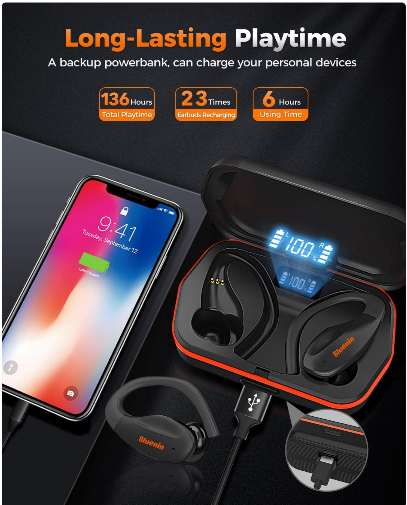
Image: The Bluenin T30 charging case acting as a power bank, illustrating its long-lasting playtime capabilities and ability to charge other devices.