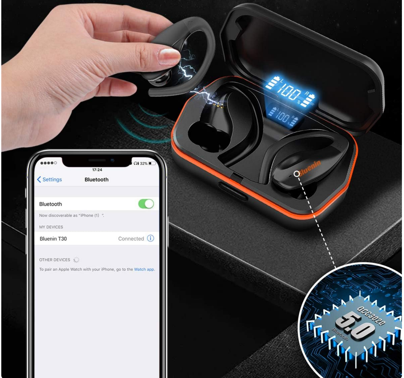
Image: A visual representation of the one-step pairing process, showing the earbuds connecting to a smartphone via Bluetooth.

Bluetooth 5.0 technology ensures an incredible stable and fast connection. Just take them out from the case, they will automatically paired and connected.