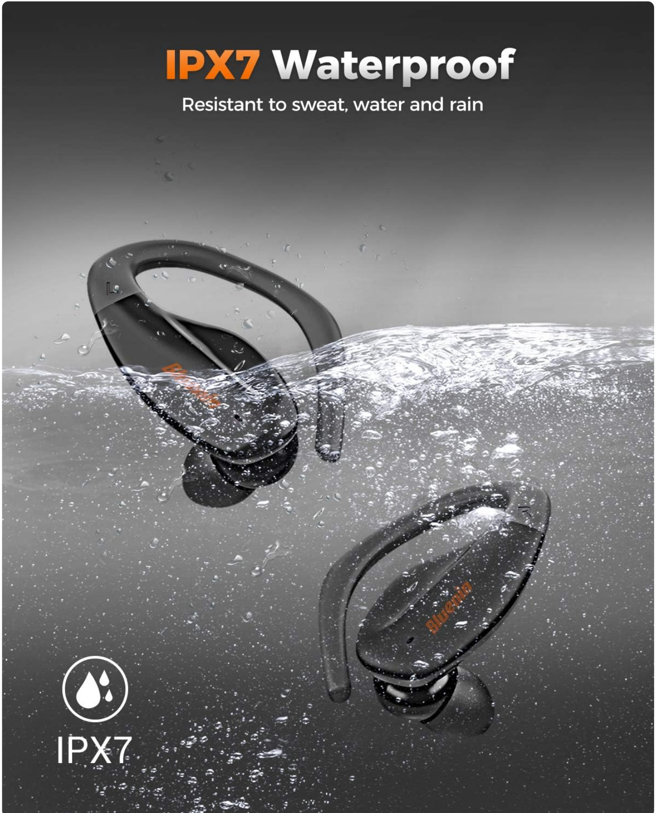
Image: The Bluenin T30 earbuds submerged in water, illustrating their IPX7 waterproof rating, making them resistant to sweat, water, and rain.