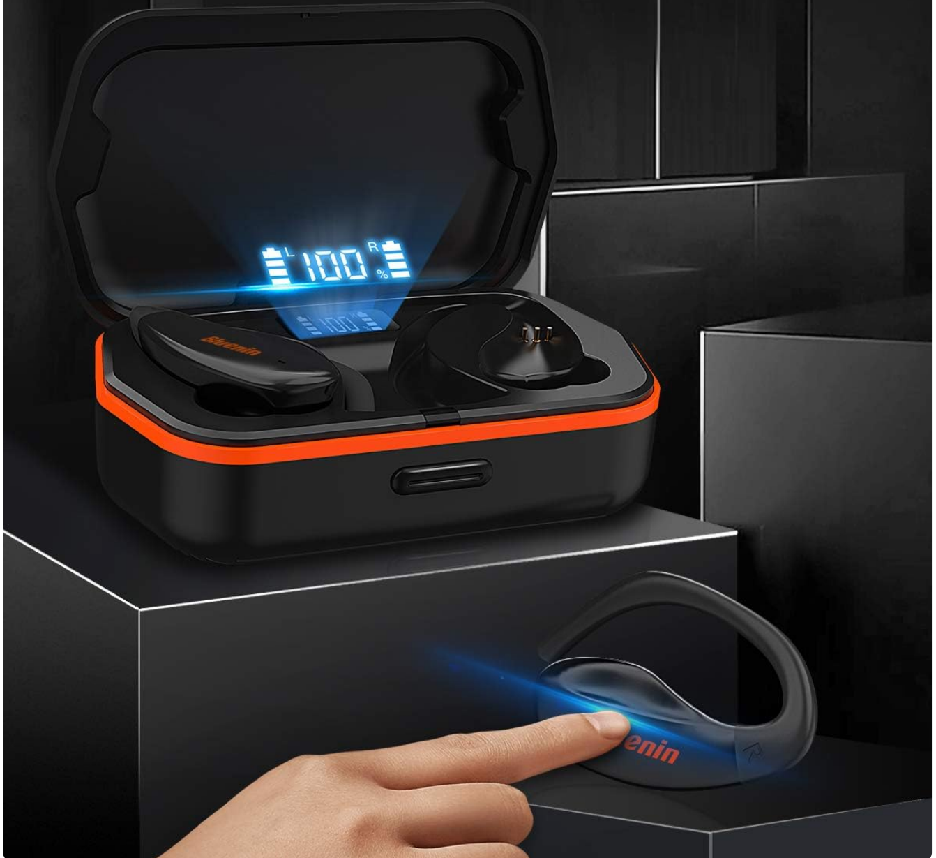
Image: An illustration detailing the various touch control functions available on the Bluenin T30 earbuds for media and call management.