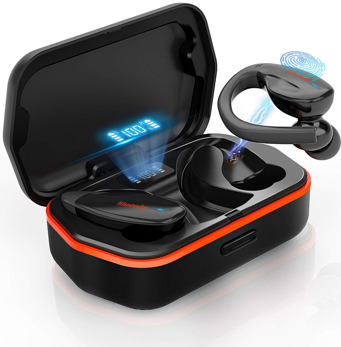
Image: The Bluenin T30 True Wireless Earbuds, showcasing their design and the charging case with a digital battery display.