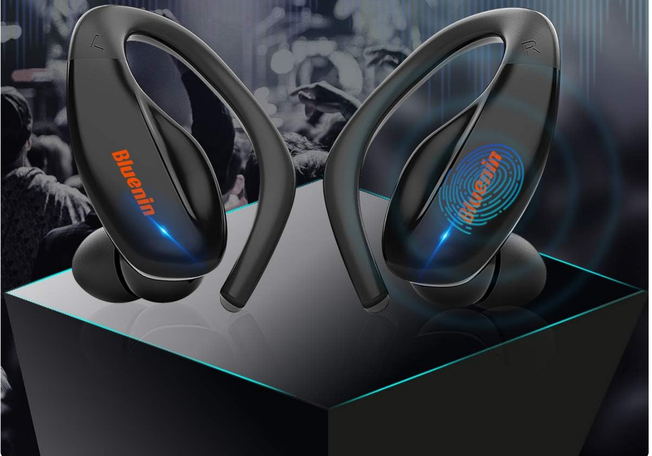
Image: Highlighting the premium HiFi sound, Bluetooth 5.0, and CVC 8.0 Noise Cancellation features of the Bluenin T30 earbuds.