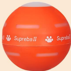
Dog ball toy