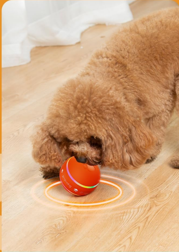
Touch Induction Activated