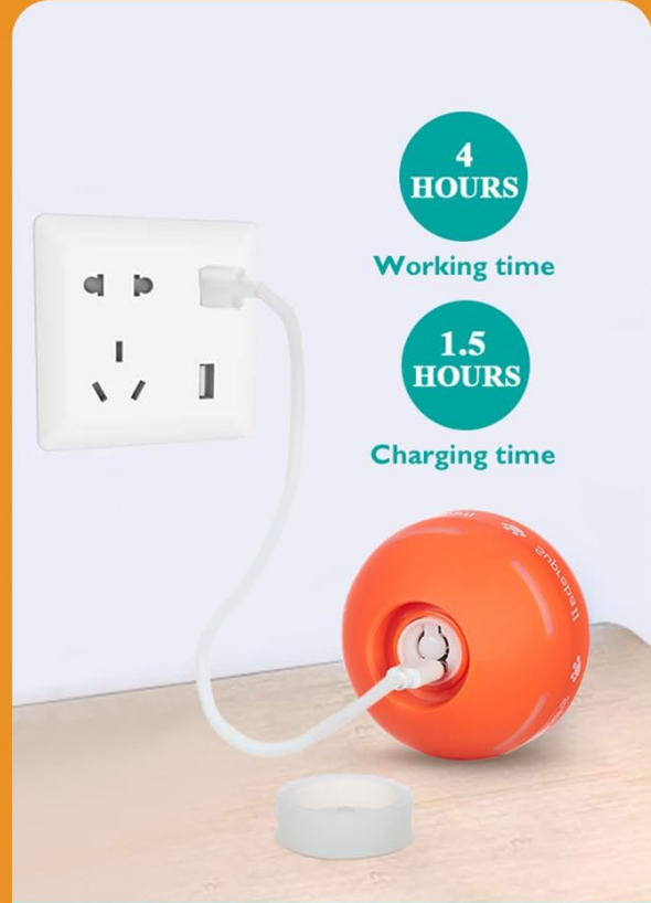
Charge 1.5 hours work for 4 hours