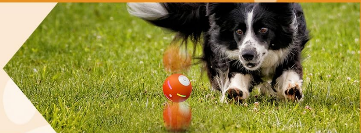
Figure 7: Steps to help your dog adapt to the new toy.