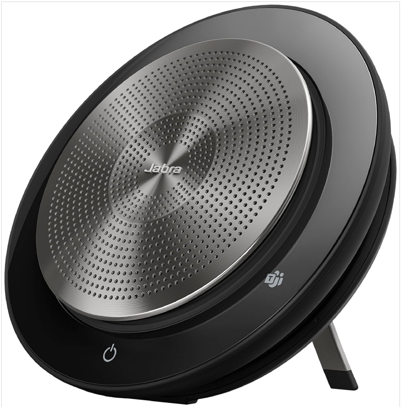
Image: The Jabra Speak 750 MS speakerphone, showcasing its sleek black and silver design with a built-in stand.