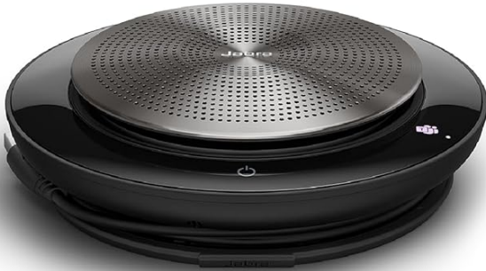
Jabra Speak 750 MS