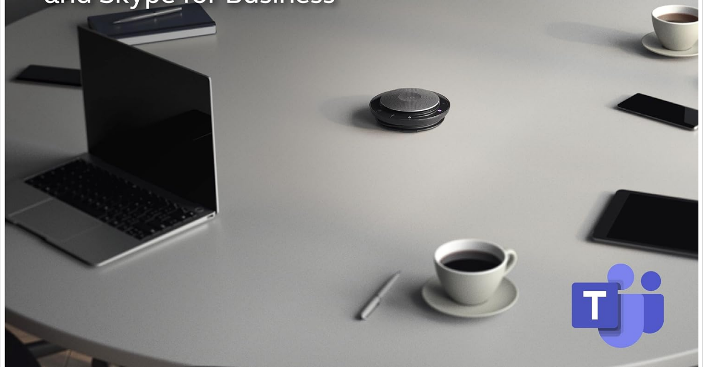
Image: The Jabra Speak 750 MS speakerphone centrally placed on a modern conference table, surrounded by laptops and coffee cups, highlighting its compatibility with various Unified Communications platforms.

including Microsoft Teams and Skype for Business