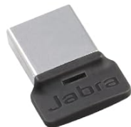
Jabra Link 370

Image: An illustration of the items included in the product package: the Jabra Speak 750 MS speaker, a protective carry pouch, and the Jabra Link 370 USB adapter.