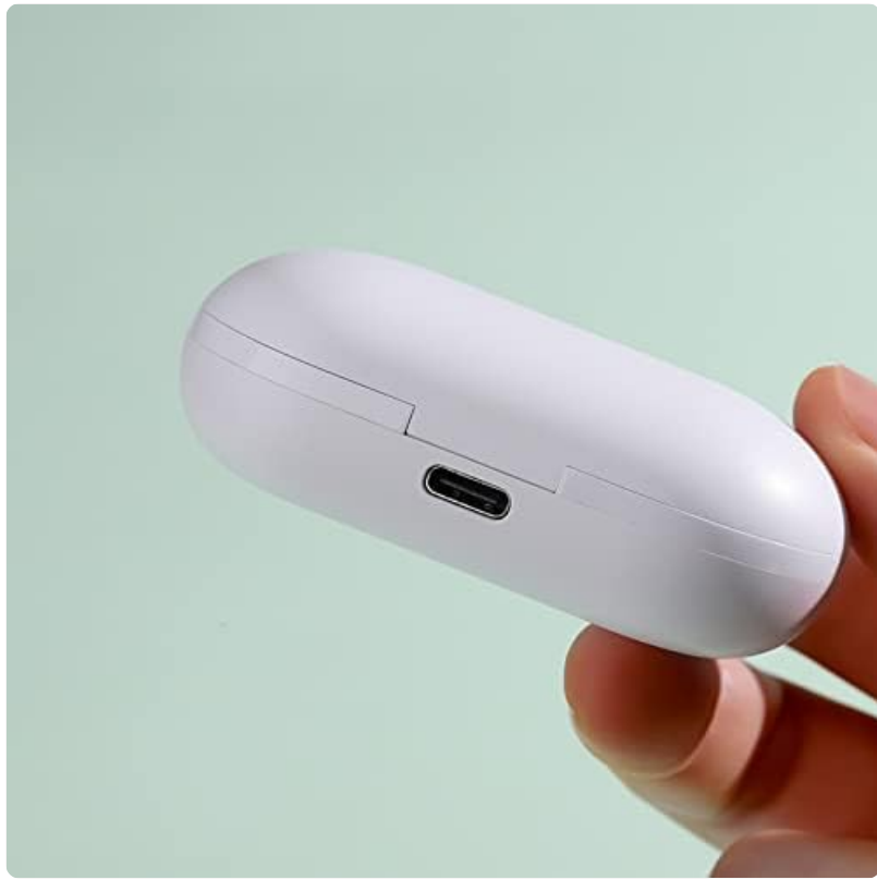
Image: Close-up of the charging port on the Joyroom JR-T09 charging case.