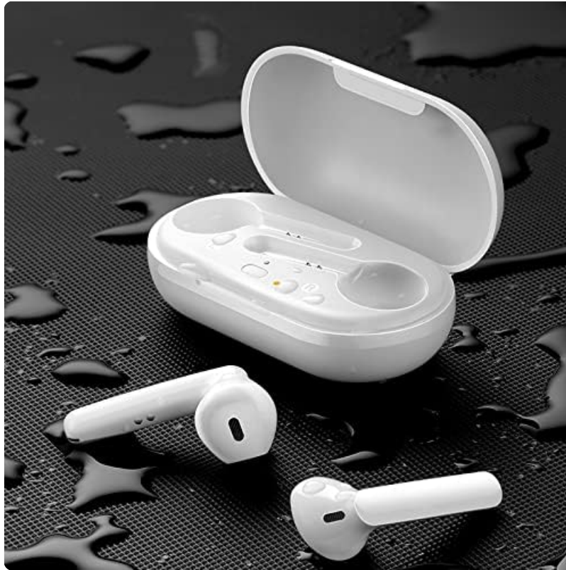
Image: Joyroom JR-T09 earbuds and case, illustrating their water-resistant design.