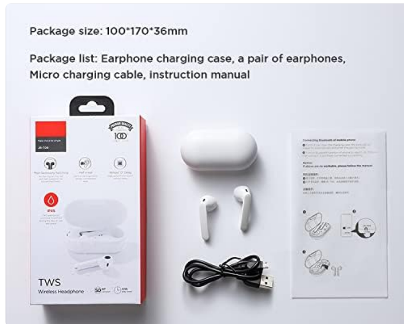
Image: Contents of the Joyroom JR-T09 package, including earbuds, charging case, and cable.