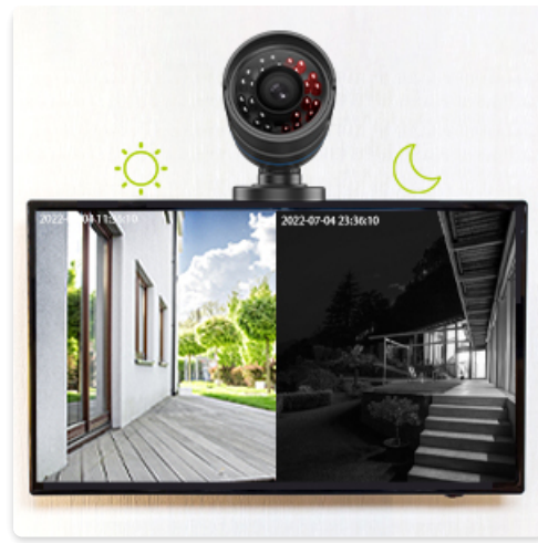
Image: Day and night vision display.