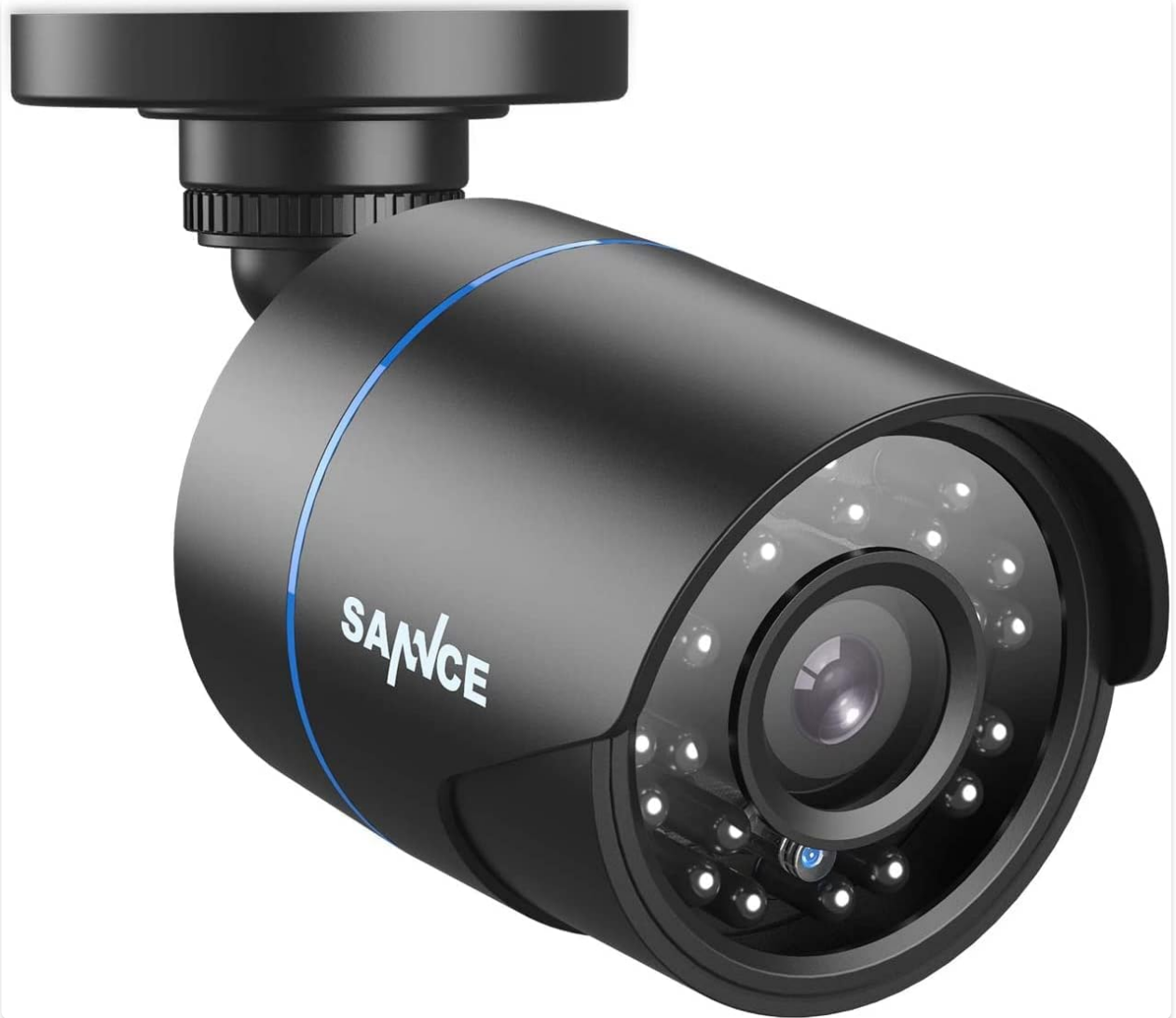
Image: SANNCE 1080P 4-in-1 Bullet Security Camera, front-angled view.