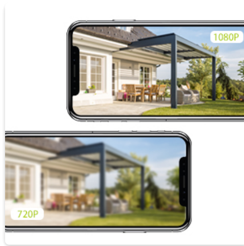
Image: Smartphone view comparing 720p and 1080p resolution.