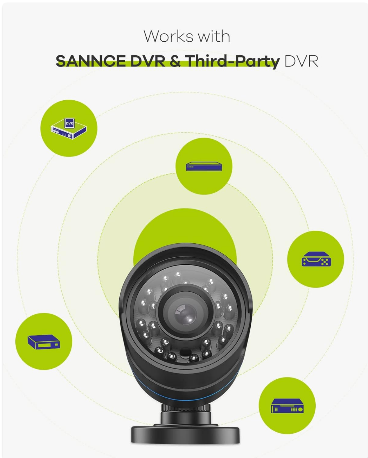
Image: Camera compatibility with SANNCE and third-party DVRs.

The SANNCE C51 camera is compatible with SANNCE DVRs and most third-party analog DVRs that support 2MP, 3MP, 5MP, or 8MP resolutions, depending on the selected output mode.