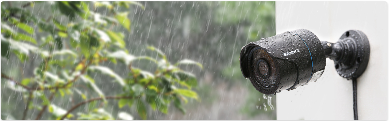
Image: Camera installation on a wall.