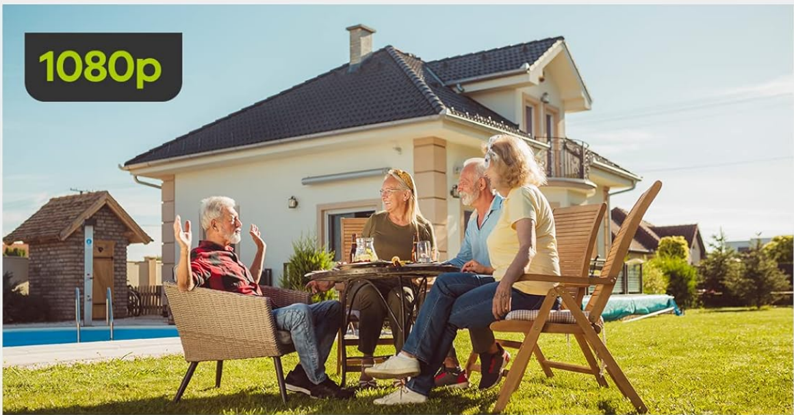
Image: Comparison of 720p vs 1080p video quality.