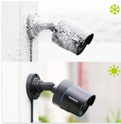
Image: Camera resilience in cold and warm temperatures.