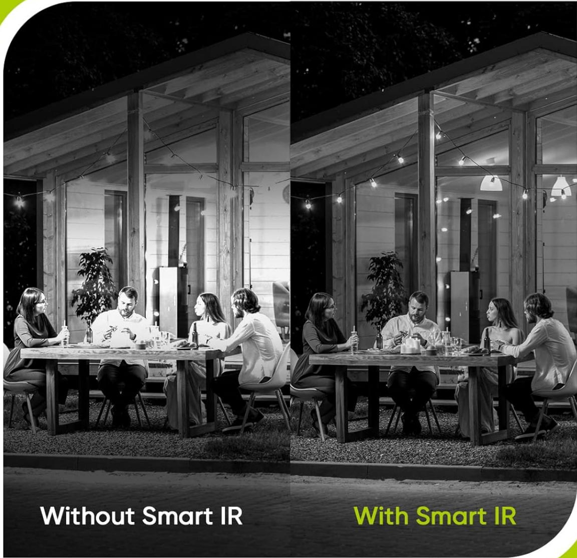
Image: Night vision comparison with and without Smart IR.