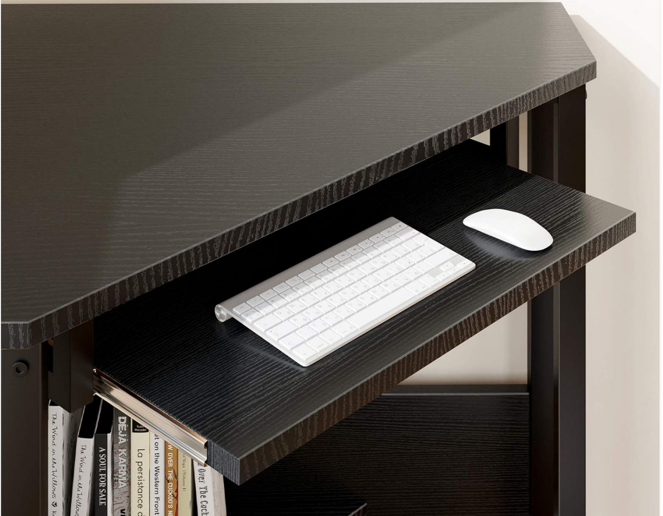
Image 5.1: The pull-out keyboard tray, designed to store your keyboard and mouse, optimizing desktop space.