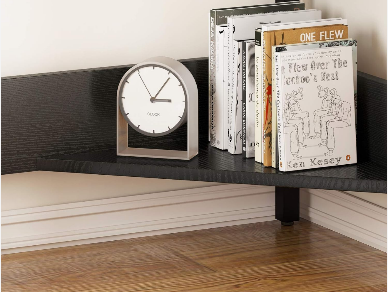
Image 5.2: The lower storage shelf, ideal for organizing books and other office essentials.

| Get things organized, get yourself concentrated.