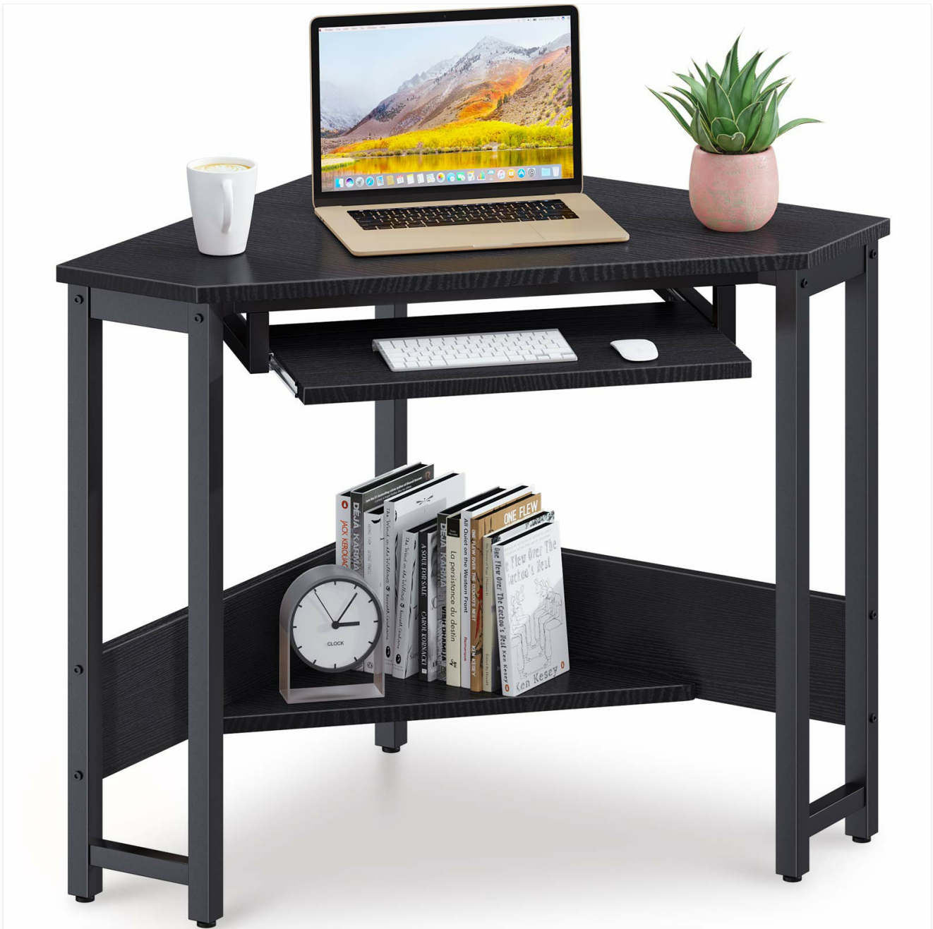
Image 1.1: The ODK Corner Desk, showcasing its compact design and utility in a modern room.