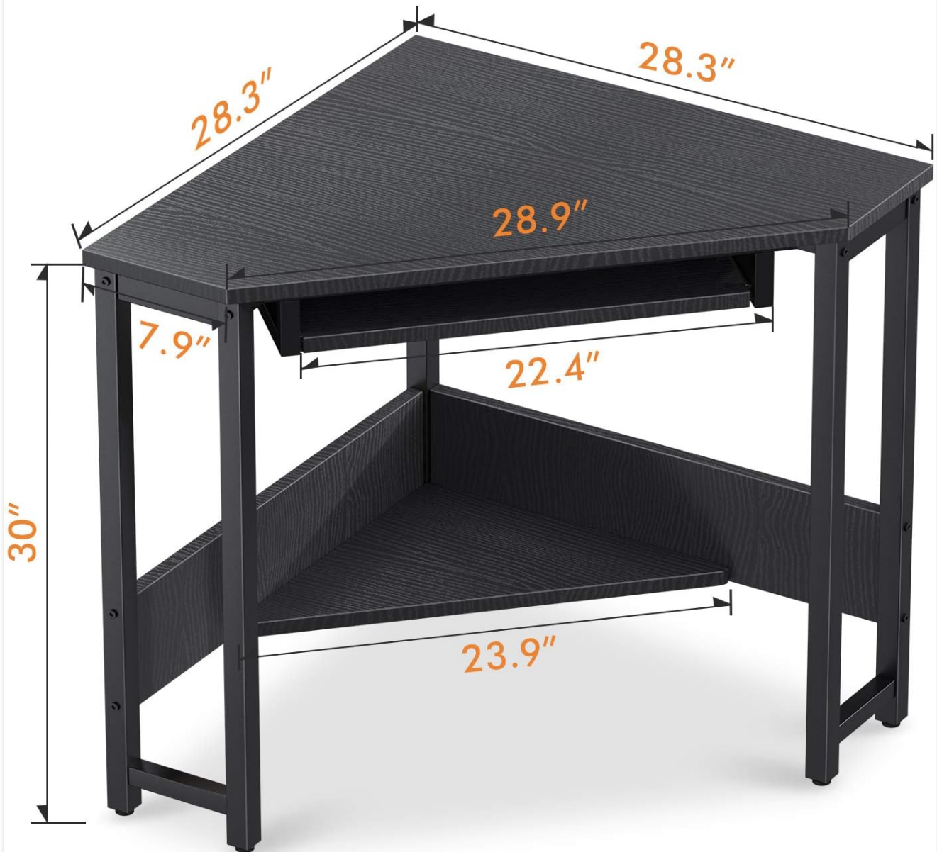
Image 4.1: Dimensional diagram of the ODK Corner Desk, showing its triangular shape and measurements.