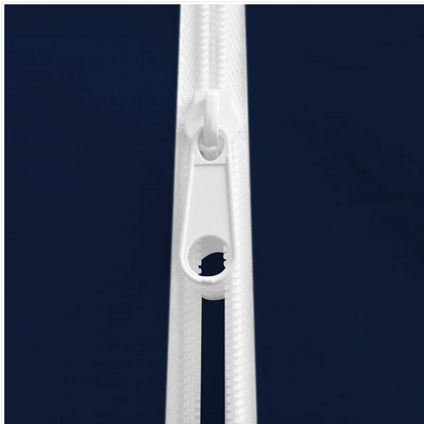
Figure 5: Detail of the zipper on the door panel, providing easy access to the tent interior.