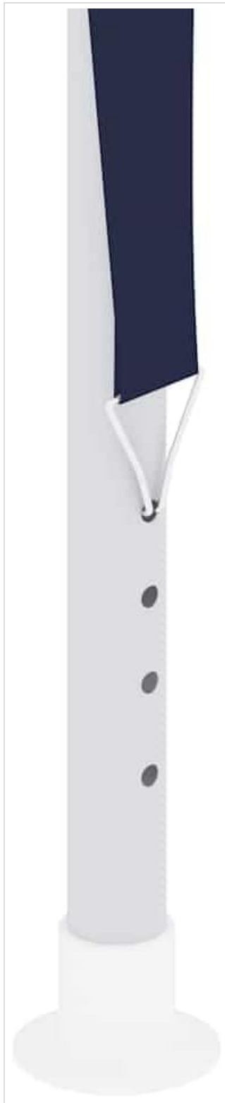
Figure 3: Tent leg pole detail, showing the attachment point for the tent fabric and the base for ground stability.