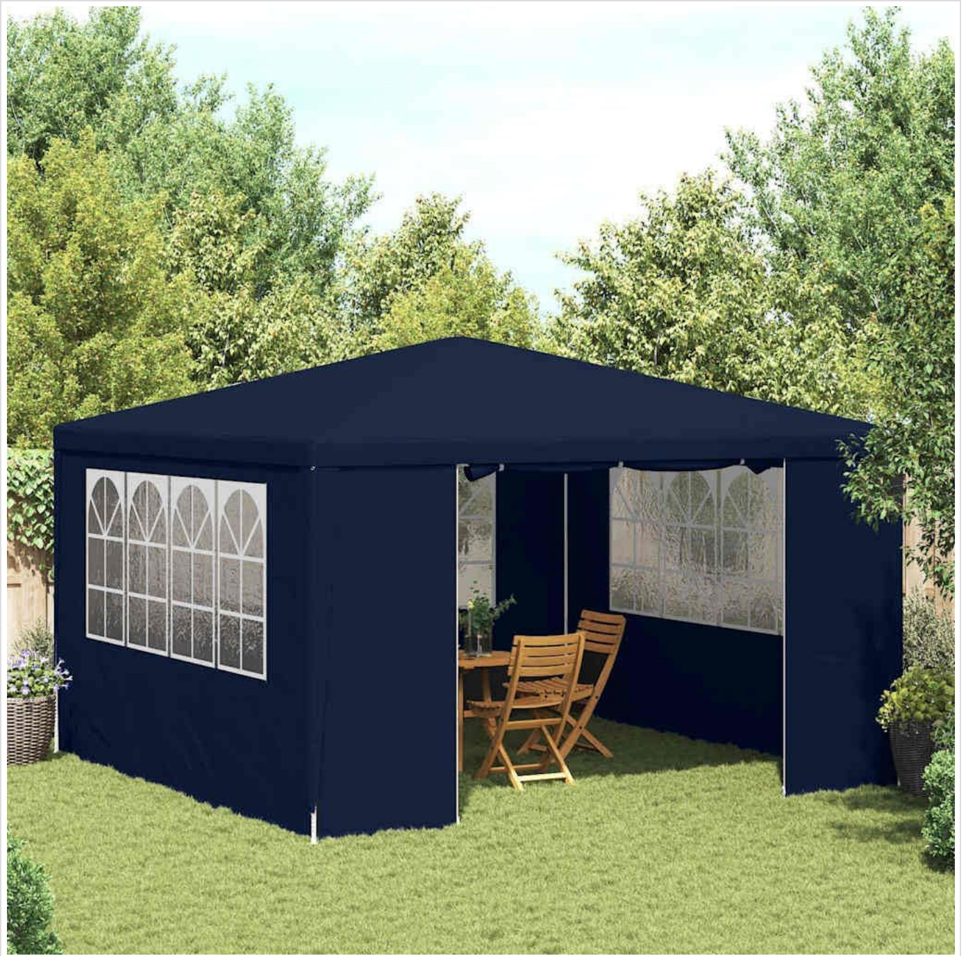
Figure 4: The vidaXL party tent set up in an outdoor environment, showcasing its use for gatherings.