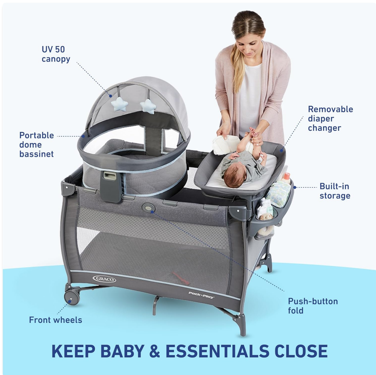
Figure 2: Labeled diagram highlighting key features such as the portable dome bassinet, removable diaper changer, built-in storage, push-button fold, and front wheels.