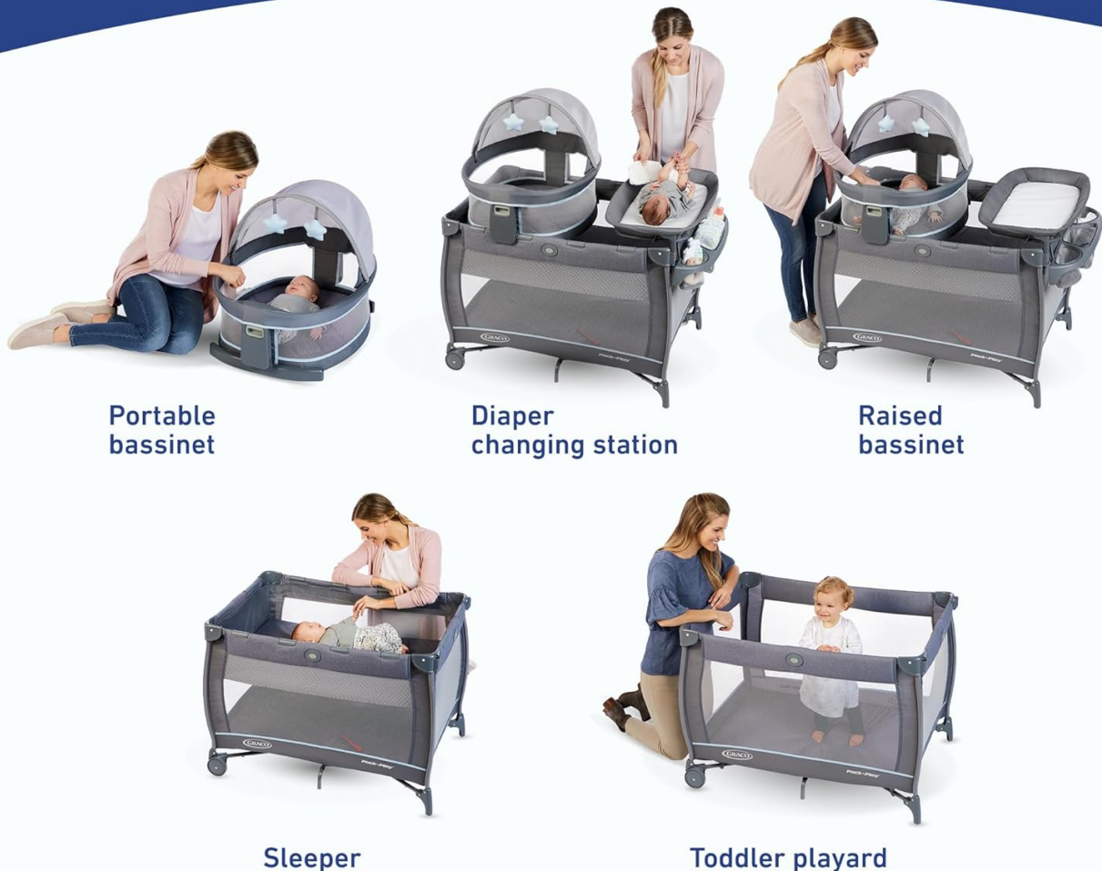
Figure 3: Visual representation of the five different configurations: portable bassinet, diaper changing station, raised bassinet, sleeper, and toddler playard.