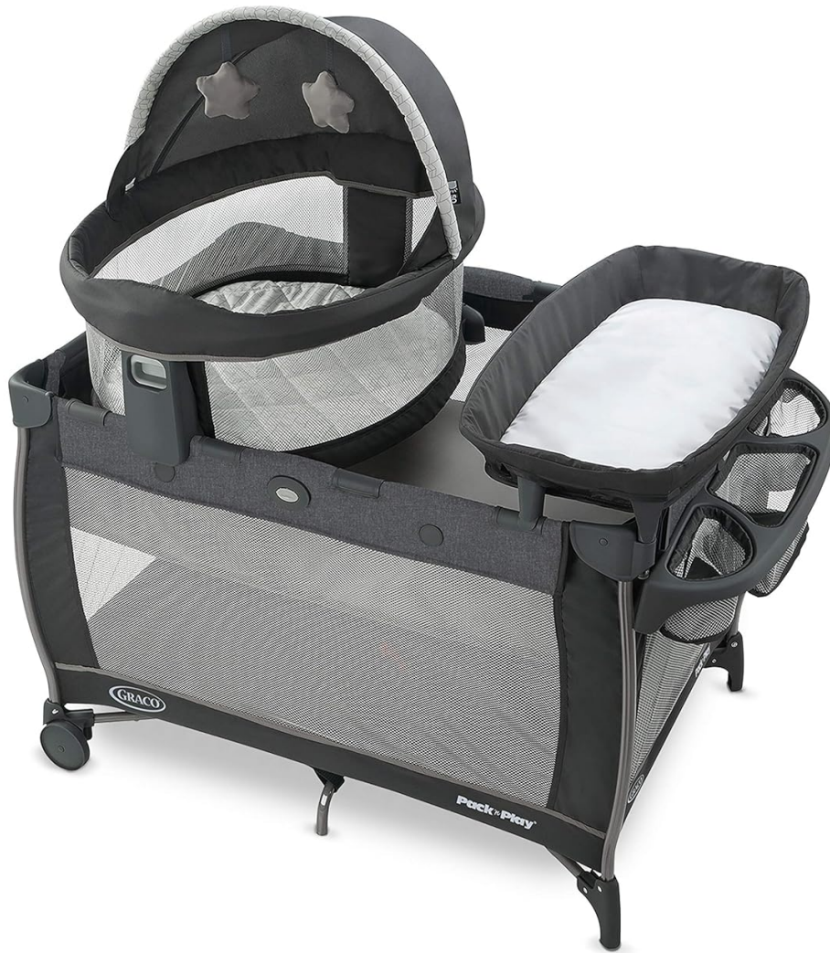
Figure 1: Overview of the Graco Pack 'n Play Dome LX Playard with all components assembled.