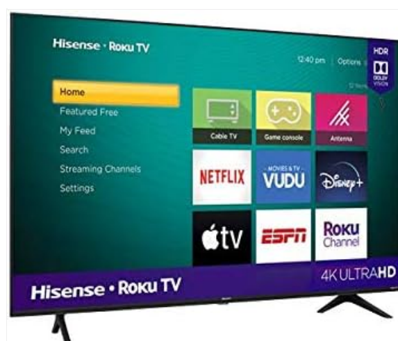
A view of the Hisense Roku TV's home screen, displaying popular streaming applications like Netflix, Prime Video, and Disney+, along with various input options.

The Roku TV OS provides a simple, customizable home screen where you can access streaming channels, live TV, and connected devices. Navigate using the remote control's directional pad.