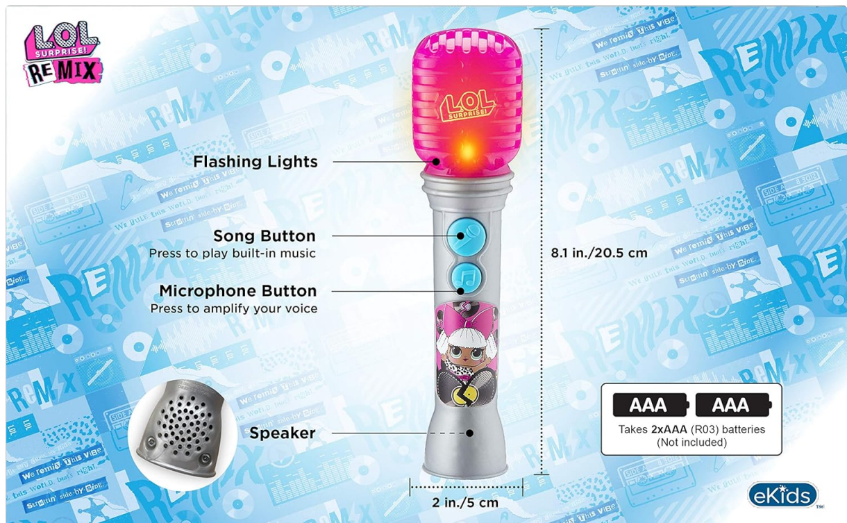
Image: Front view of the eKids LOL Surprise OMG Remix Toy Microphone, highlighting the Microphone Button, Song Button, Speaker, and Flashing Lights area. Dimensions are also shown.