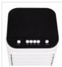
Figure 4.1: Top view of the control panel with various function buttons.

The control panel on the top of the unit allows you to manage all functions.