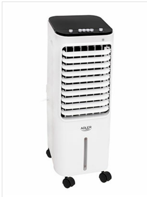
Figure 3.1: The evaporative cooler positioned in a living space, demonstrating its portable nature.