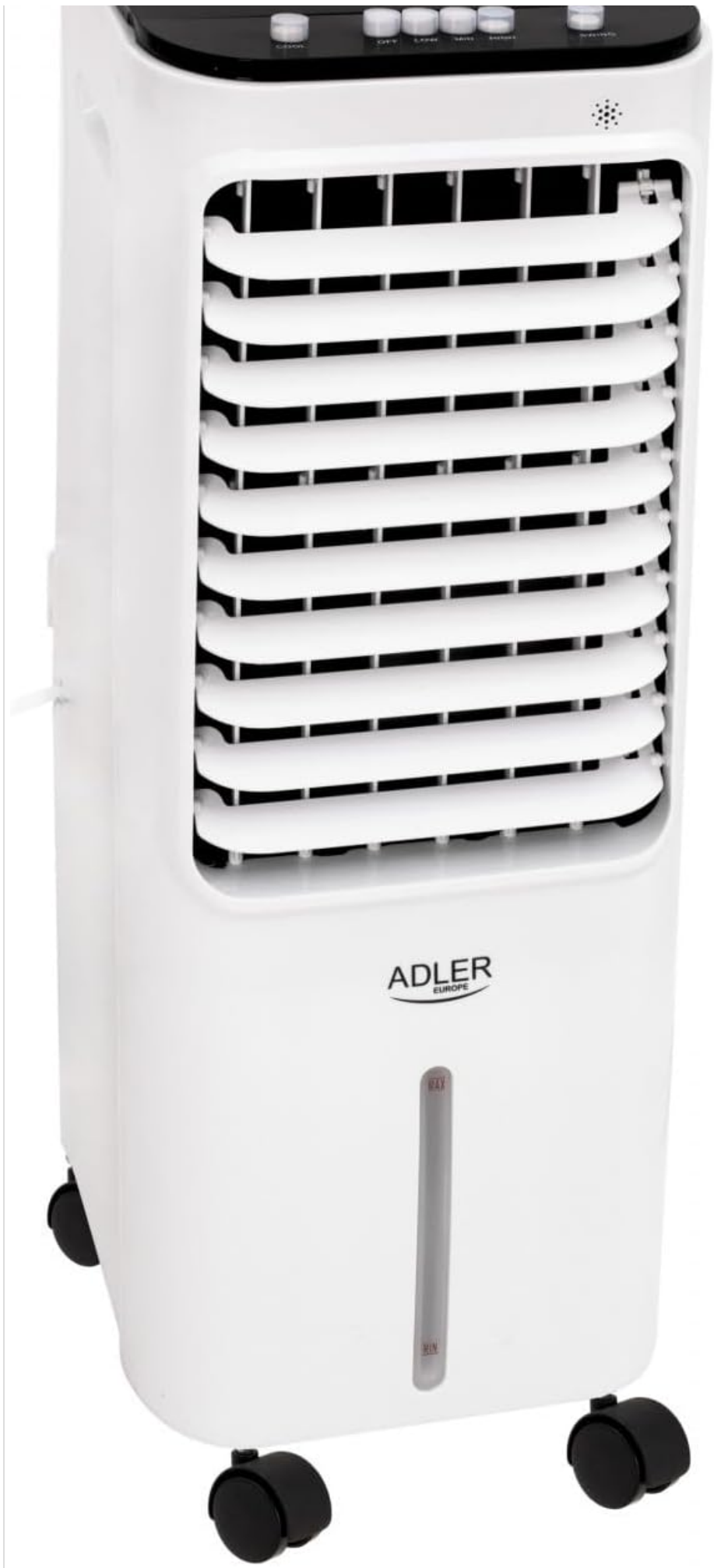
Figure 2.1: Front view of the ADLER AD 7913 Evaporative Cooler, showing the air outlet, control panel, and water level