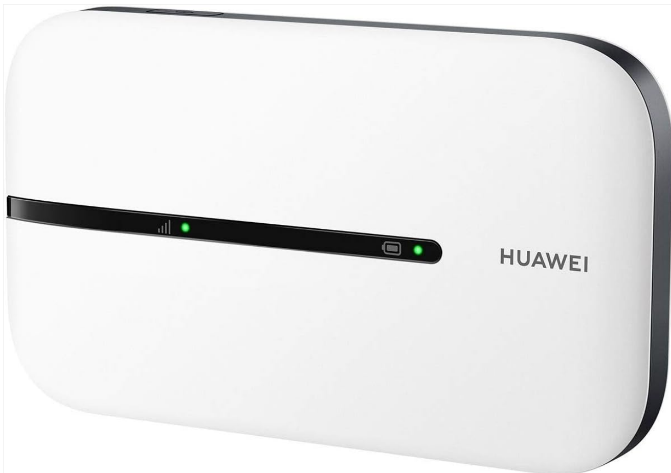
Figure 1: Front view of the Huawei E5576-320 Mobile WiFi device, showcasing its compact white design with indicator lights.

The Huawei E5576-320 Mobile WiFi is a portable 4G wireless router designed to provide high-speed internet access on the go. It allows you to connect multiple devices simultaneously to a secure Wi-Fi network using a mobile SIM card. This manual provides essential information on setting up, operating, maintaining, and troubleshooting your device.