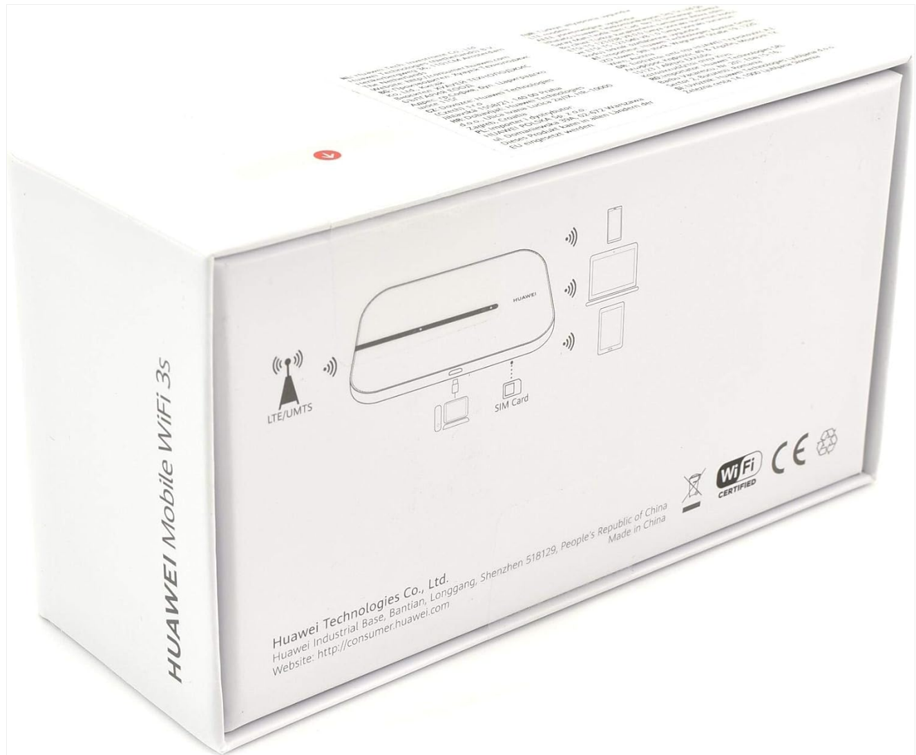
Figure 2: Retail packaging of the Huawei E5576-320, showing the model number and branding.