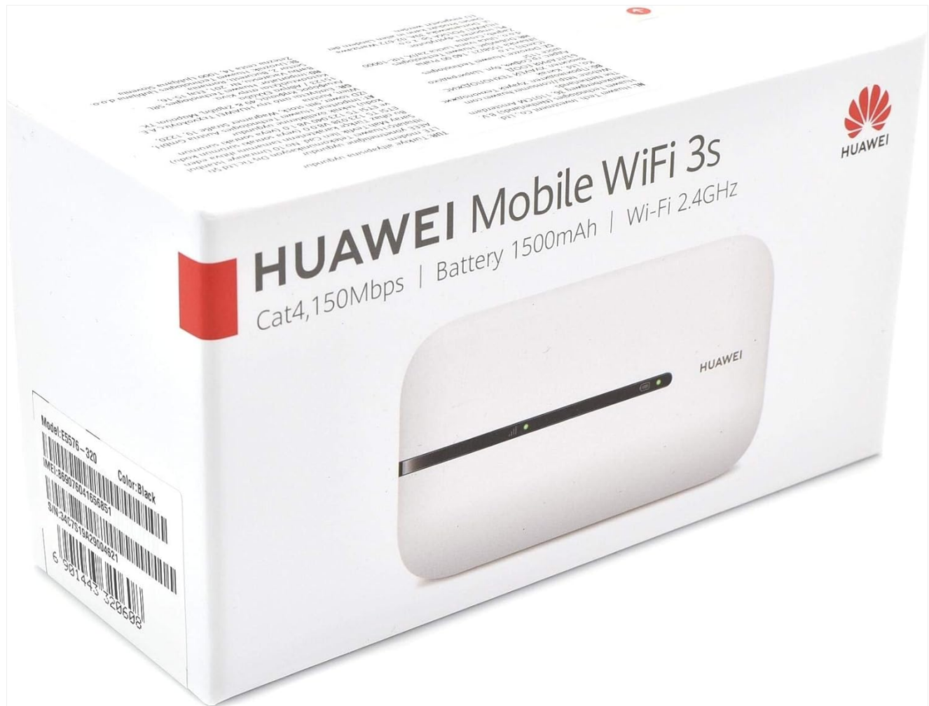
Figure 6: Side of the retail box, illustrating device connectivity and providing the official HUAWEI consumer website address for support.