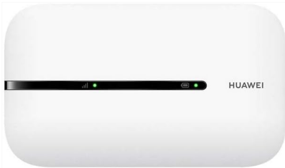
Figure 3: Close-up of the device's front panel, highlighting the signal strength and battery/network indicator lights.